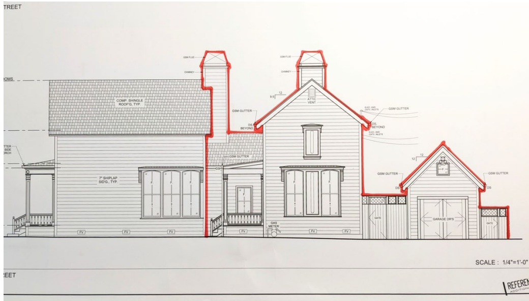
Existing South Elevation. Red line indicates 1992 addition