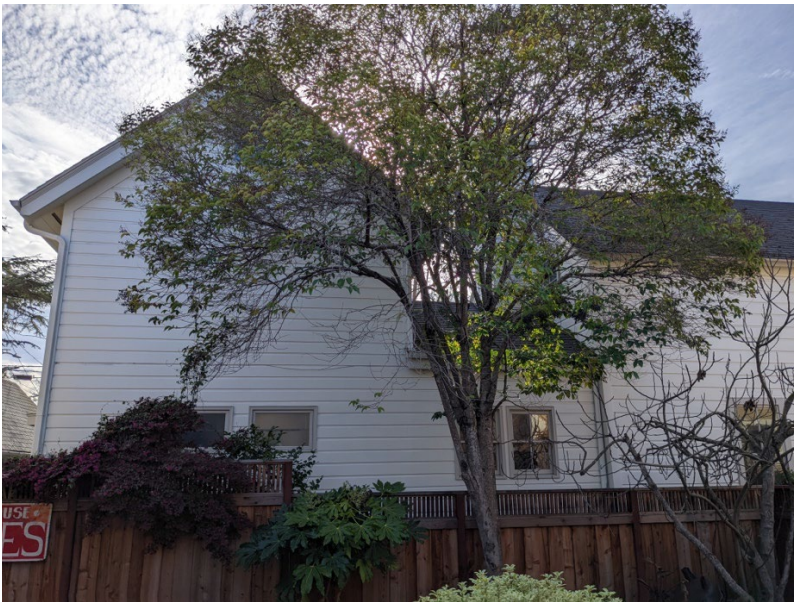
North elevation (from neighbor's yard). The 1992 addition begins at the drainpipe to the right of the single-hung windows behind the tree and includes everything to the left edge of the photo.