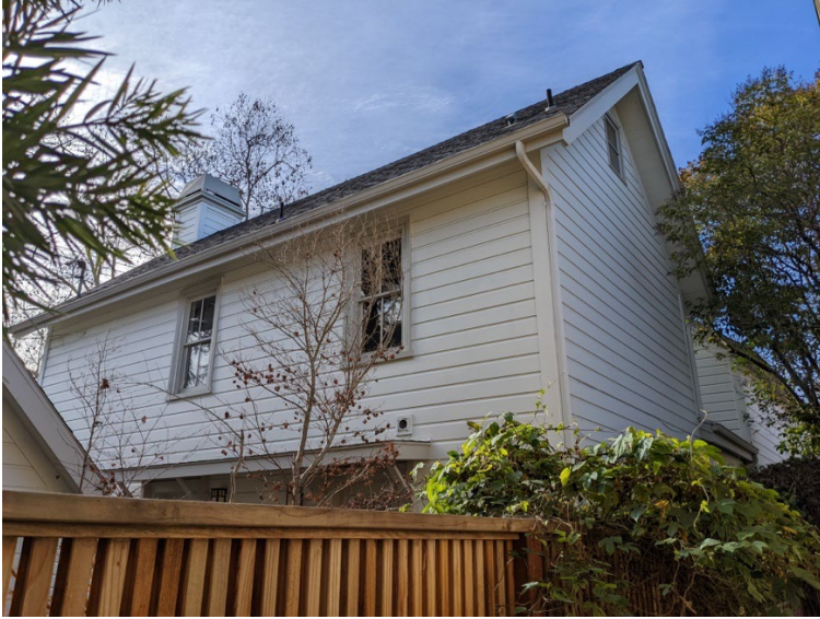
View of the 1992 addition from the northeast.