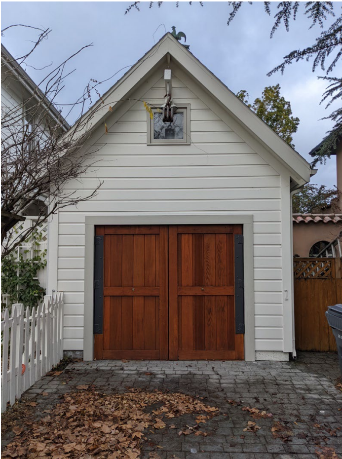
Garage is part of the 1992 addition.