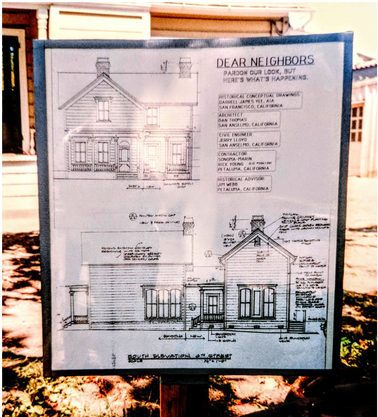
Signboard posted during the 1992 construction. Note that the proposal featured authentic chimneys that were not constructed. The brick-faced chimneys are more in line with what we're proposing.