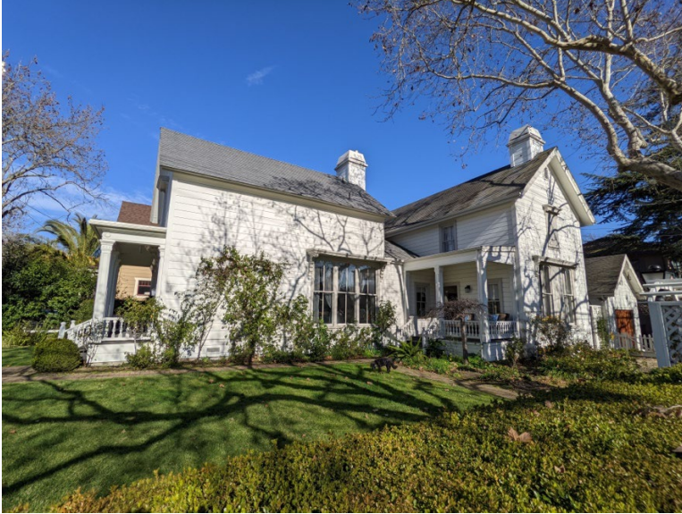
View from the southwest. From this angle the original construction from 1860 ends at the right-hand edge of the triple window.