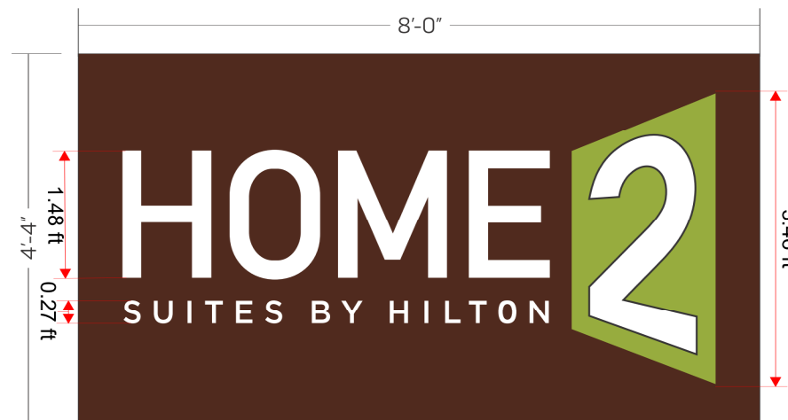
MONUMENT SIGN SCALE: 1/2" = 1'-0"

*Monument engineering shows structure can accommodate adding signage