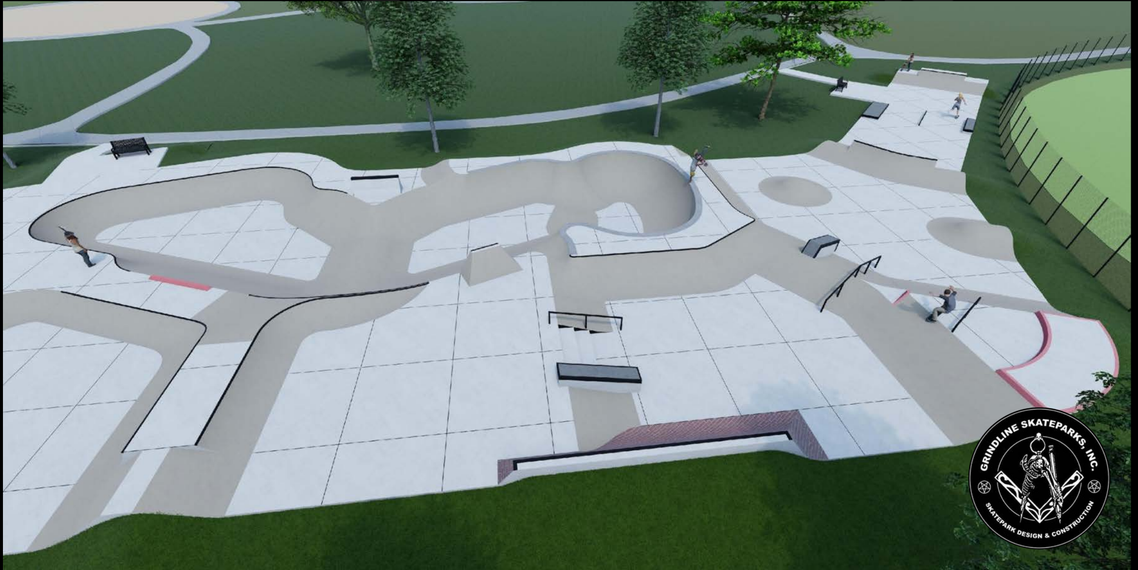
PETALUMA SKATEPARK PROJECT