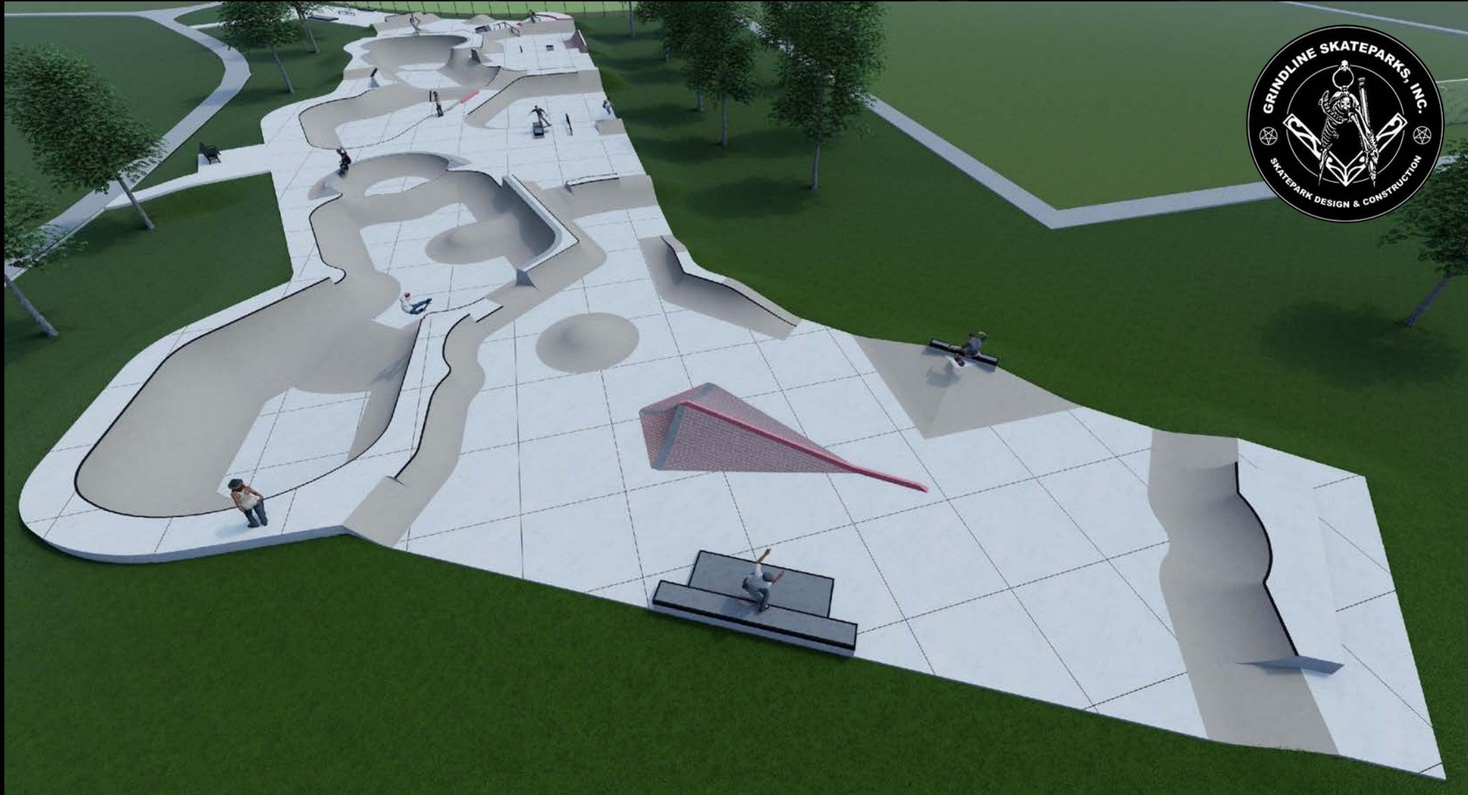
PETALUMA SKATEPARK PROJECT