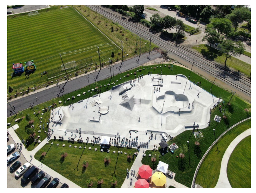
Riverside Skatepark (Detroit, MI) - Designed & Constructed by Grindline