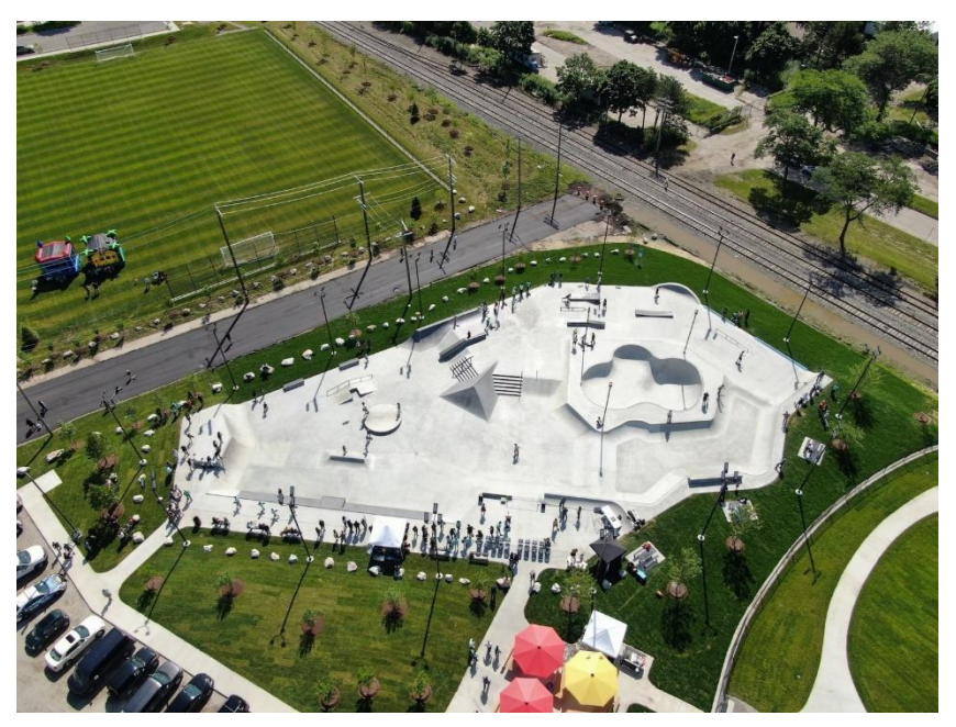
Riverside Skatepark (Detroit, MI) - Designed & Constructed by Grindline