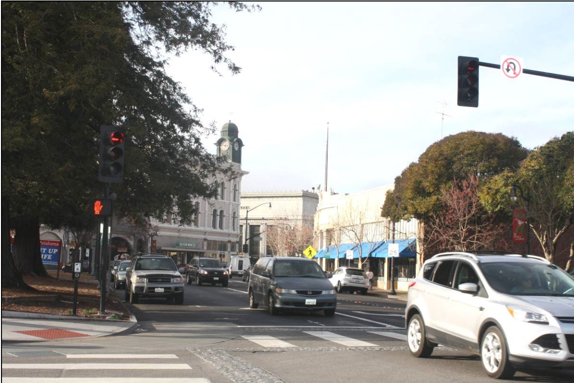
Photo 11: Center Park on left, Masonic Building in center, Old Post Office on right