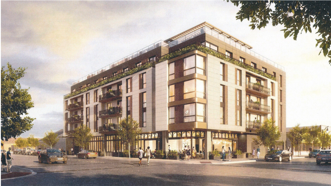
Figure 1: Rendering of the EKN Appellation Hotel from Petaluma Blvd. South and B Street

Windows and doors will have clear glass and dark bronze metal frames. The proportions of the storefront and upper story windows will repeat the patterns of the surrounding traditional storefronts and windows but will be proportionate and appropriate for this infill building (see SPAR 2.3). The overall color palette for the hotel is shades of pale, warm gray to dark charcoal, and warm tones of bone, tan and pale brown or wood tone. Lighting fixtures will be in a complementary blue color.