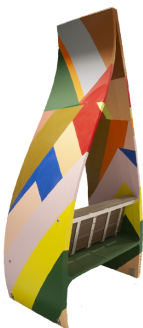
razzle dazzle by natalie lanese