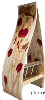
pizza bench by mike sobeck