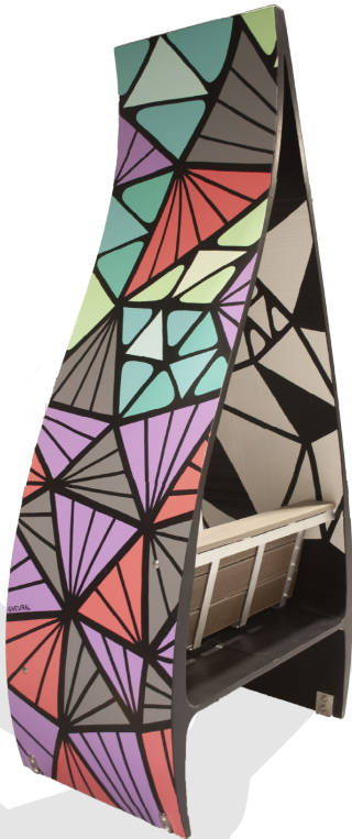
change + adapt artist: Debbie Clapper