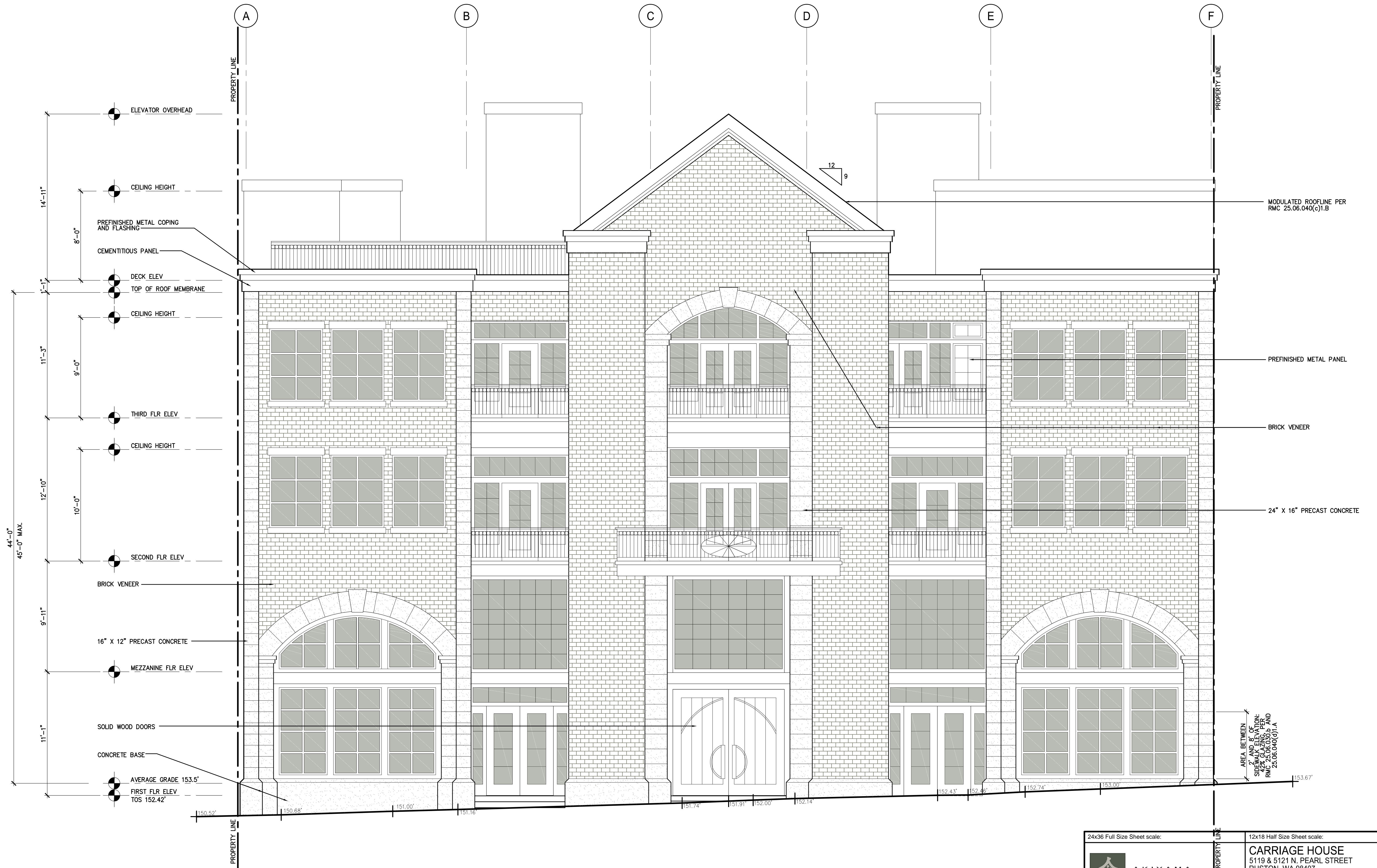
WEST ELEVATION SCALE: 1/4" = 1' - 0"