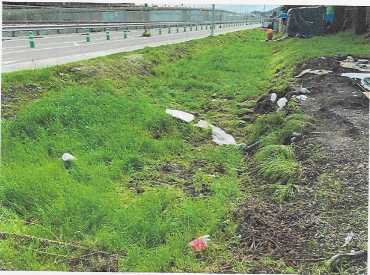
Eroded Culvert 250 Francisco Blvd W