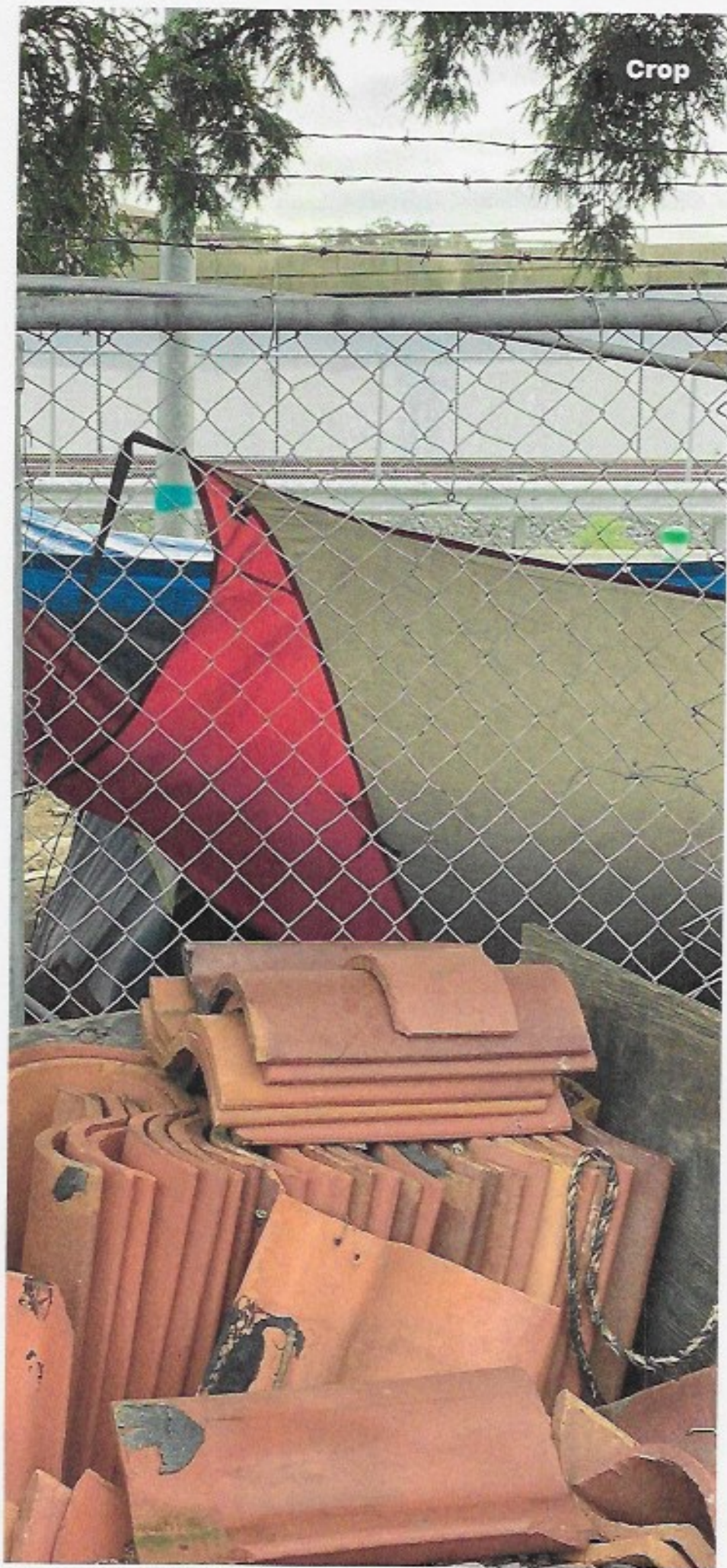
Tent tied off to fence line 250 Francisco Blvd W