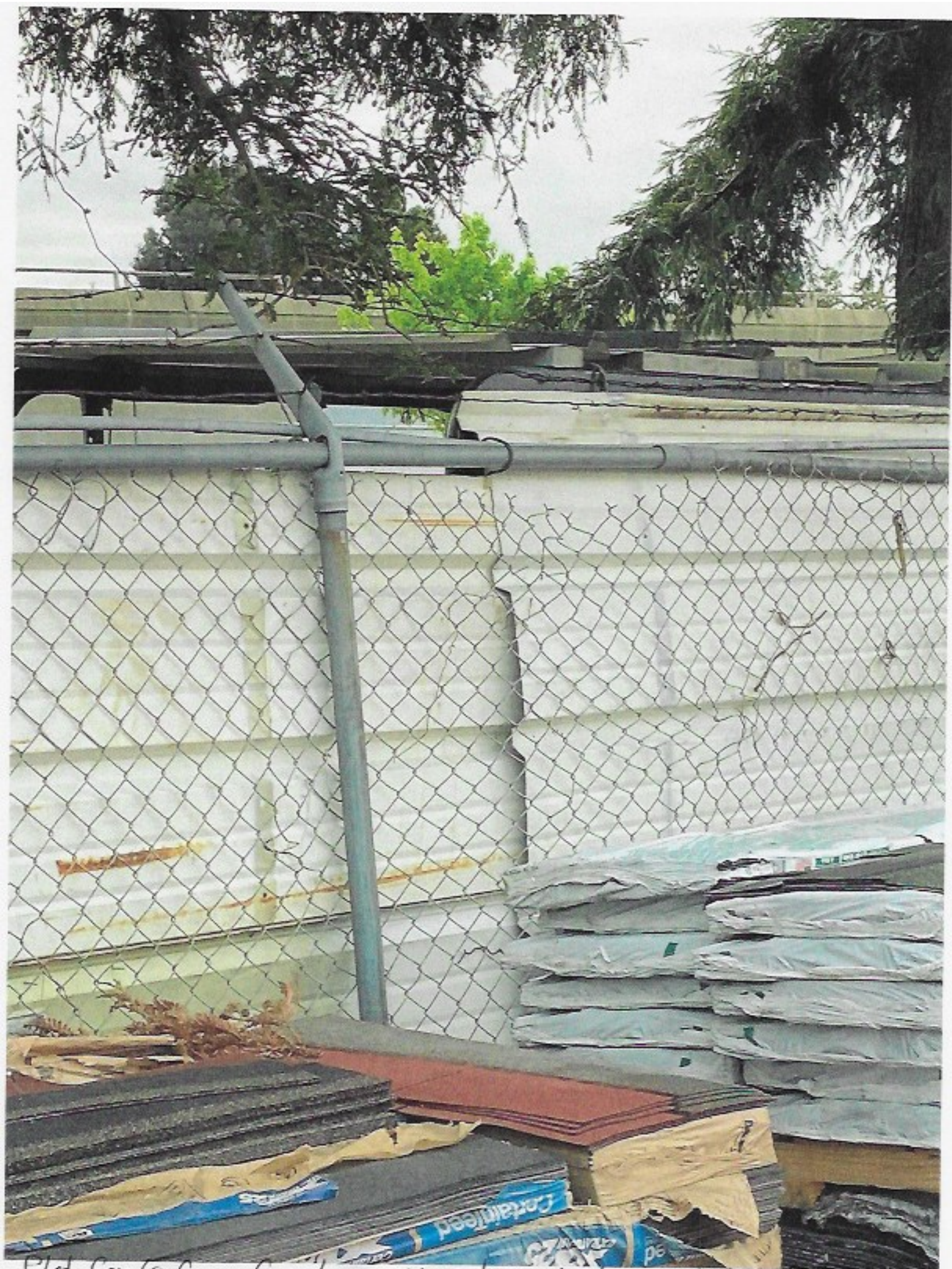
Plet form/roof on fence line access to yard done weekend of 4/13/24