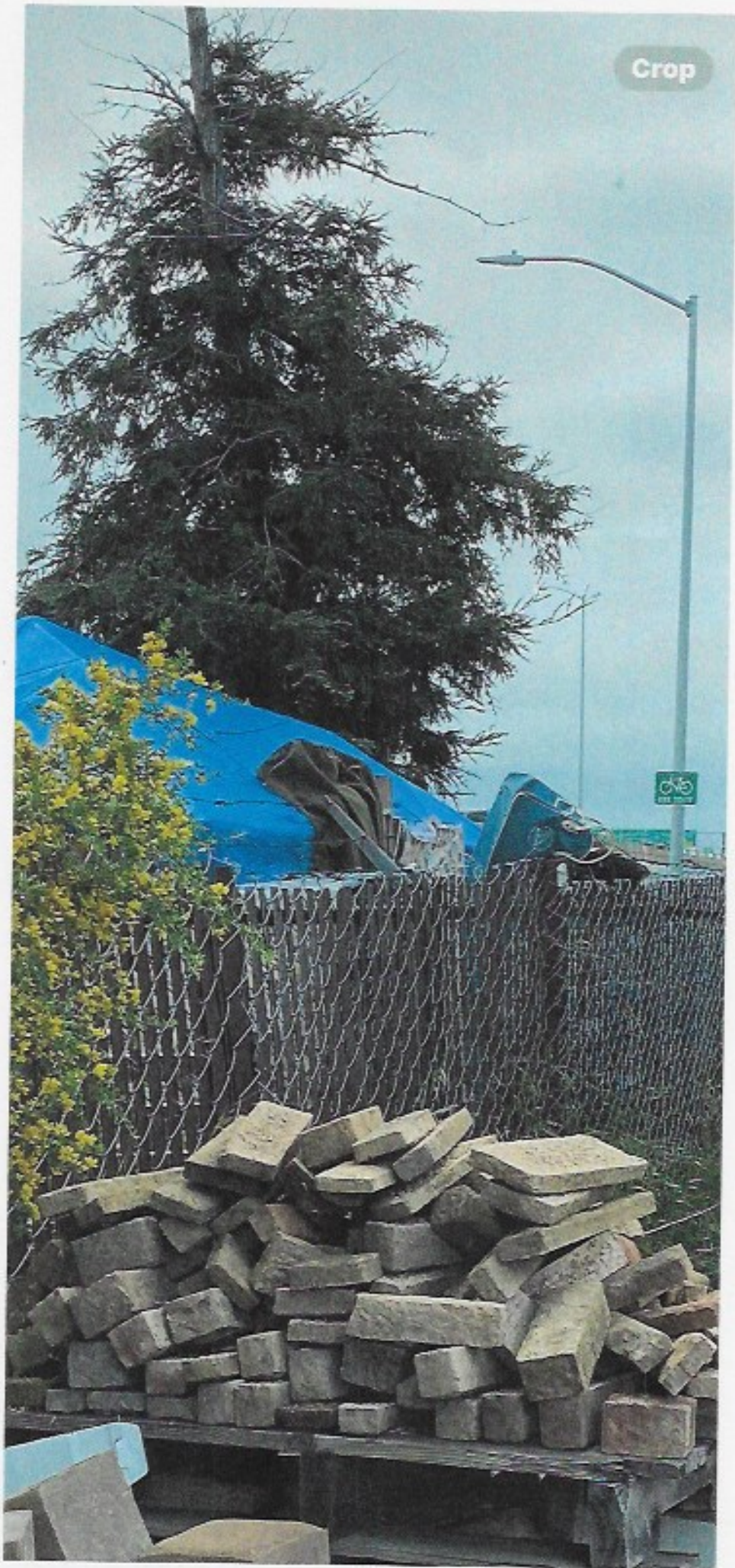
Junk & tied off at 250 Francisco Blvd. W