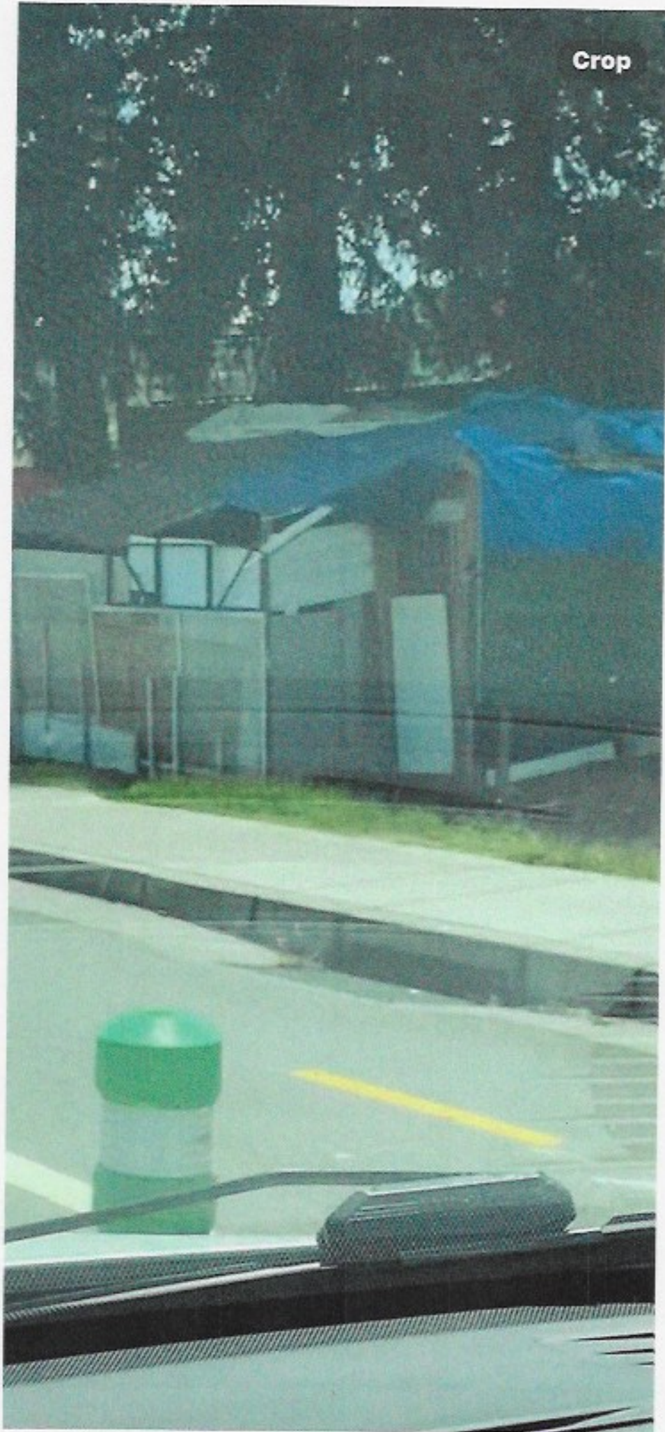
One of several structures 250 Francisco Blvd. W