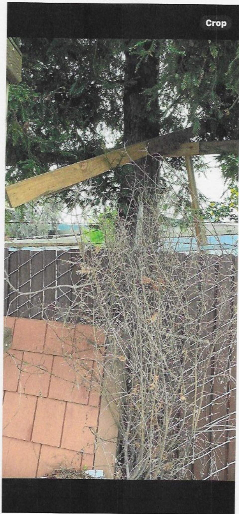
Wood support nailed into tree, access to 250 Francisco Blvd. W