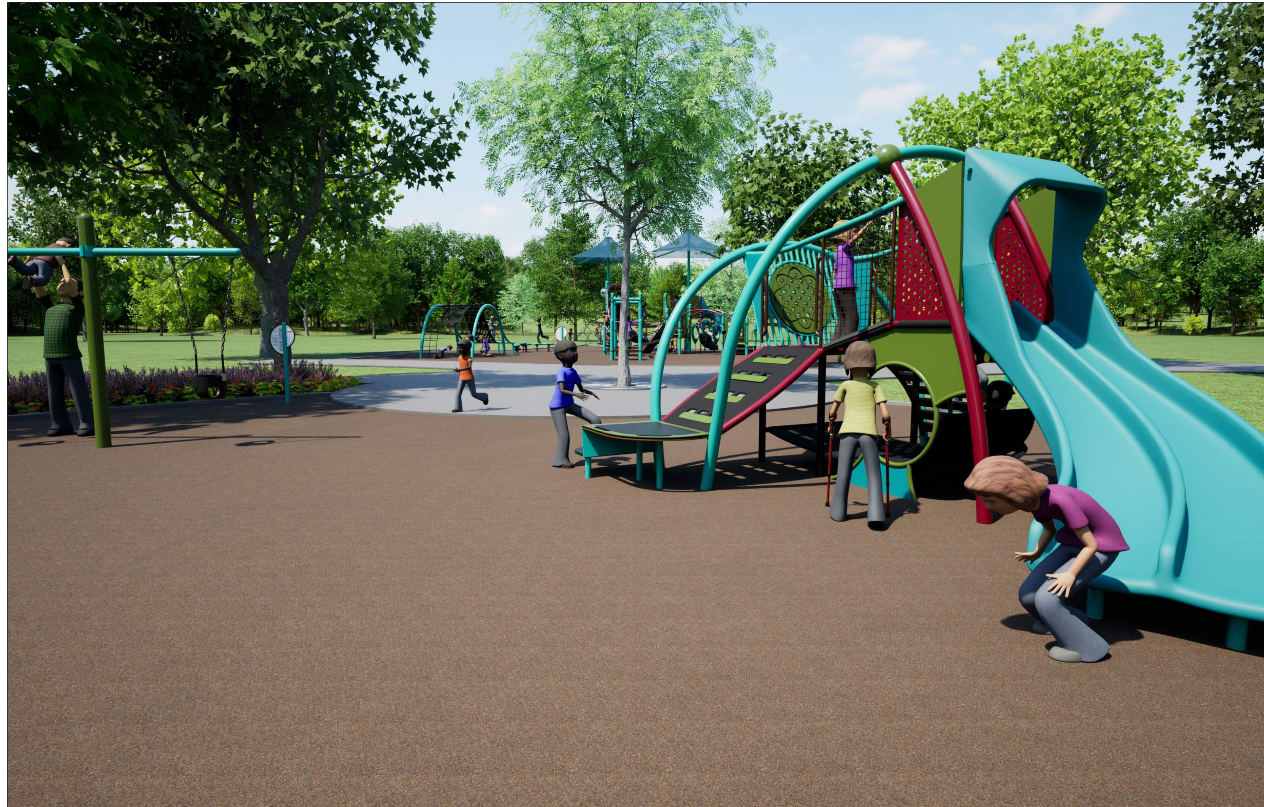
2 to 5-year old playground