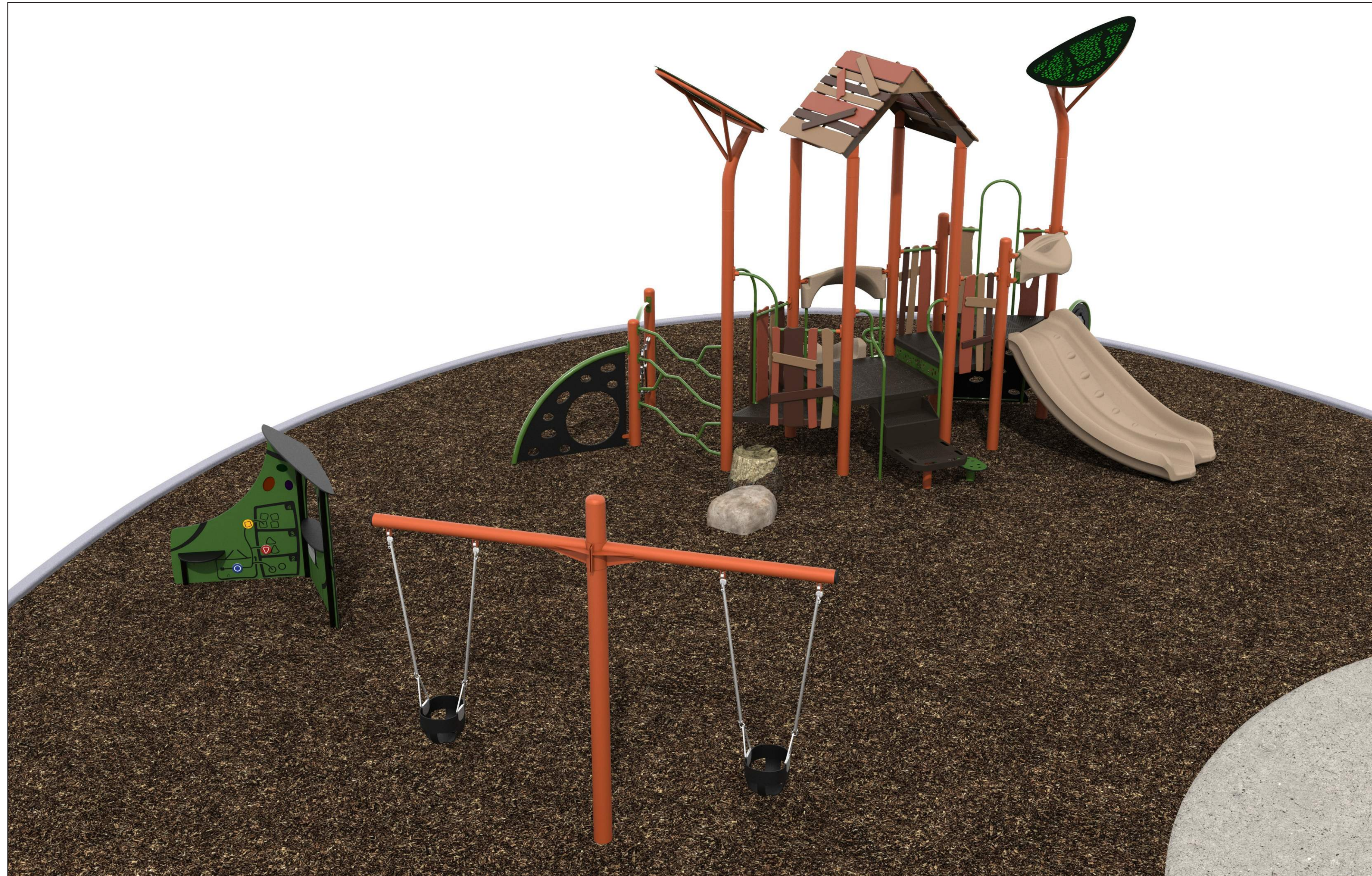
2 to 5-year old playground