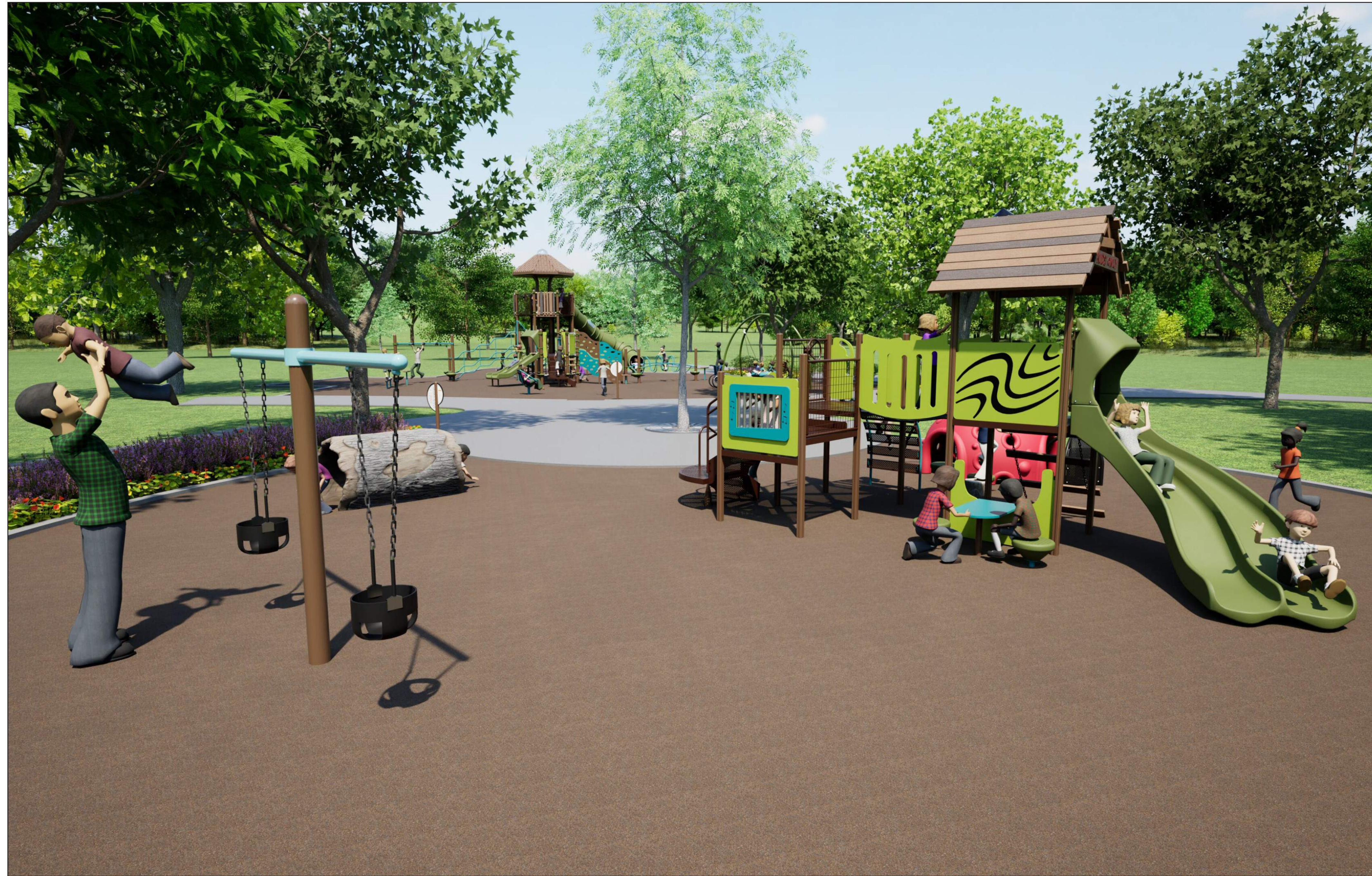
2 to 5-year old playground