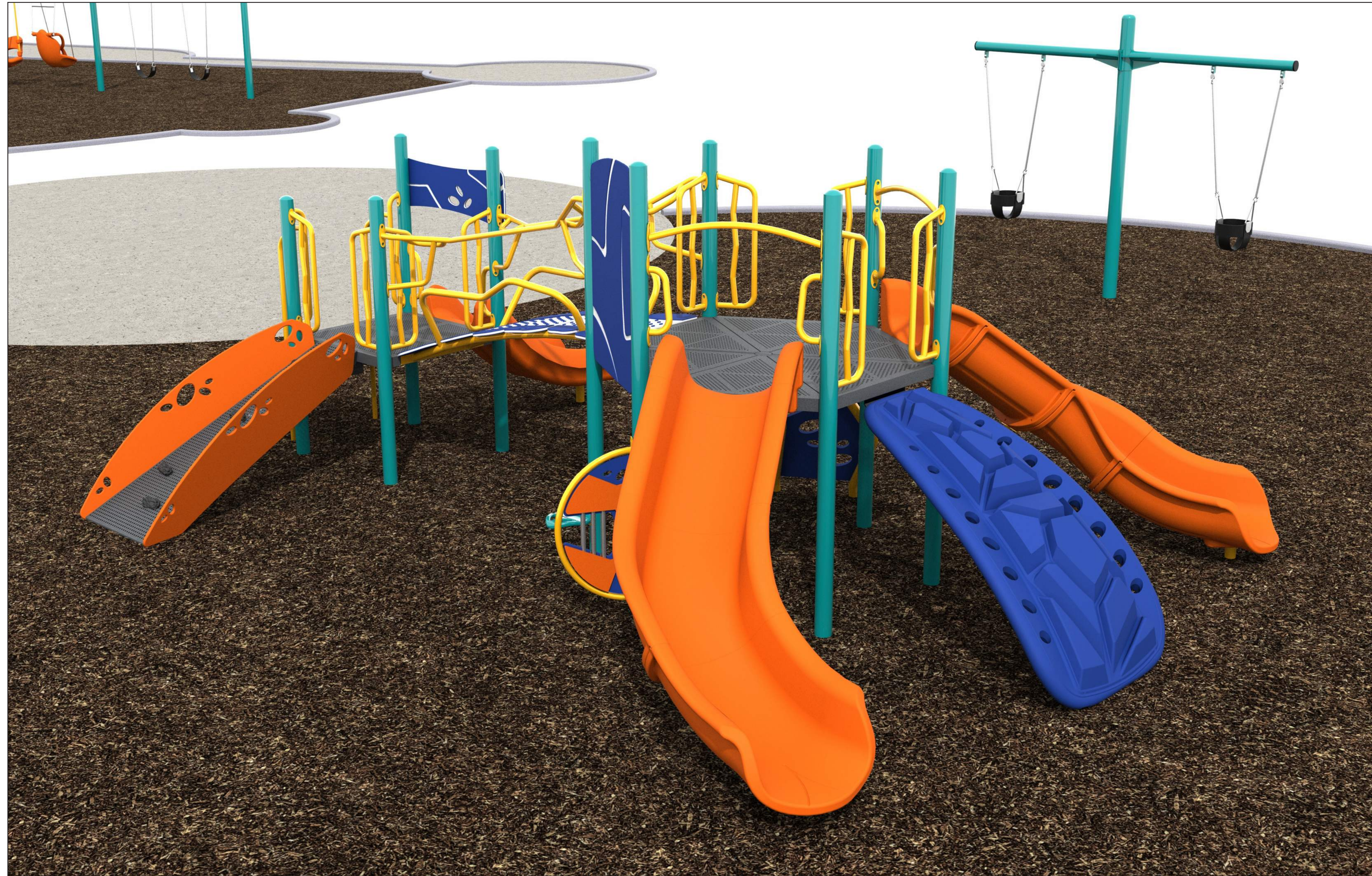
2 to 5-year old playground