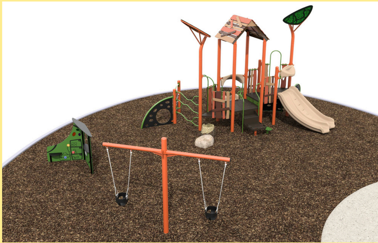
2 to 5-year old playground