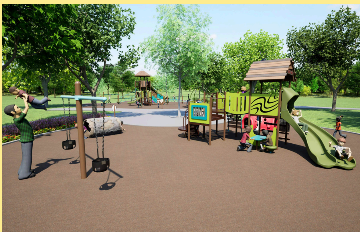
2 to 5-year old playground