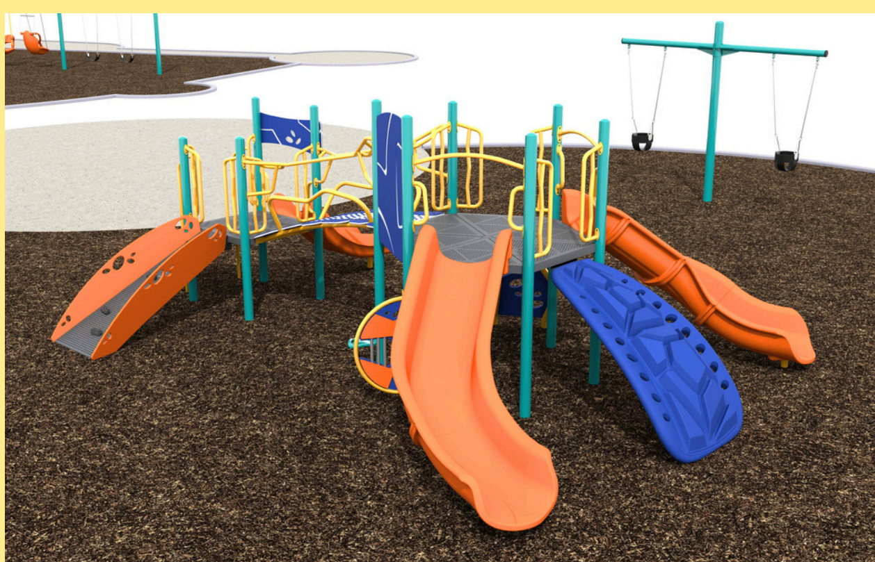
2 to 5-year old playground