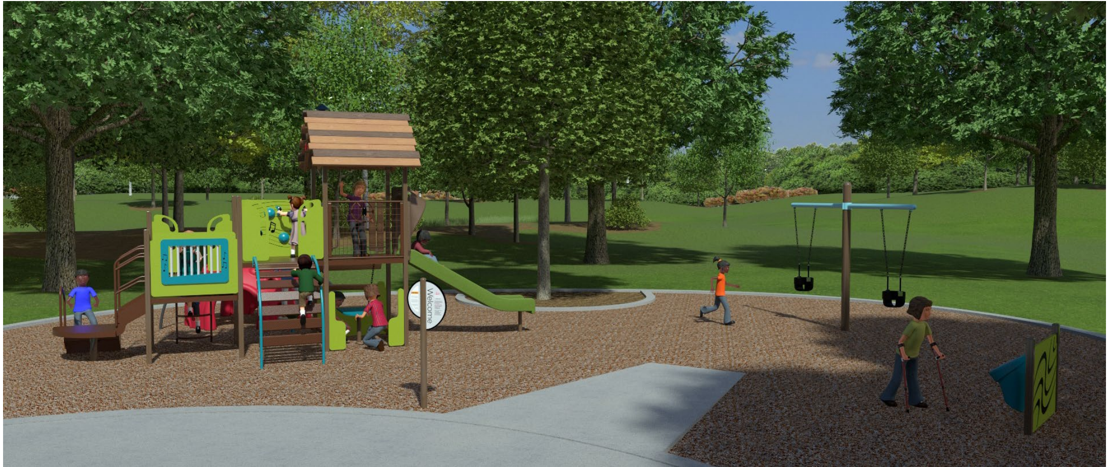
2 to 5-year-old playground