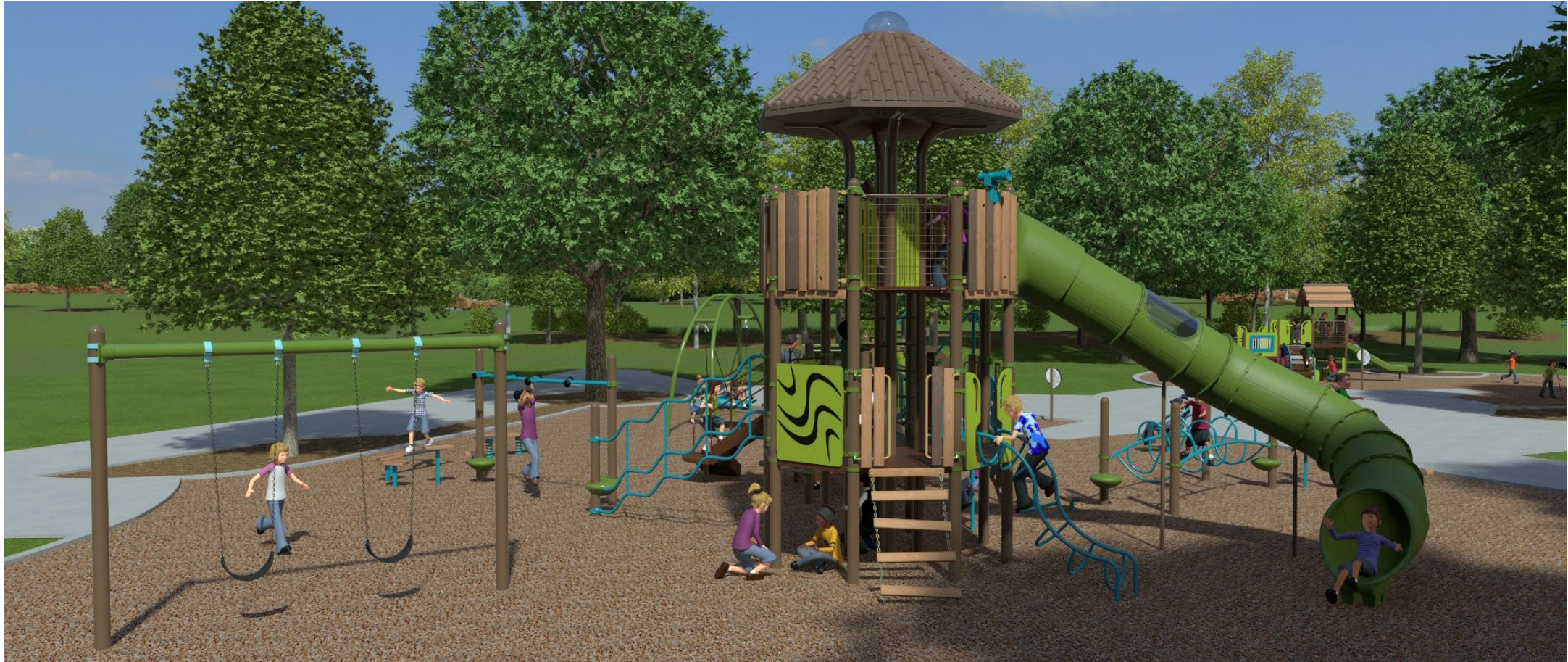
5 to 12-year-old playground