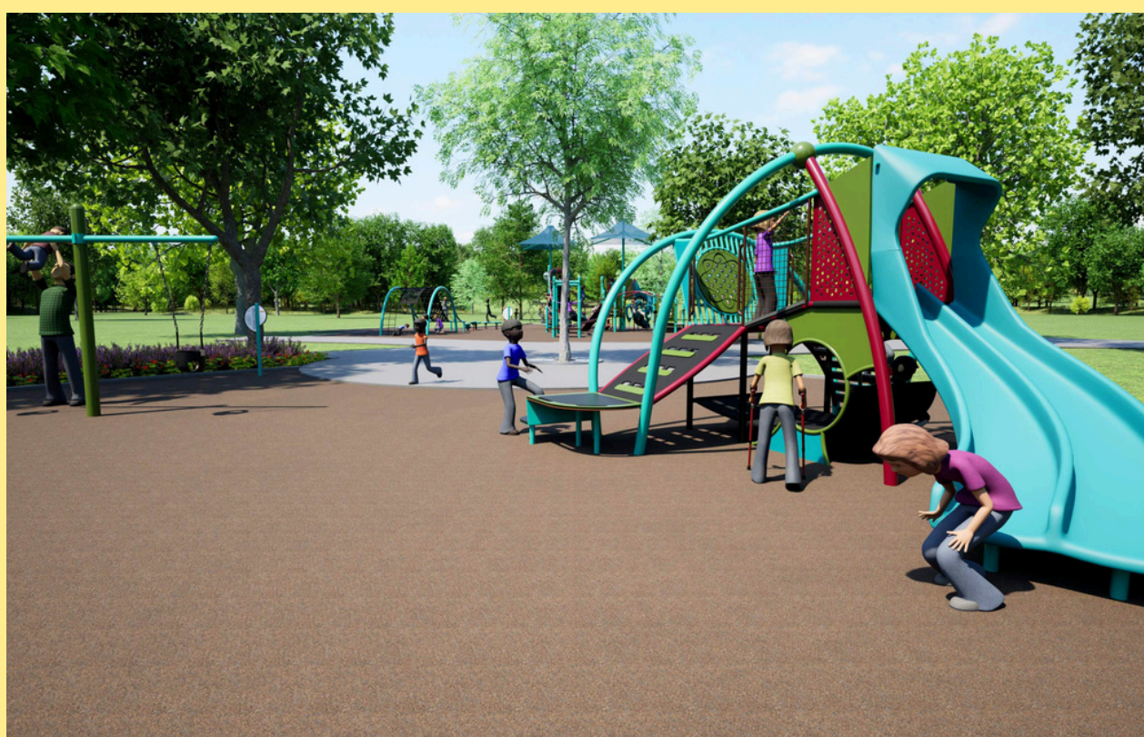
2 to 5-year old playground