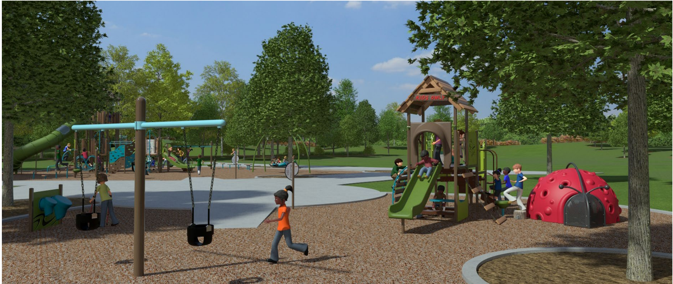
2 to 5-year-old playground