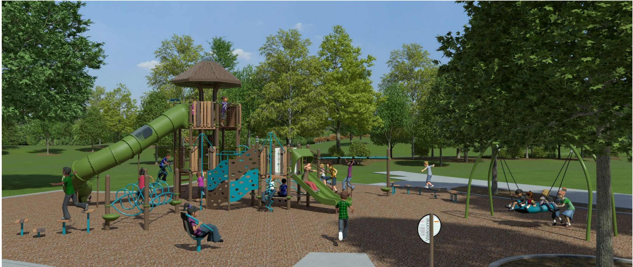
5 to 12-year-old playground