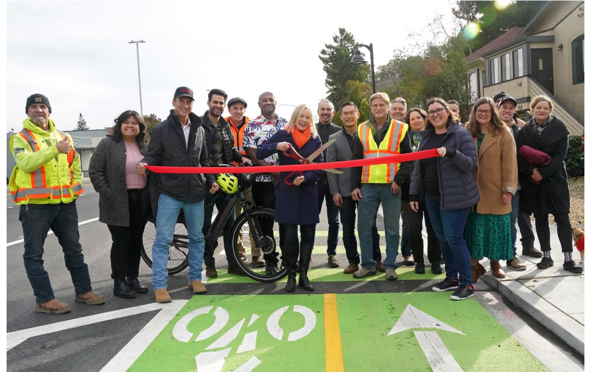
Completion of Third Street Improvement Project