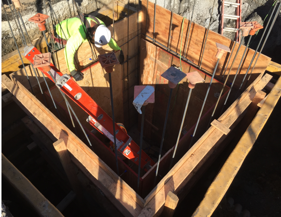
November progress pictures for Fire Station 57

During the month of November, Alten Construction substantially completed all excavation activity for the new storm drain. Form work and concrete pours for all manholes and inlets continued throughout the month. Temporary storm drain bypass measures were maintained and a secondary bypass pump was removed due to decreased rainfall. The review and processing of submittals and Request for Information (RFI's) continued at high volume/pace. November construction progress on the storm drain bypass will allow normal building pad prep to begin in December.