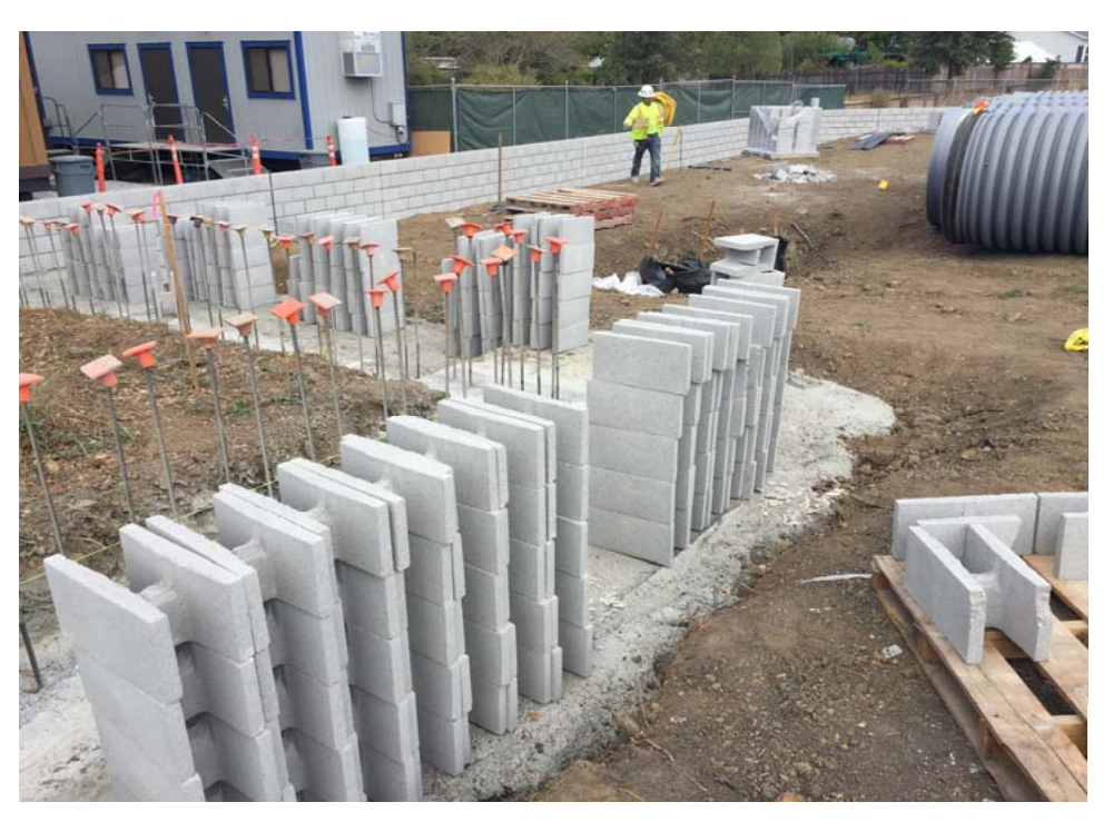
September progress pictures for Fire Station 57 – Retaining Wall construction