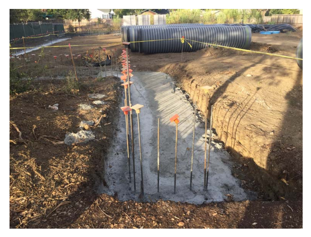
September progress pictures for Fire Station 57 – Retaining Wall Foundation

During the month of September, Alten construction completed site preparation for the next phase of work, which will include the installation of the underground site utilities and the building foundation work. Alten Construction also completed the foundation, rebar installation, and block placement for the CMU wall that is located at the perimeter of the project site. The review and processing of submittals and Request for Information (RFI's) continued at high volume/pace.