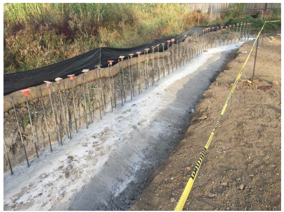
September progress pictures for Fire Station 57 – Retaining Wall Foundation

PROJECT TEAM: Owner: City of San Rafael Project/Construction Manager: Kitchell, Sacramento, CA Architect: Mary McGrath Architects, Oakland, CA Contractor – Alten Construction, Inc.