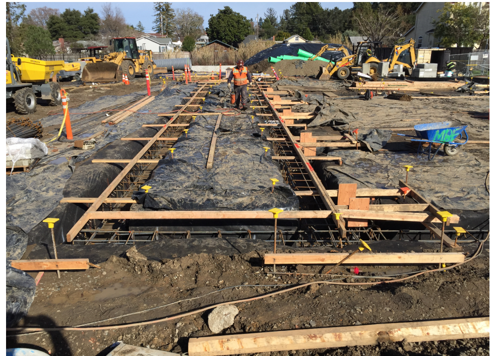
January progress pictures for Fire Station 57