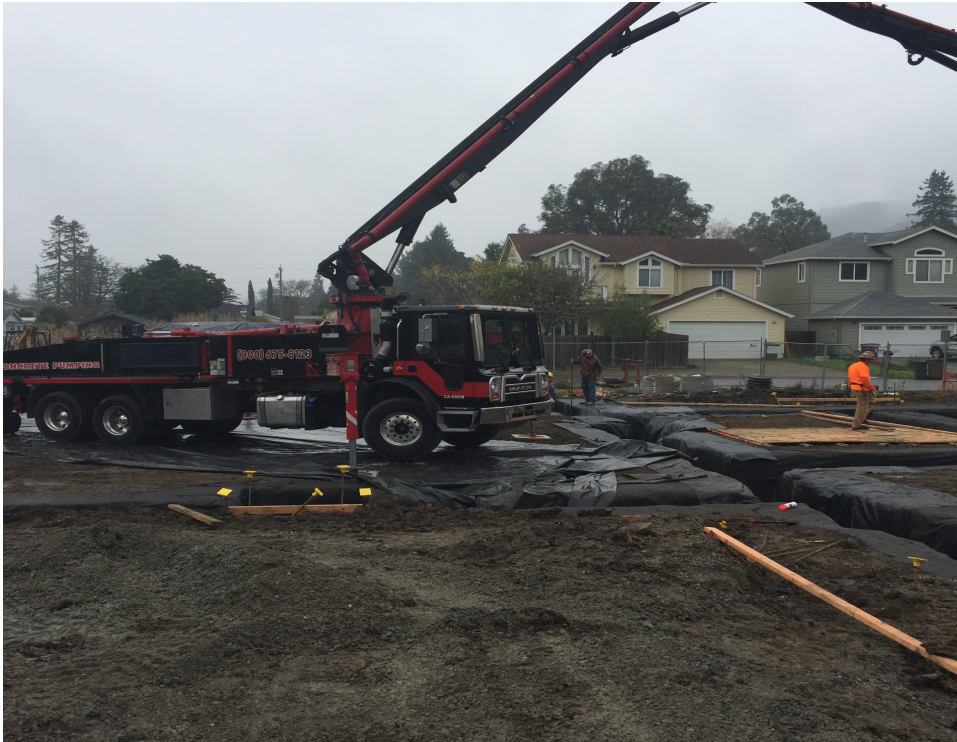
January progress pictures for Fire Station 57

During the month of January, Alten Construction completed the new driveway and sidewalk along Civic Center Drive. Installation of the building pad form work and placement of rebar for the foundation got underway. The installation of underground utilities, including MEP elements, and site-specific drainage piping and manholes for the new building also began. Weatherization measures were undertaken to maintain productivity during periods of rain. The review and processing of submittals and Request for Information (RFI's) continued at high volume/pace.