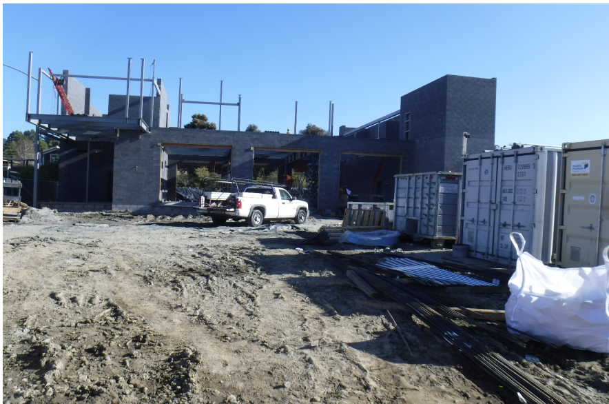
March progress picture – Looking North from Training Classroom to Fire Station Building