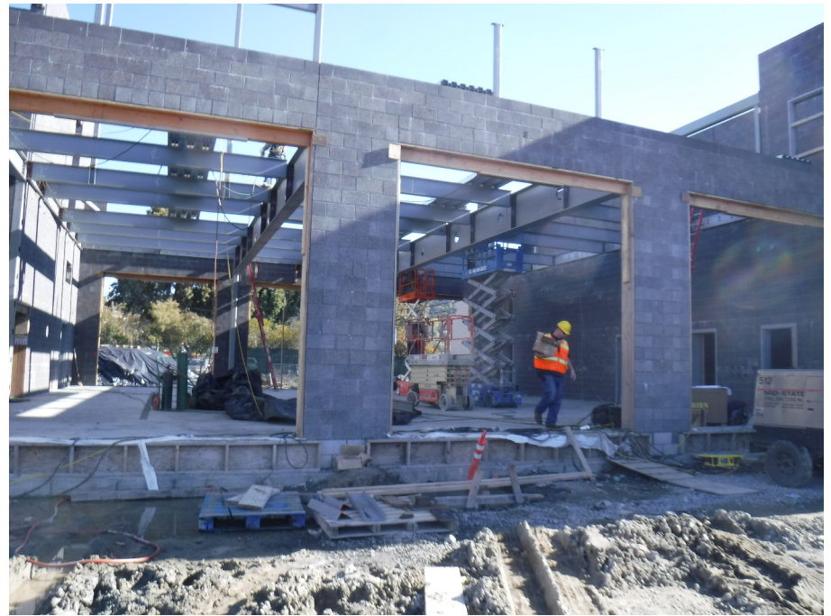
March progress picture – Fire Station CMU Complete; Steel and Columns Erected. Welding Ongoing.