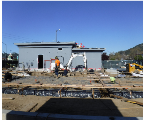
March progress pictures – (left) Classroom Interior; (right) Training Tower Foundation & Footings