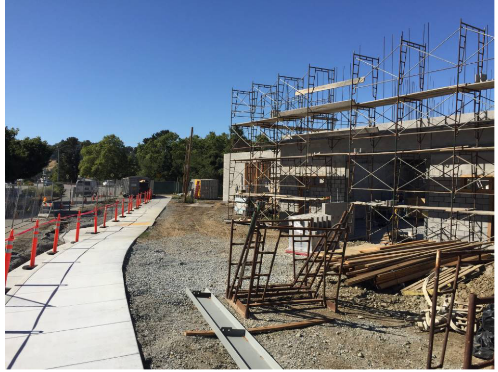
June progress pictures for Fire Station 57

During the month of June, Alten Construction completed the CMU installation for the Apparatus Bay. Steel elements (in conjunction with CMU activities) were completed for the Living Quarters. Embedded MEP elements were completed and the concrete slab was poured for the Apparatus Bay and Living Quarters. Shop fabrication for remaining steel commenced. Potholing and site investigation for the on-site storm drain system was completed.