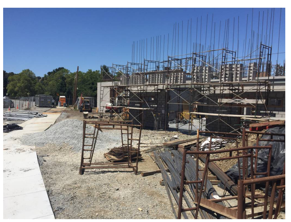
June progress pictures for Fire Station 57