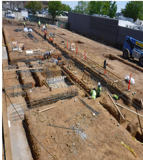
May progress picture – excavation of footing and elevator pits