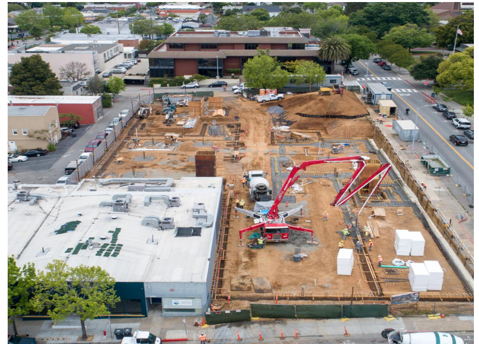
May progress picture – Overview of project site during the biggest concrete pour.