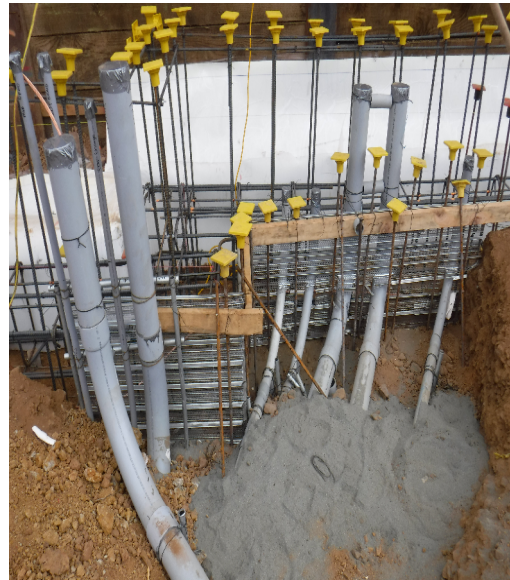
May progress pictures – installation of rebar and conduits