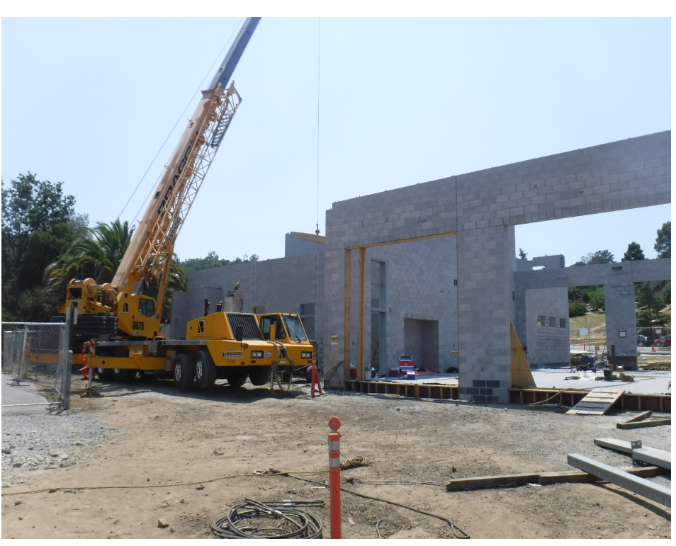
July progress pictures for Fire Station 57