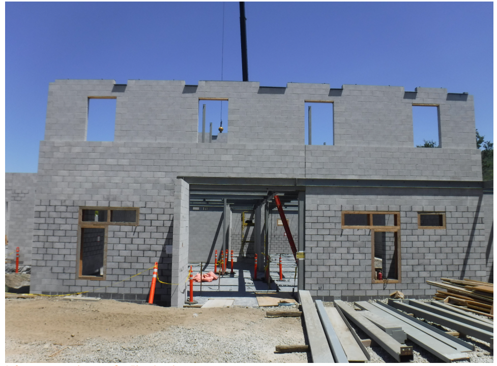
July progress pictures for Fire Station 57

During the month of July, Alten Construction completed the CMU installation for the Living Quarters and completed the 2<sup>nd</sup> Floor and Low Roof steel and decking. High roof steel erection commenced, as well as 1<sup>st</sup> Floor MEP rough-in and framing. The Apparatus Bay concrete floor was poured. The re-design and layout for the on-site storm drain were completed. Layout for work at the Civic Center Drive median was also finalized.