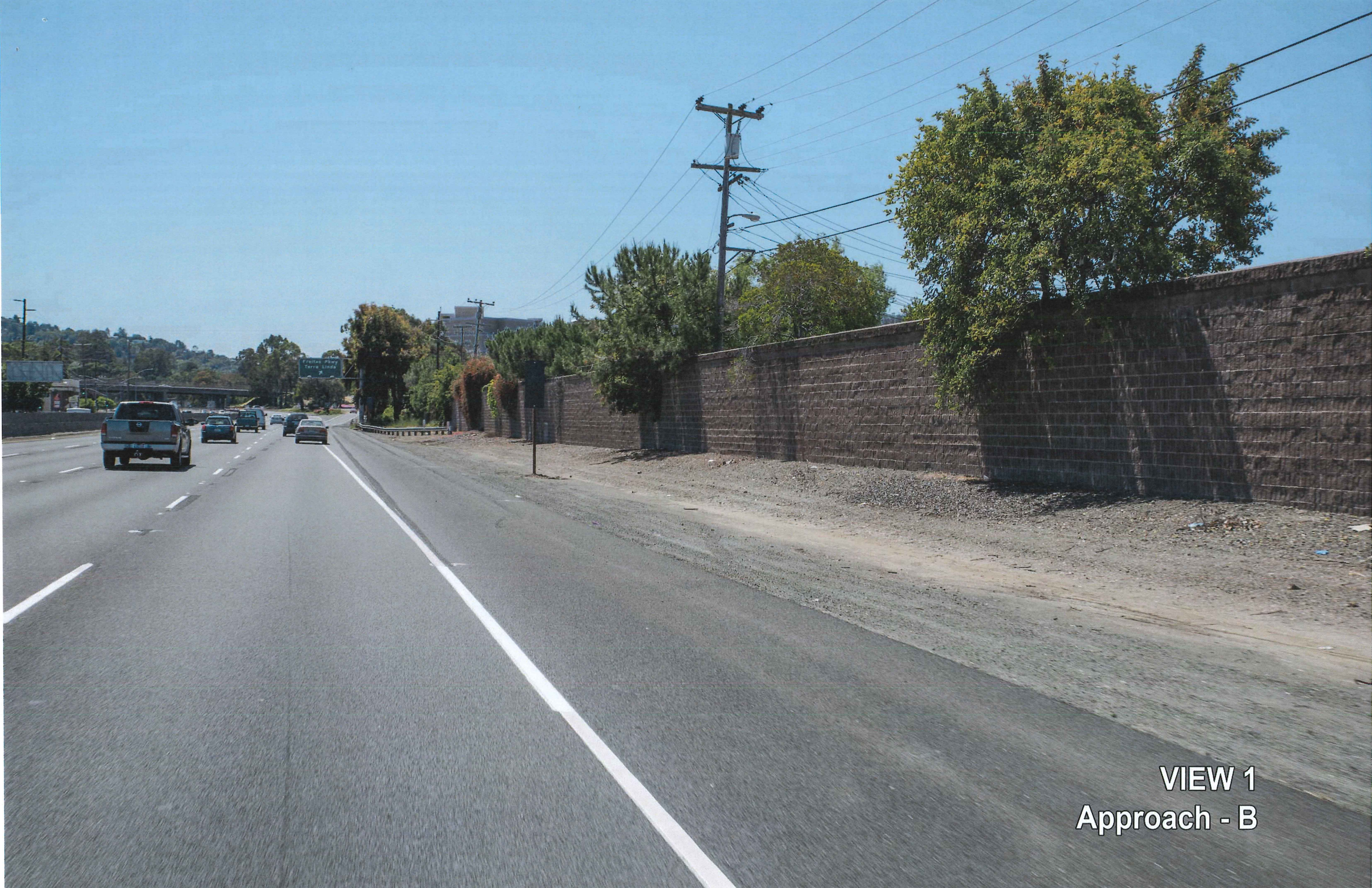
VIEW 1 Approach - B