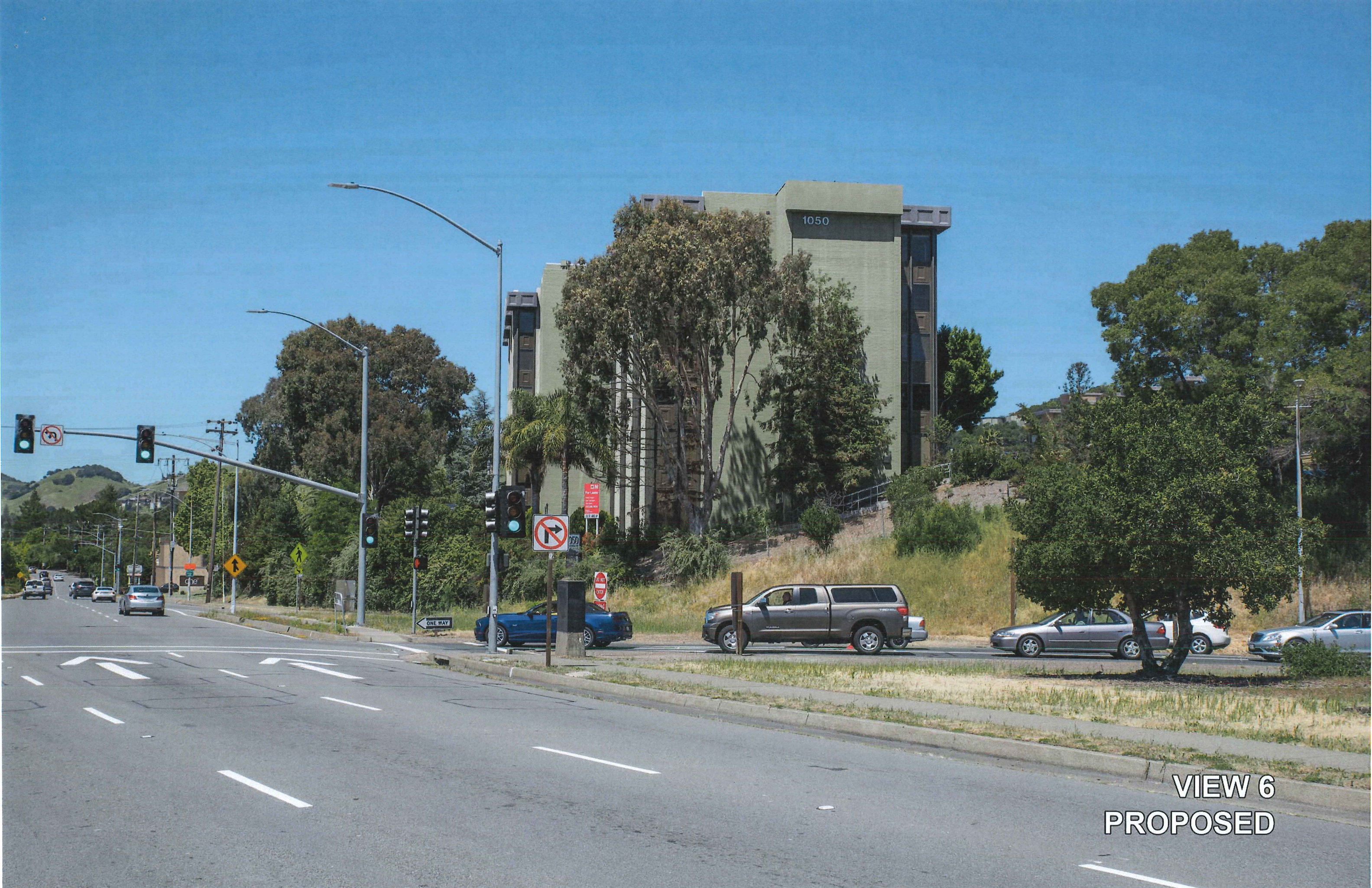
VIEW 6 PROPOSED