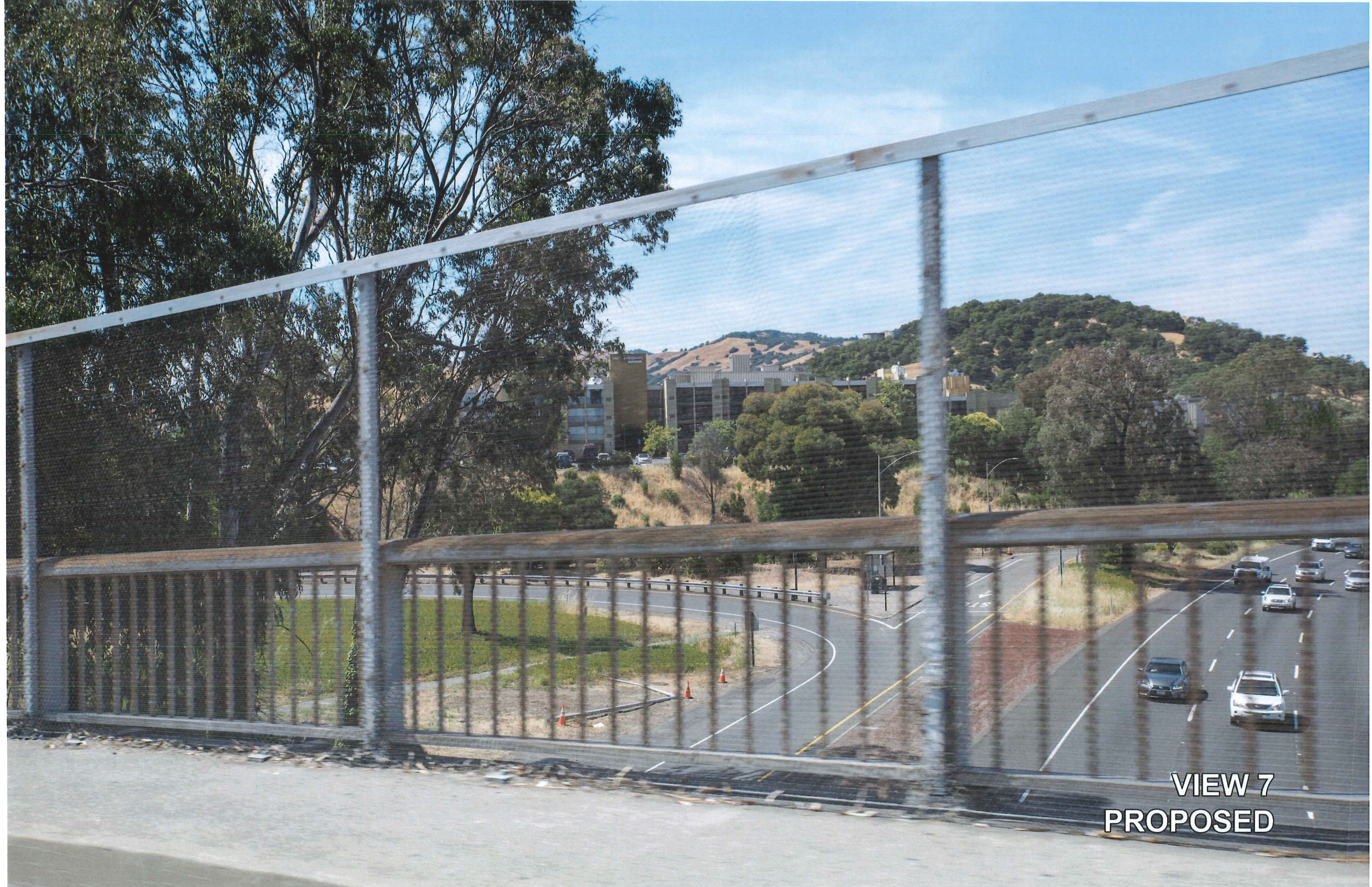
VIEW 7 PROPOSED