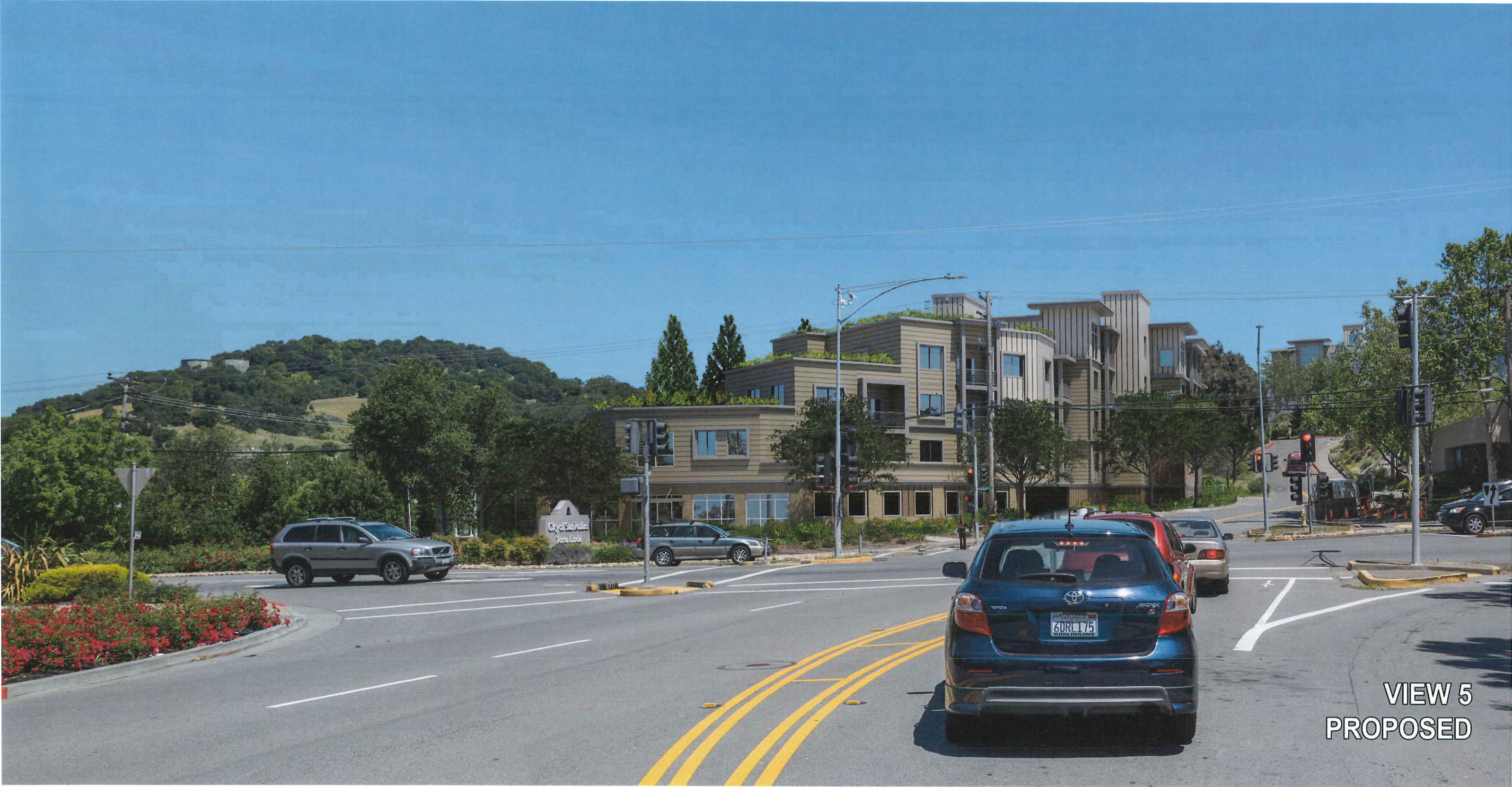
VIEW 5 PROPOSED