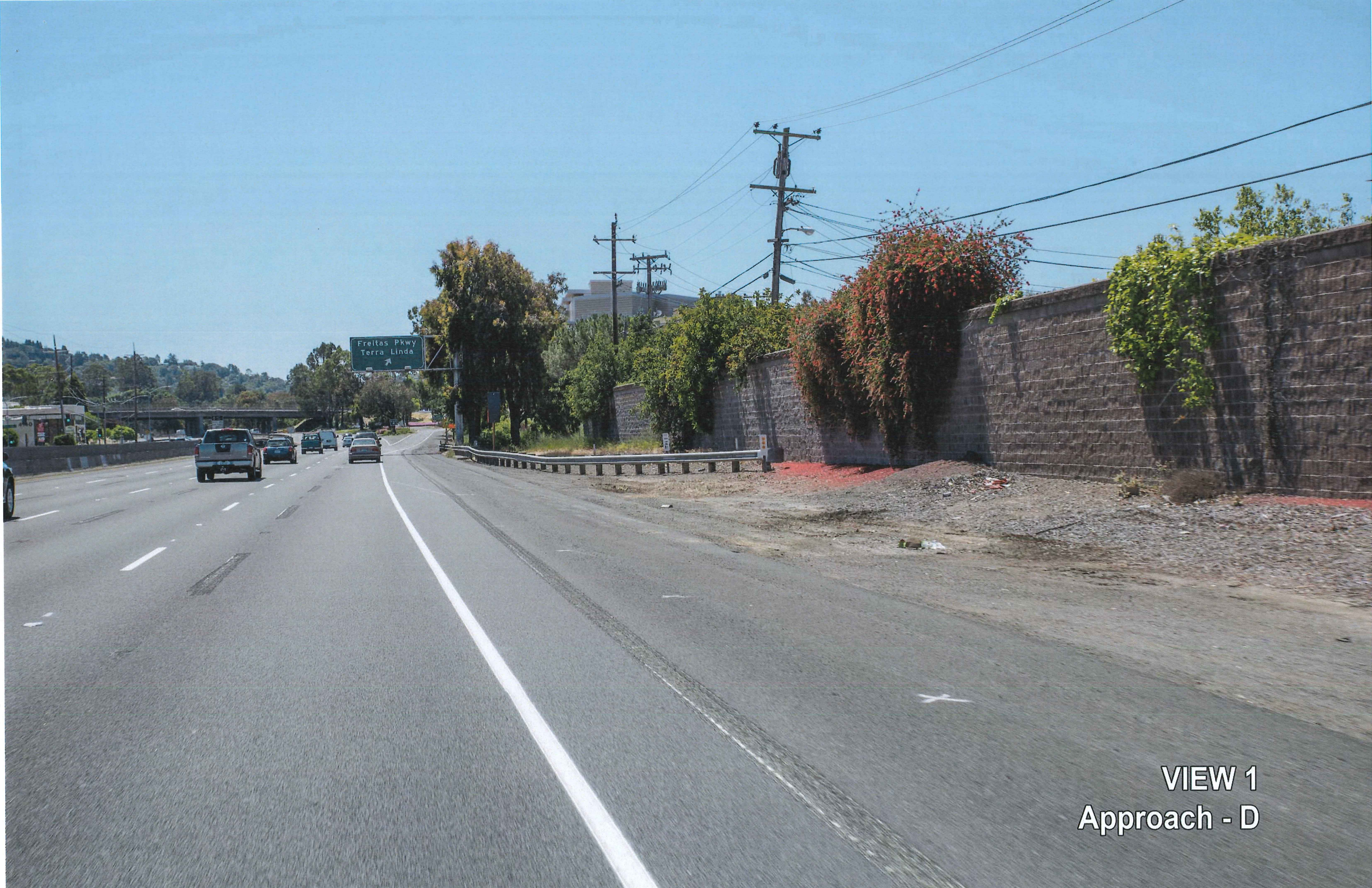
VIEW 1 Approach - D