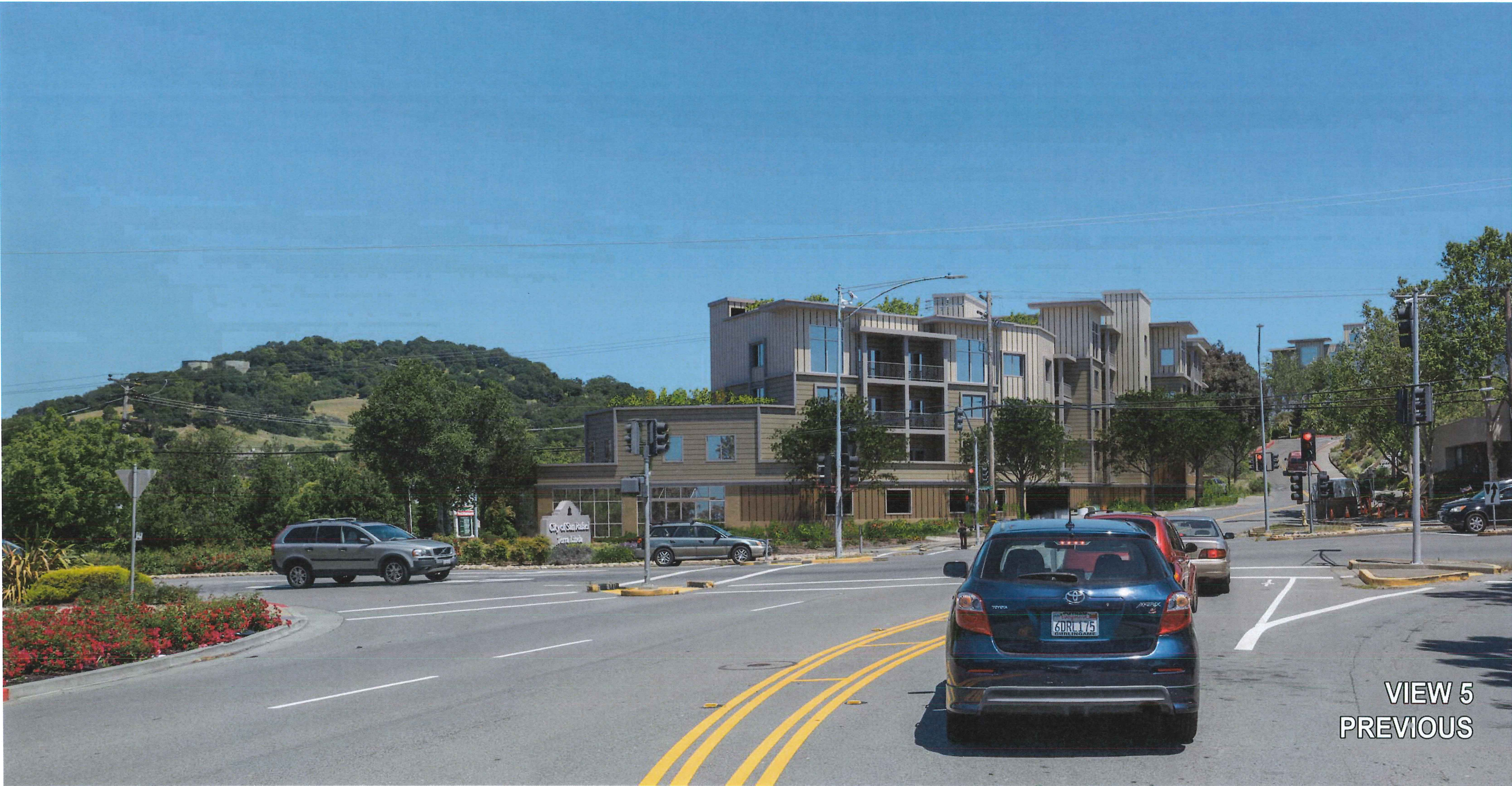
VIEW 5 PREVIOUS