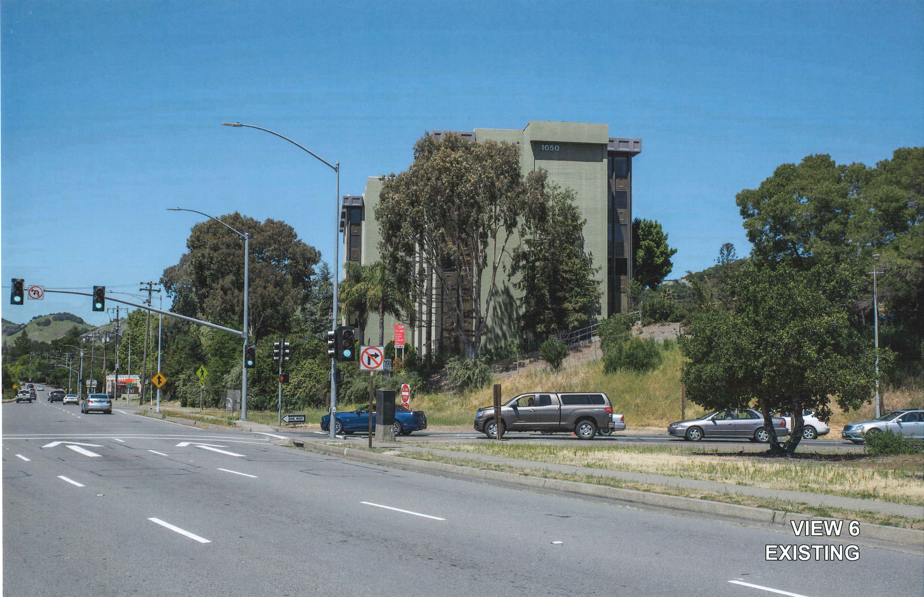
VIEW 6 EXISTING