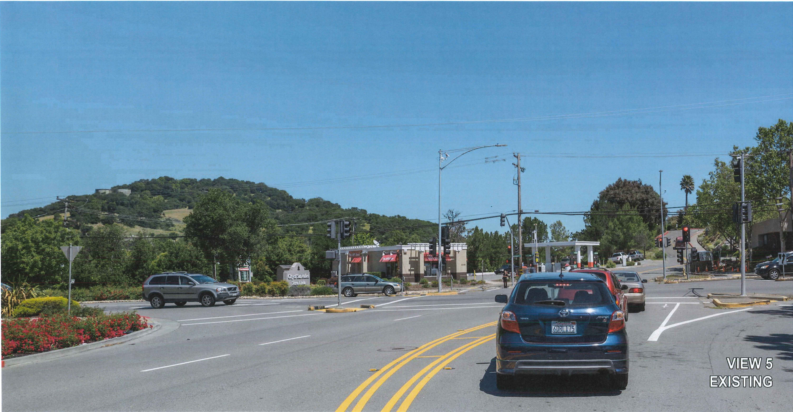
VIEW 5 EXISTING