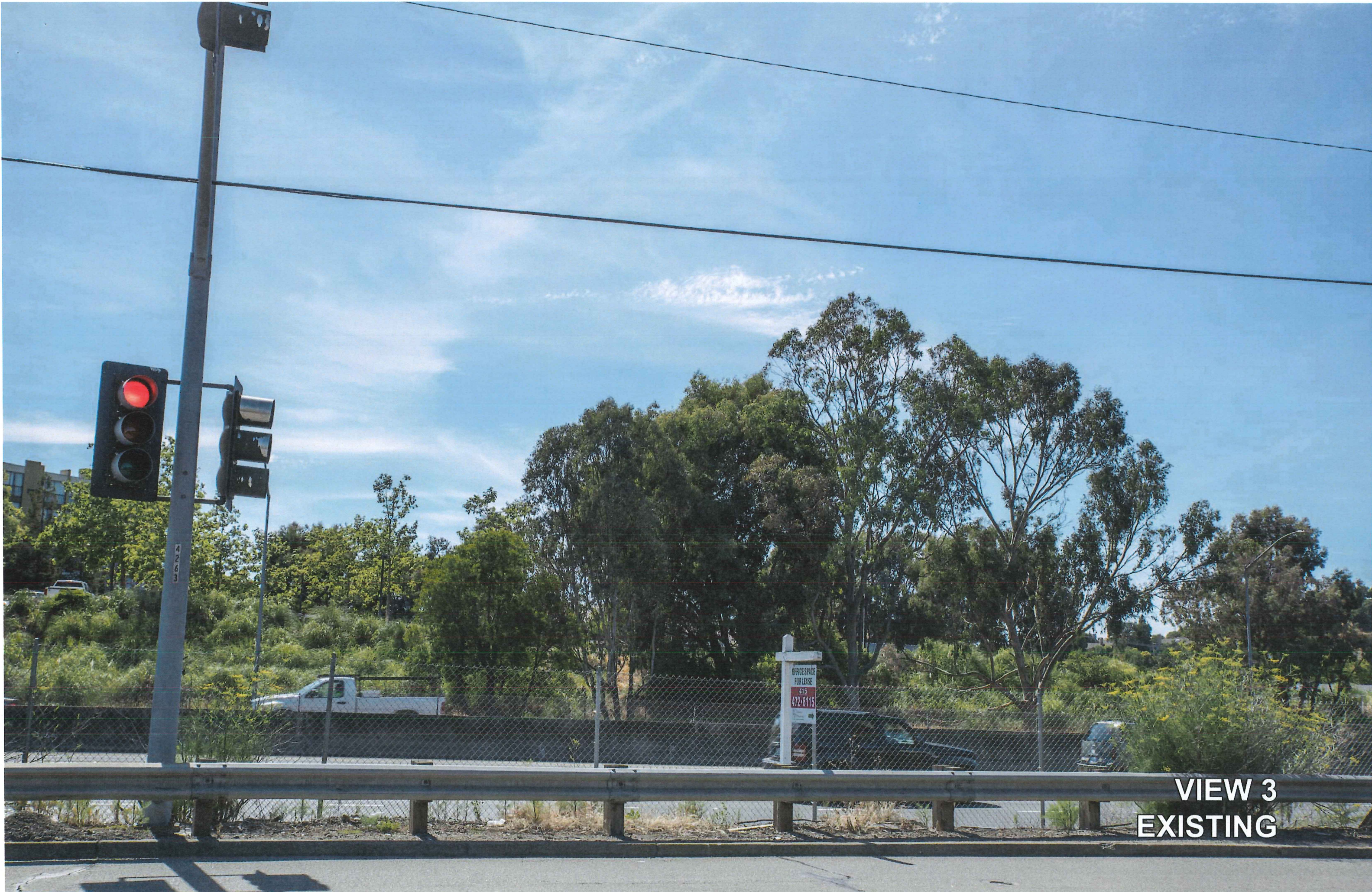
VIEW 3 EXISTING