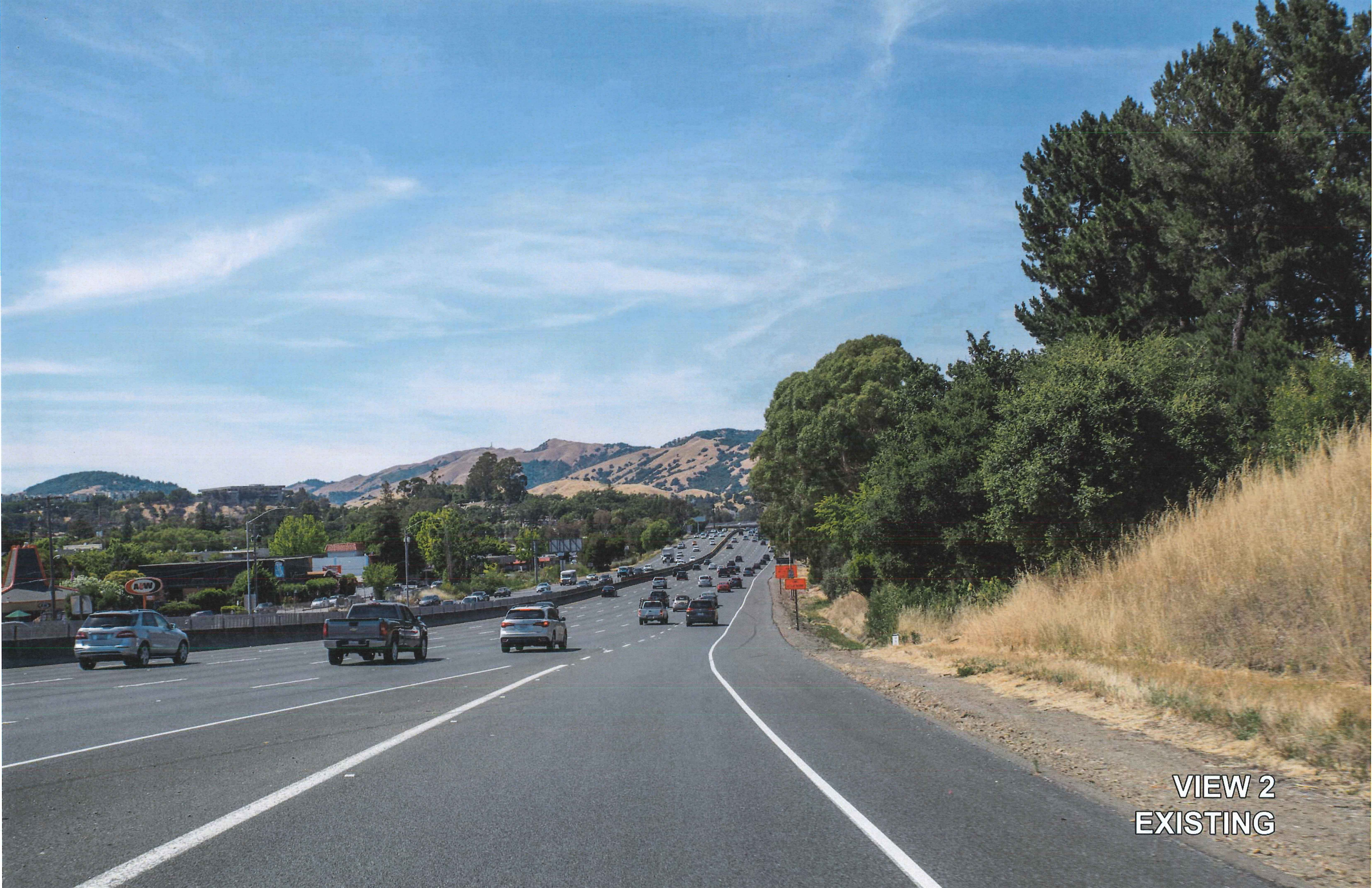
VIEW 2 EXISTING