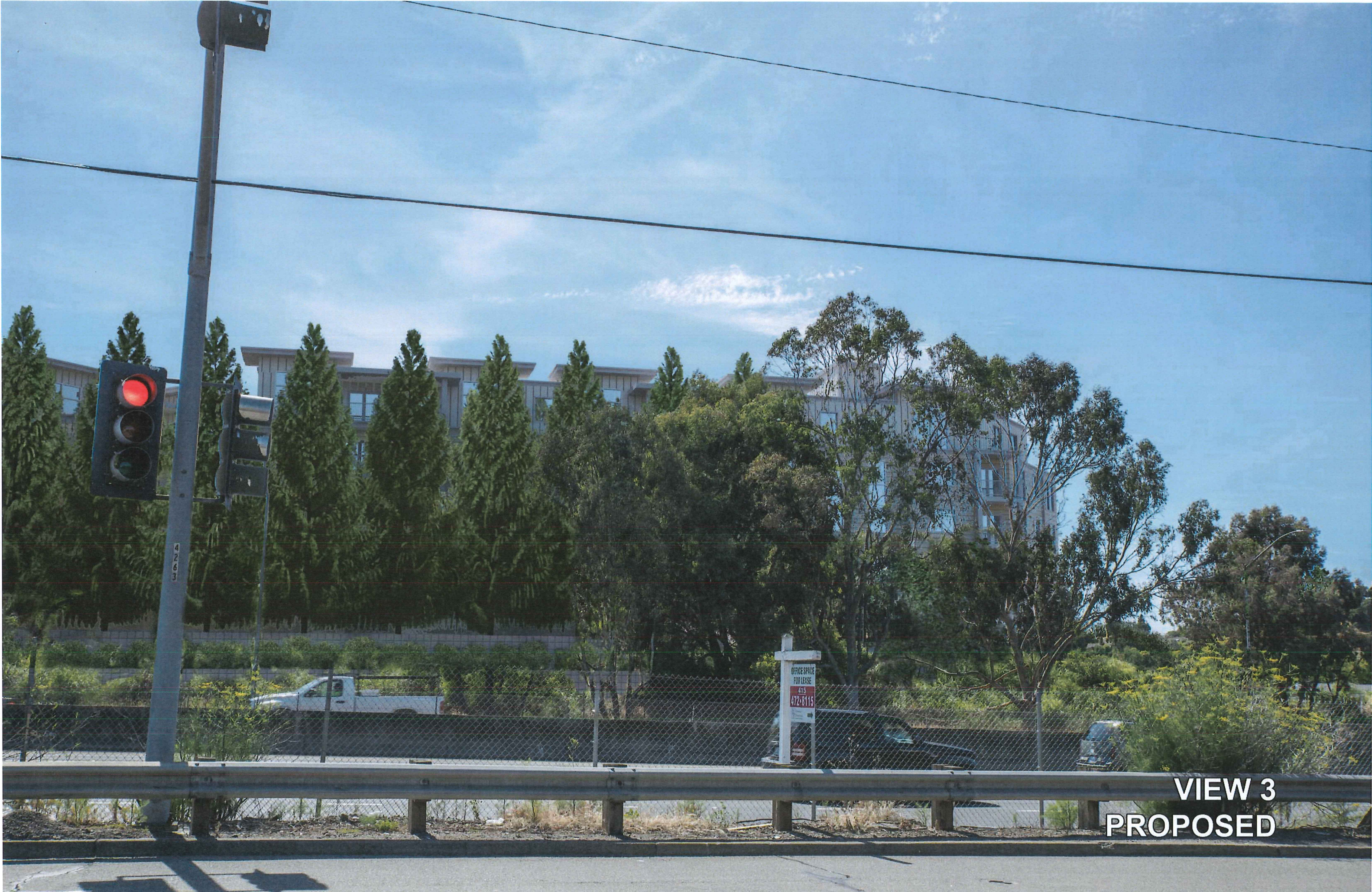
VIEW 3 PROPOSED