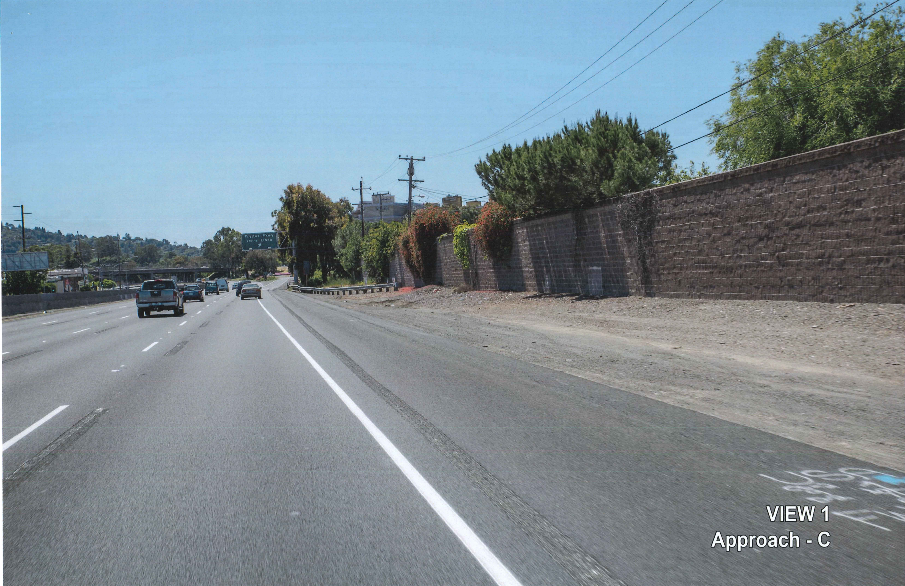
VIEW 1 Approach - C