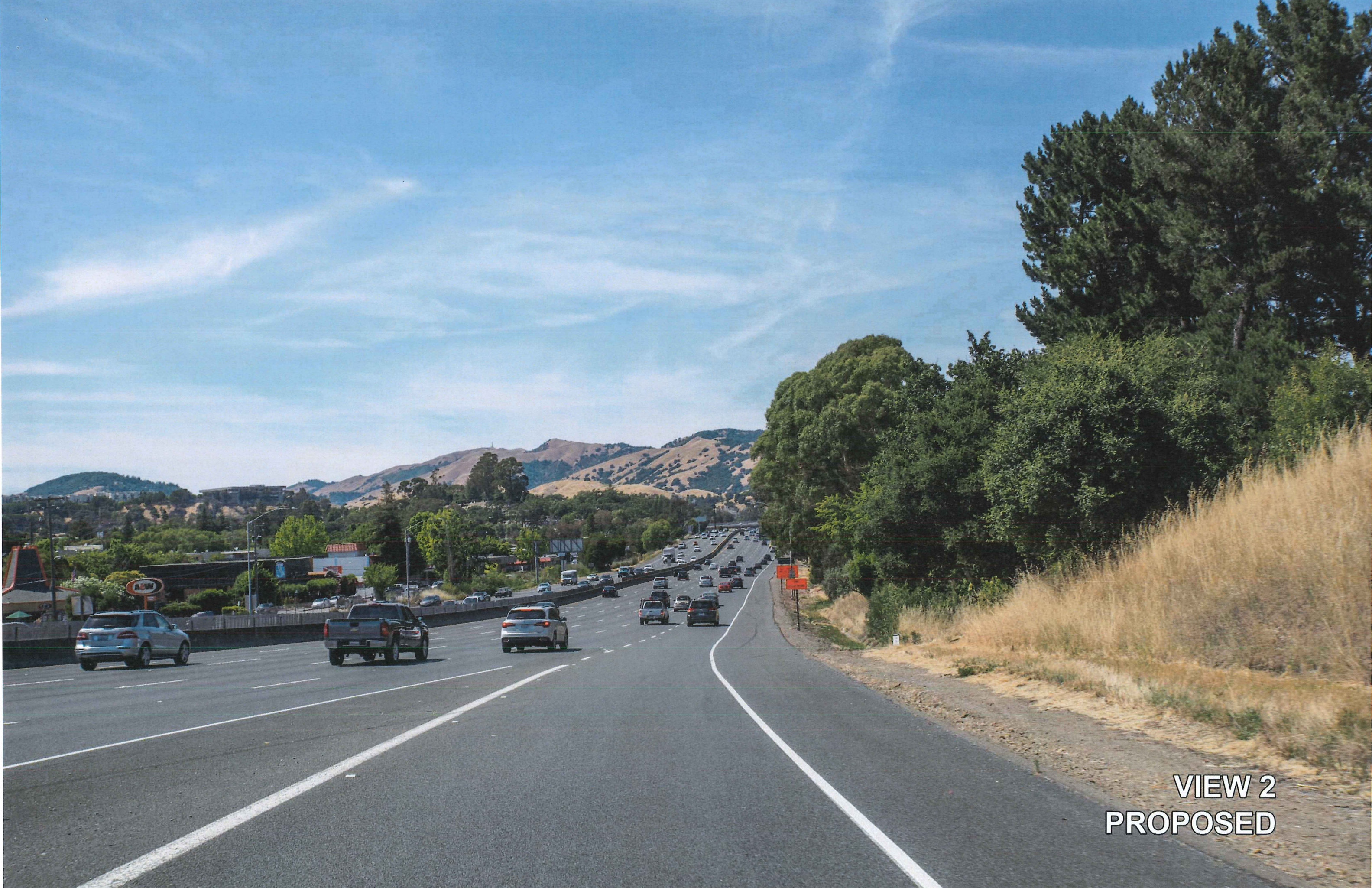
VIEW 2 PROPOSED