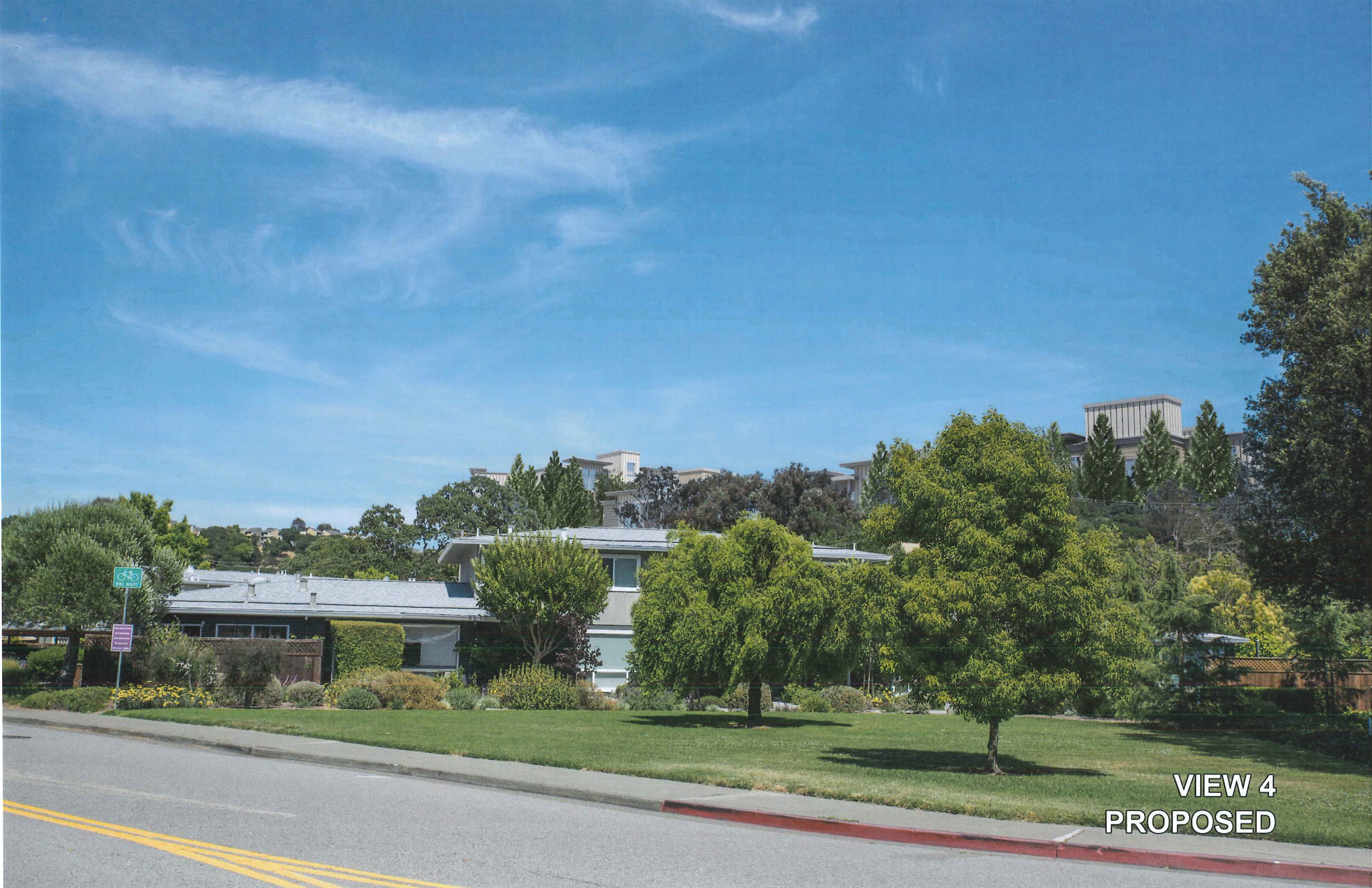
VIEW 4 PROPOSED