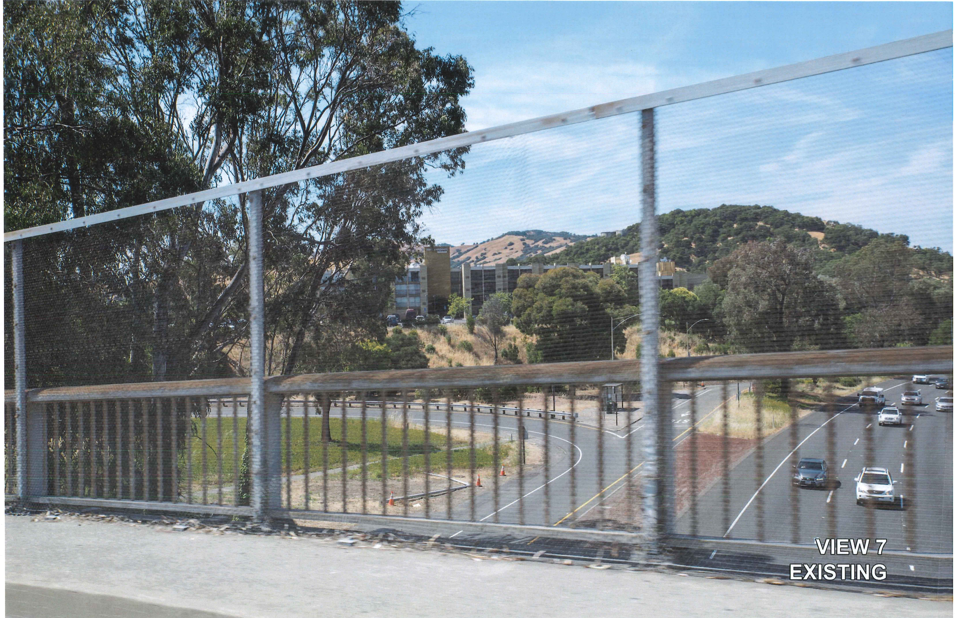
VIEW 7 EXISTING