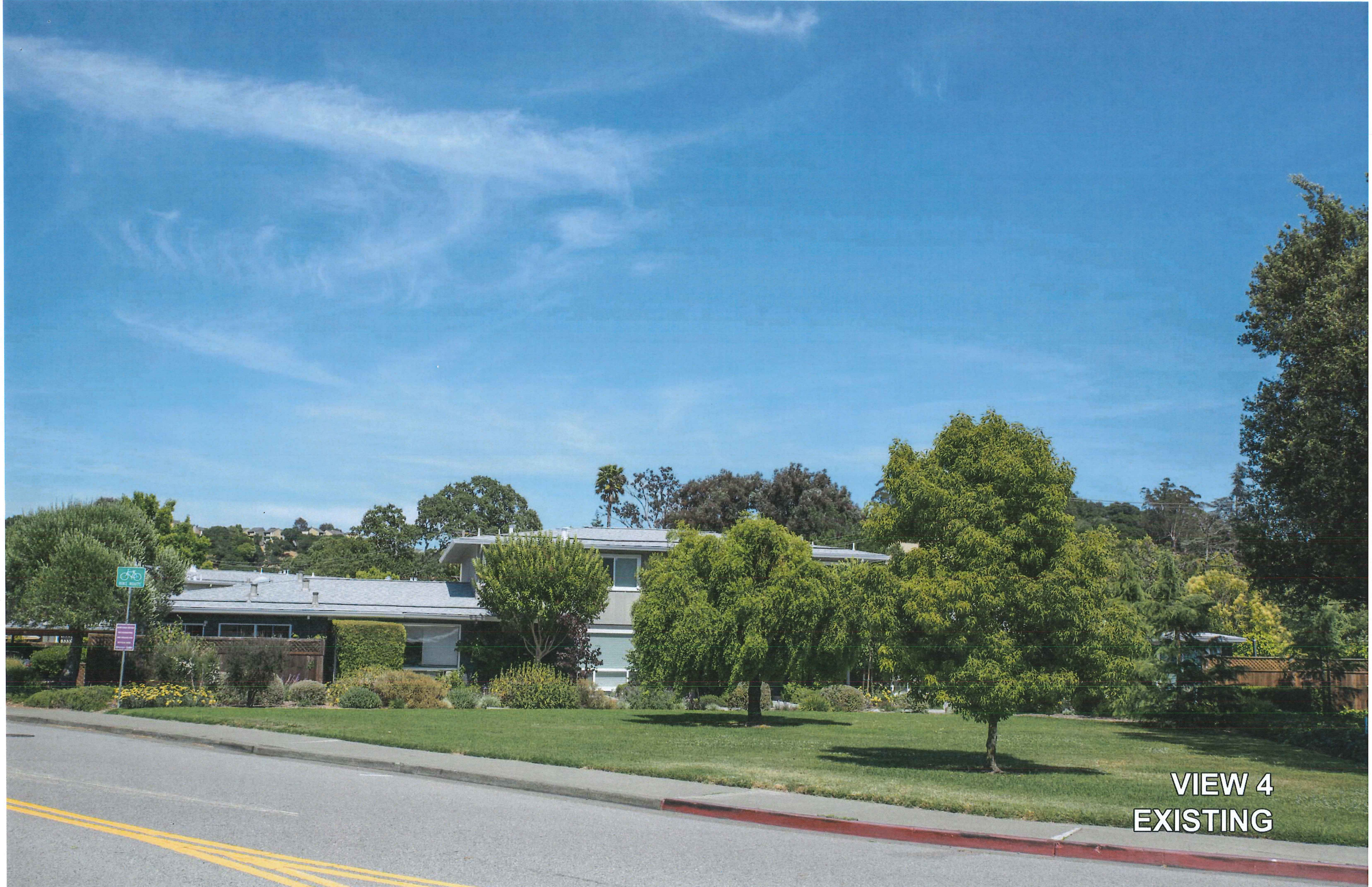
VIEW 4 EXISTING