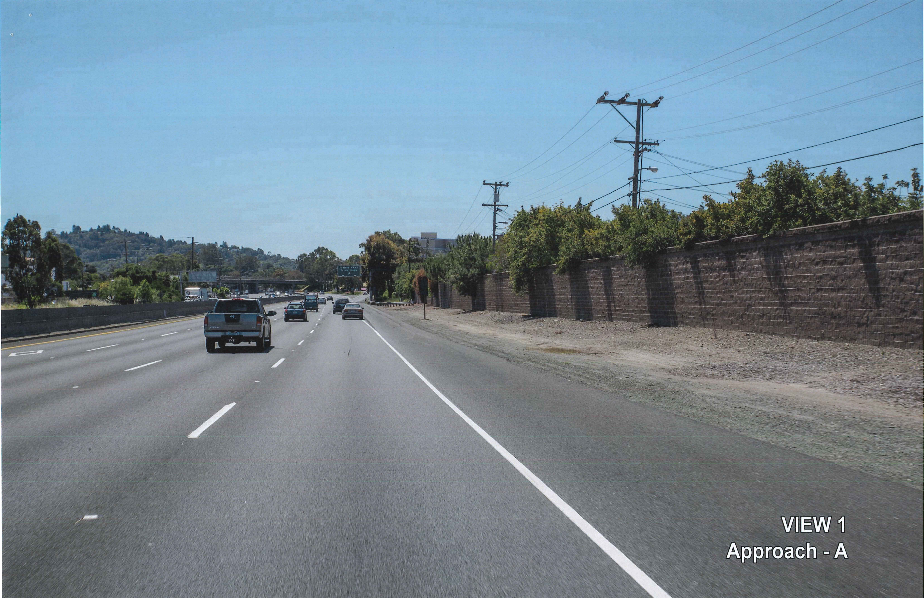
VIEW 1 Approach - A