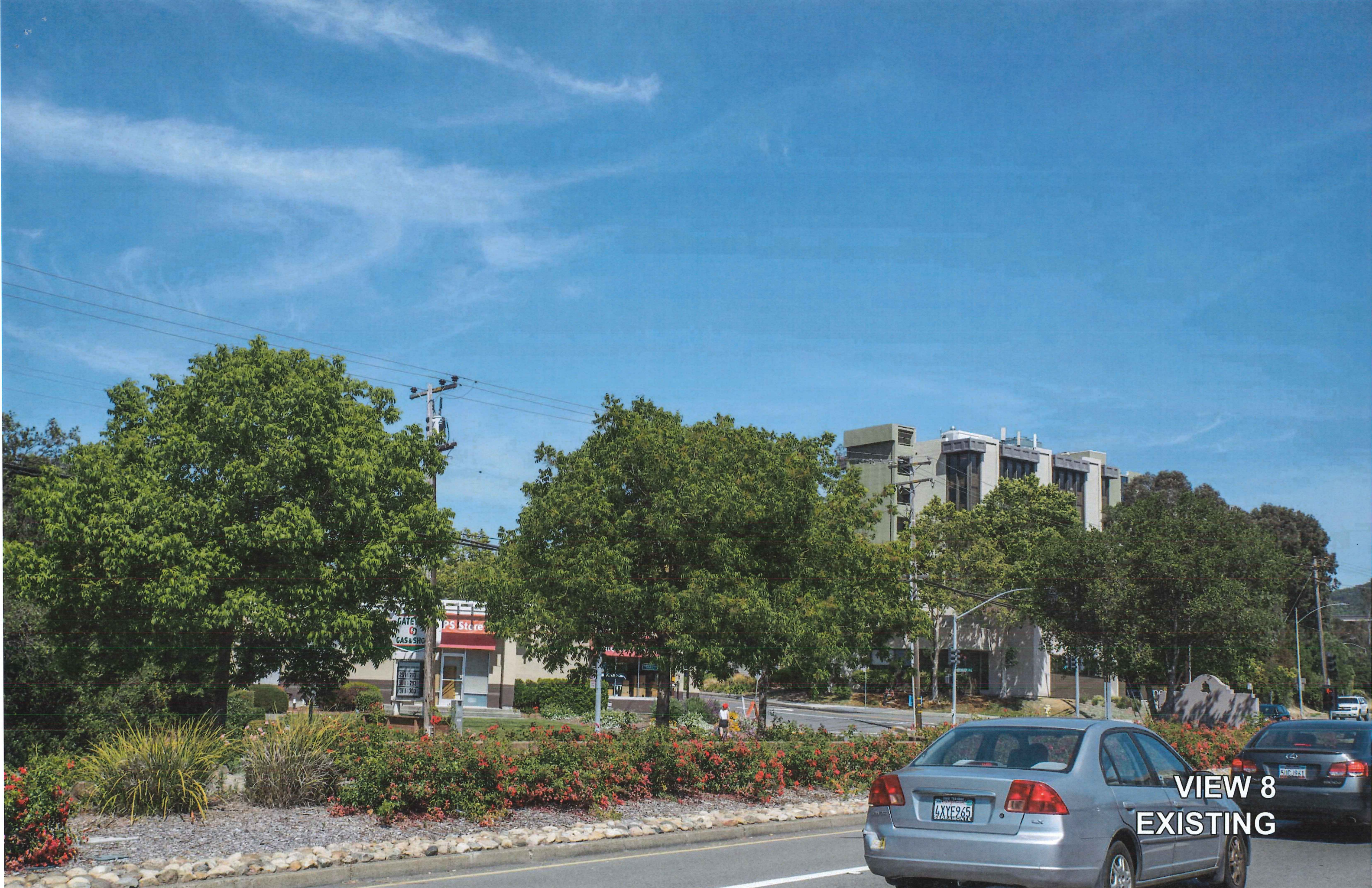
VIEW 8 EXISTING