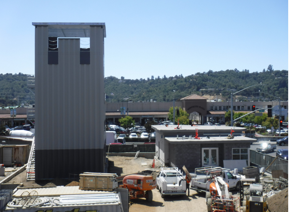
August 2018 progress pictures for Fire Station 52

Project Schedule Information — Note: Contractor's schedule shows work is behind schedule. July 29 is the original completion date.