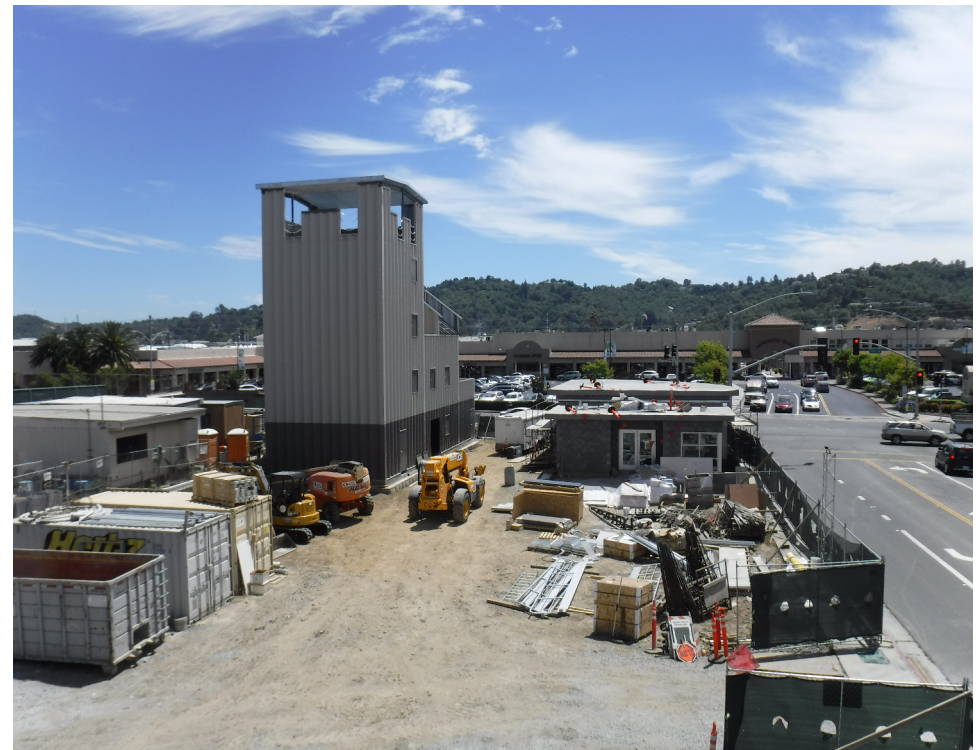
July 2018 progress pictures for Fire Station 52

Project Schedule Information – Note: Contractor's schedule shows work is behind schedule. July 29 is the original completion date.