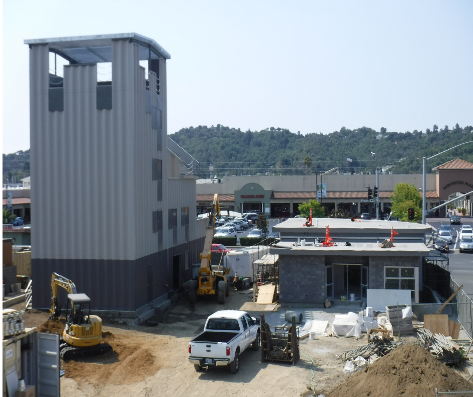
July 2018 progress pictures for Fire Station 52

During the month of July, Alten Construction continued MEP rough-in and framing at the Main Building. Fire proofing was completed. Exterior roofing/sheathing commenced. Drywall tape/finish occurred at the Classroom, as well as TPO roofing. The concrete decking for the Training Tower was completed while finishes commenced. Work began for the on-site/off-site utilities and storm drain.