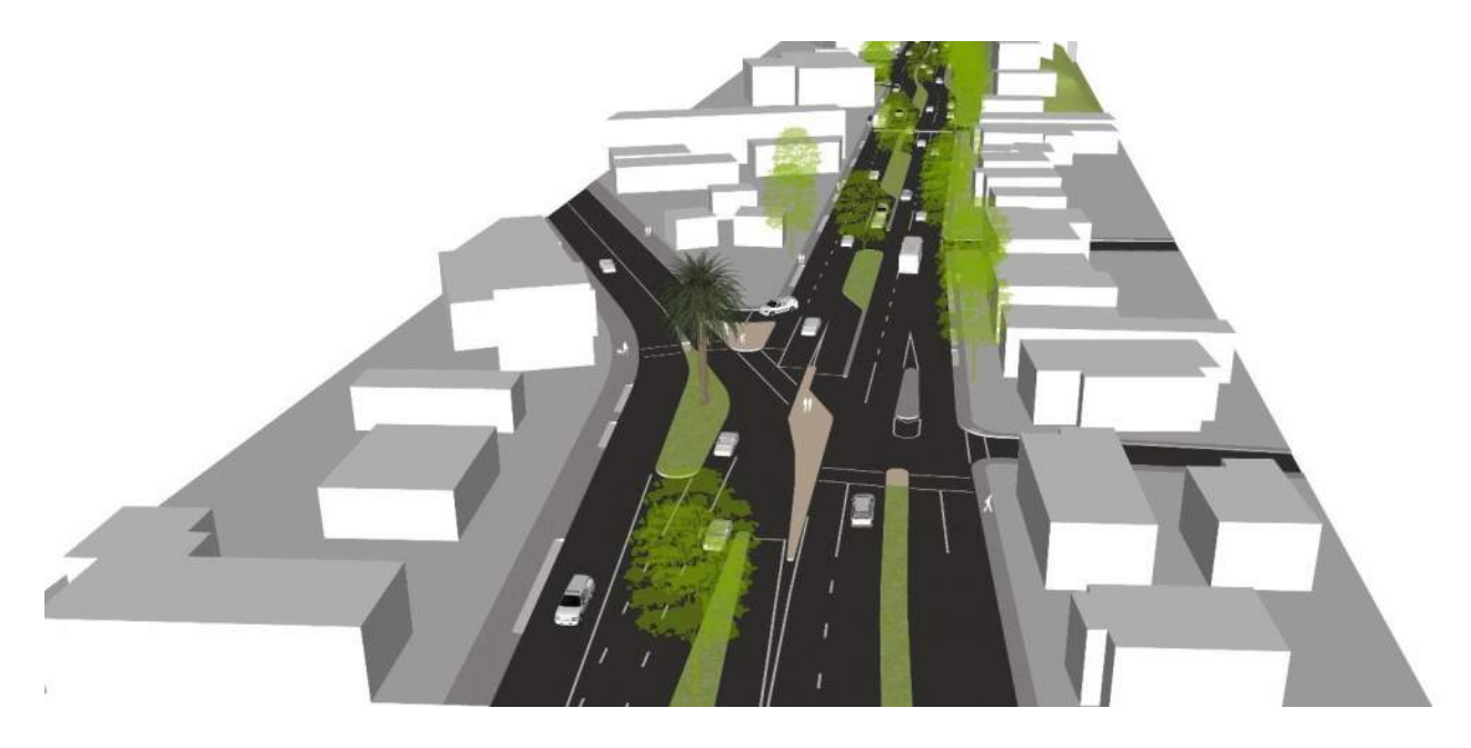
Figure D1: Fourth Street Intersection Existing Rendering

The project study team began to analyze the Fourth Street Intersection and came up with a few potential renderings for squaring off the intersection. After further discussions with the city and community, this intersection was removed from the scope due to schedule of additional analysis including traffic study and right of way mapping and acquisition, and funding.