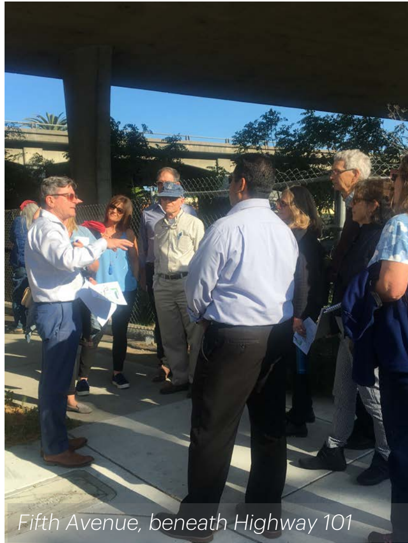
Fifth Avenue, beneath Highway 101