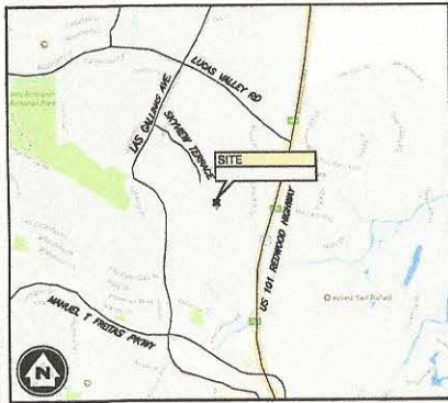
VICINITY MAP N.T.S.