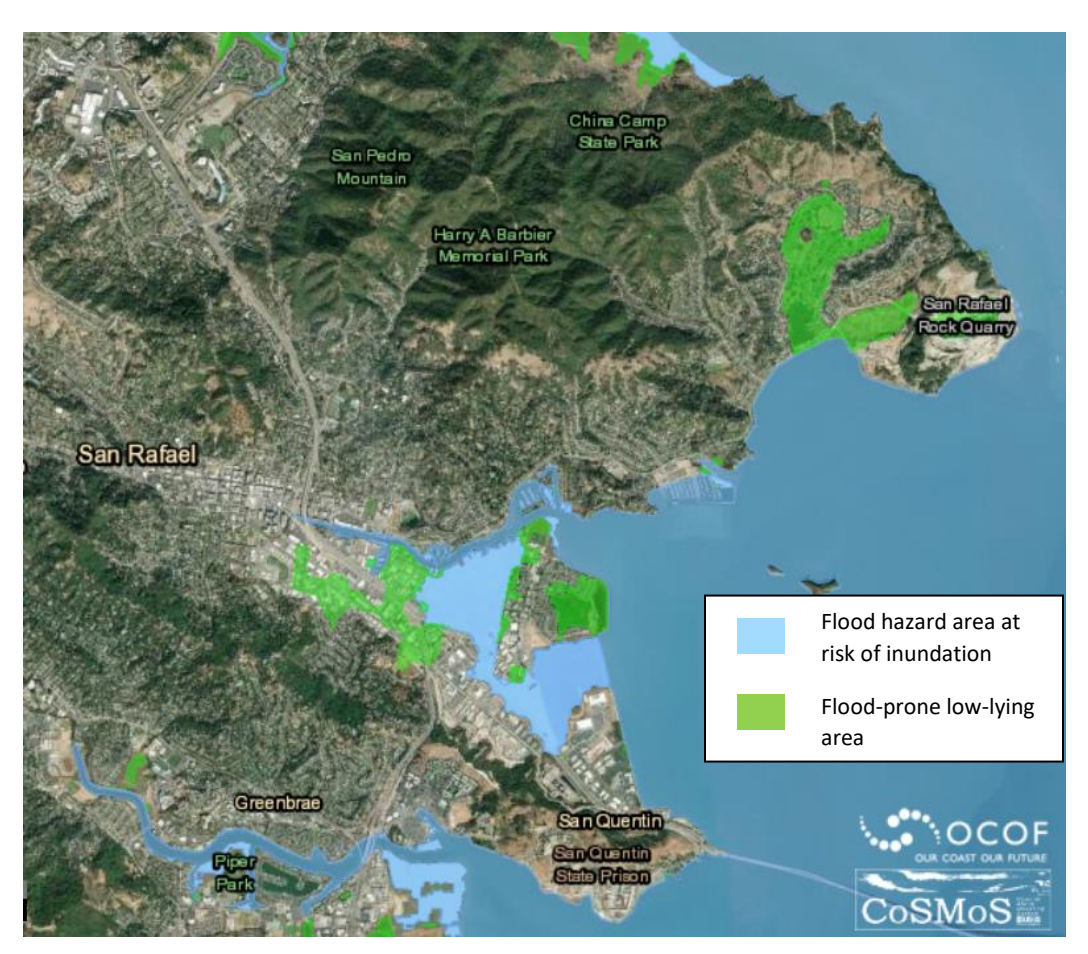
FIGURE 1: FLOODING EFFECT OF 25-CENTIMETER (10-INCH) SEA LEVEL RISE