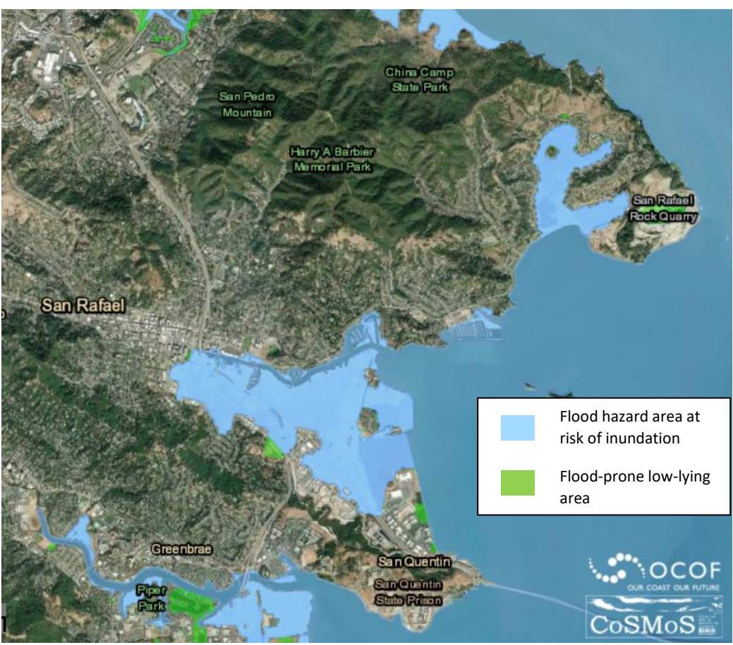
FIGURE 2: FLOODING EFFECT OF 75-CENTIMETER (2.5 FEET) SEA LEVEL RISE