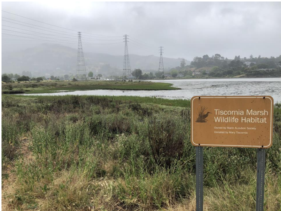
Tiscornia Marsh Restoration and Sea Level Rise Adaptation . 160888.1