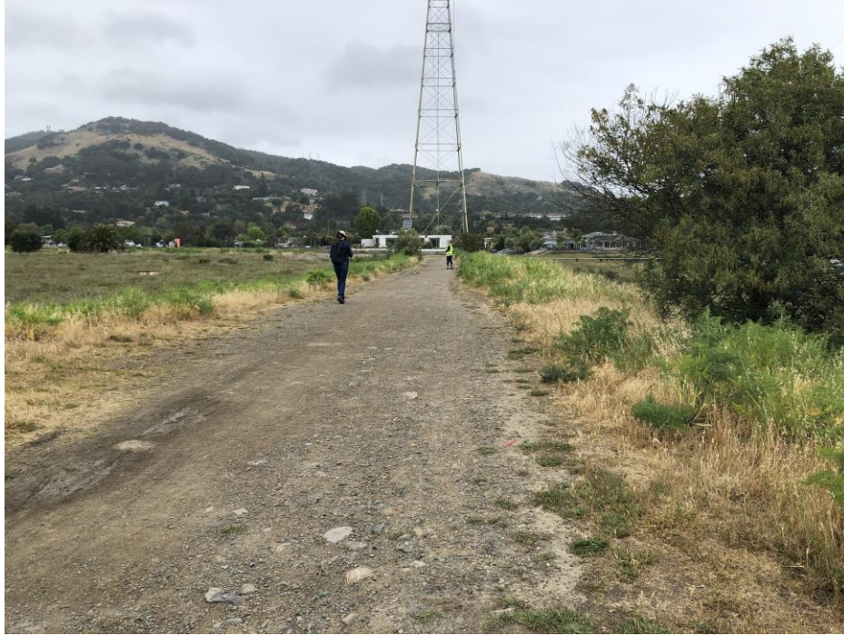
Tiscornia Marsh Restoration and Sea Level Rise Adaptation . 160888.1