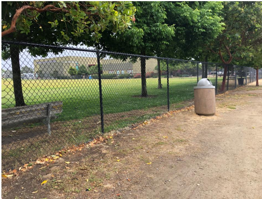
Tiscornia Marsh Restoration and Sea Level Rise Adaptation . 160888.1

San Rafael Creek tidal waters, mudflat, and tidal marsh and adjacent non-native grassland in the northern section of the Study Area looking north.