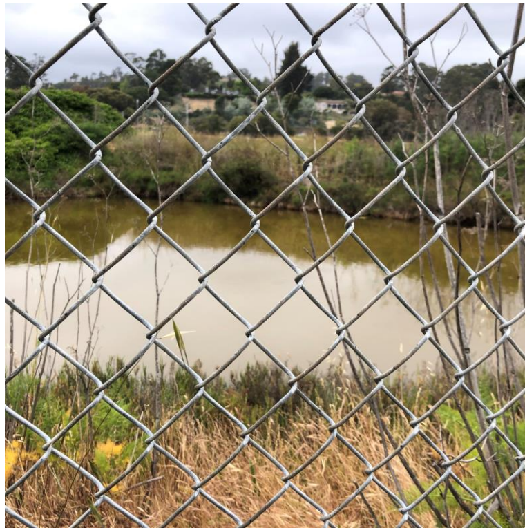
Tiscornia Marsh Restoration and Sea Level Rise Adaptation . 160888.1