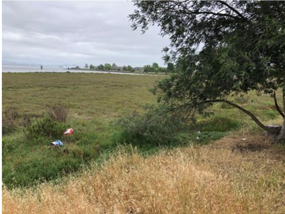
Tiscornia Marsh Restoration and Sea Level Rise Adaptation . 160888.1

Developed trail with annual grassland/ruderal vegetation looking north from central part of the Study Area.