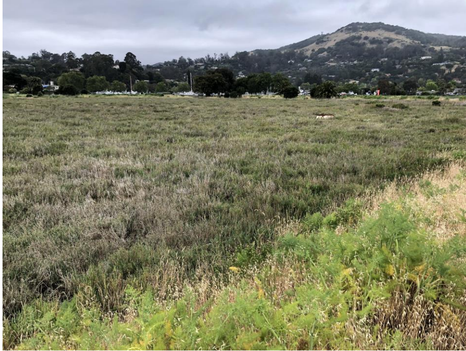
Tiscornia Marsh Restoration and Sea Level Rise Adaptation . 160888.1