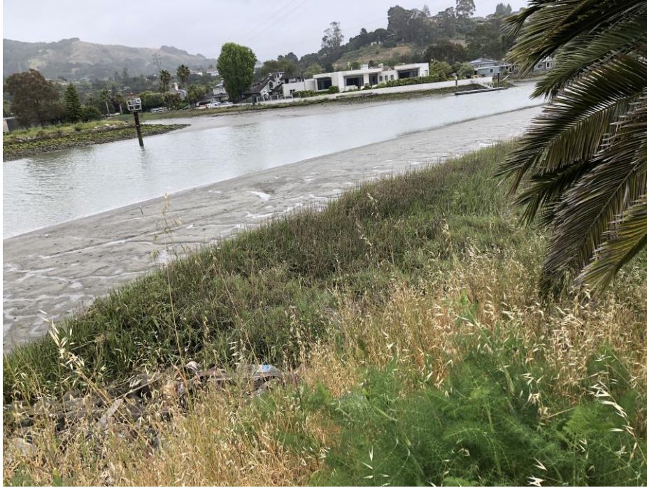
Tiscornia Marsh Restoration and Sea Level Rise Adaptation . 160888.1