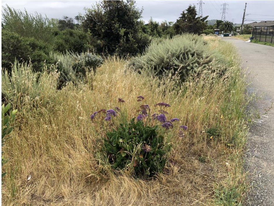
Tiscornia Marsh Restoration and Sea Level Rise Adaptation . 160888.1