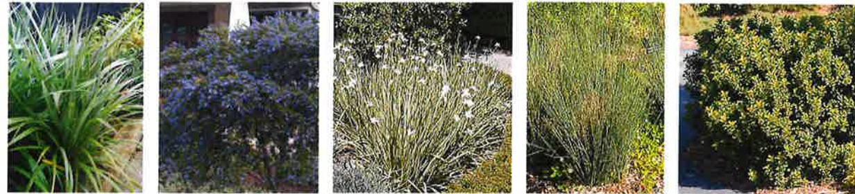
ASTELIA CHATHAMICA 'SILVER SPEAR' ASTELIA CEANOTHUS 'CONCHA' CONCHA LILAC VARIEGATED FORTNIGHT LILY/ DIETES GRANDIFLORA 'VARIEGATA' JUNCUS JUNCUS PATENS DWARF YEDDA HAWTHORN RHAPHIOLEPIS UMBELLATA 'MINOR'