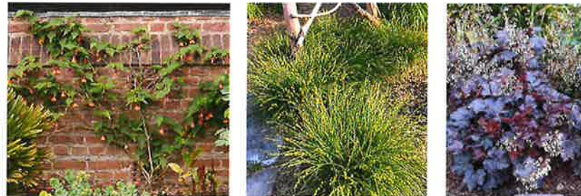
ABUTILON HYBRID FLOWERING MAPLE (ESPALIER) SEDEGE CAREX DIVULSA HEUCHERA 'PURPLE PALACE' PURPLE PALACE CORAL BELLS