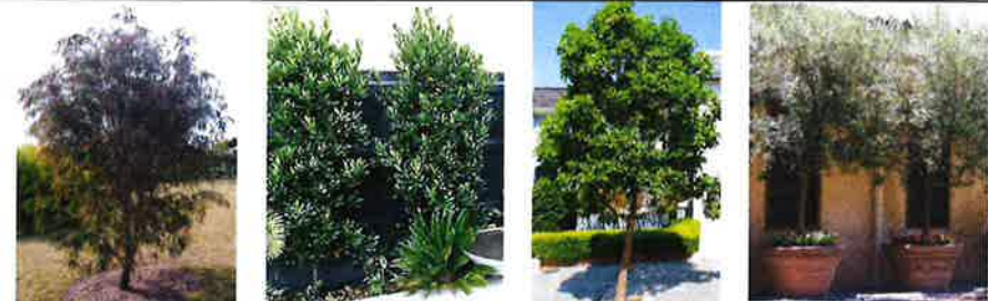
AGONIS FLEXUOSA 'BURGUNDY' BURGUNDY PEPPERMINT TREE LAURUS NOBILIS 'SARATOGA' GRECIAN LAUREL LOPHOSTEMON CONFERTA BRISBANE BOX OLEA EUROPEA 'SWAN HILL' FRUITLESS OLIVE (IN CONTAINER)