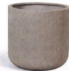
OVERSIZED ALL-WEATHER FICONSTONE CYLINDER PLANTER BY REJUVENATION (33"x33"x31")