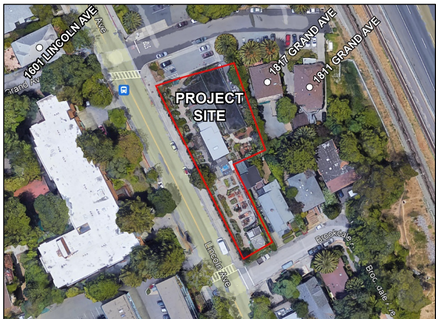
Figure 1: Project Vicinity

The project site is located between Highway 101 to the east and Lincoln Avenue to the west at the southeast corner of Lincoln Avenue/Grand Avenue on a reverse flag lot (Figure 1). The lot also has approximately 45-feet of frontage on Brookdale Avenue and is approximately 17,768 square feet, featuring a generally flat topography with an average northwest to southeast cross slope of eight percent. The site is currently developed with an approximately 930-square-foot commercial retail building and outdoor product sales area, formerly the Sloat Garden Center, which is no longer operational and will be demolished as part of the project. The site also contains ancillary improvements including two