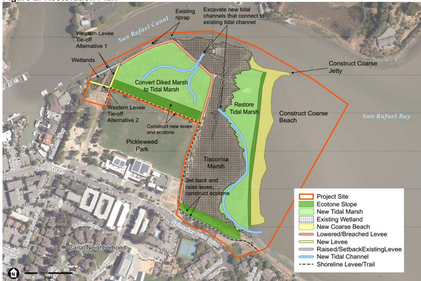
Figure 2: Restoration Plan

Since the initial development of the restoration plan, minor revisions to the plan have been made to align with several City-sponsored projects within the park and community center area. Among these projects is a storm drain outfall and trash capture program, which, if implemented, would necessitate some adjustments that would transition to and join with to tie-off the elevated western levee in the restoration plan.