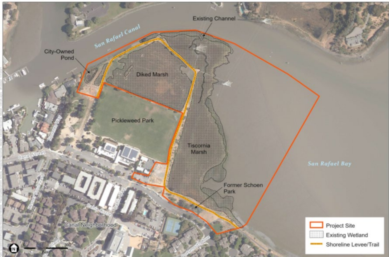
Figure 1: Tiscornia Marsh Restoration Project Location

The Tiscornia Marsh has experienced considerable erosion along its bayward edge, which is attributed to direct wave action from the bay. Over the last 30 years, approximately three acres of the tidal marsh has