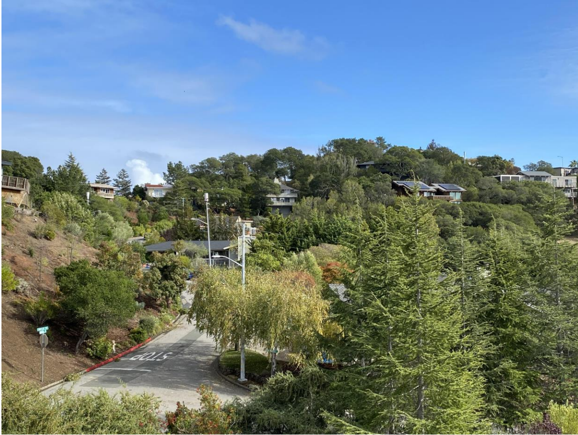
TYPICAL MEDIUM AND DARK EARTHTONES OTHER HOMES IN LOCH LOMOND AREA