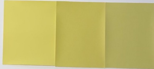
ENTRY CANOPY & ENTRY DETAIL PANELS (EXTERIOR STUCCO OR METAL PANELS):