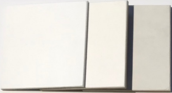
EXTERIOR STUCCO SIDING (INTEGRAL COLOR STUCCO):