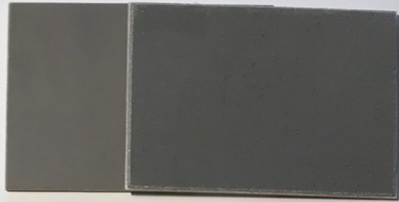
EXTERIOR STUCCO/CEMENT BOARD SIDING: