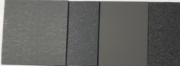
EXTERIOR RIBBED/CORRUGATED METAL SIDING: