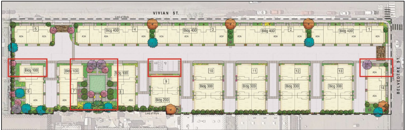
Figure 2: Revised Site Plan