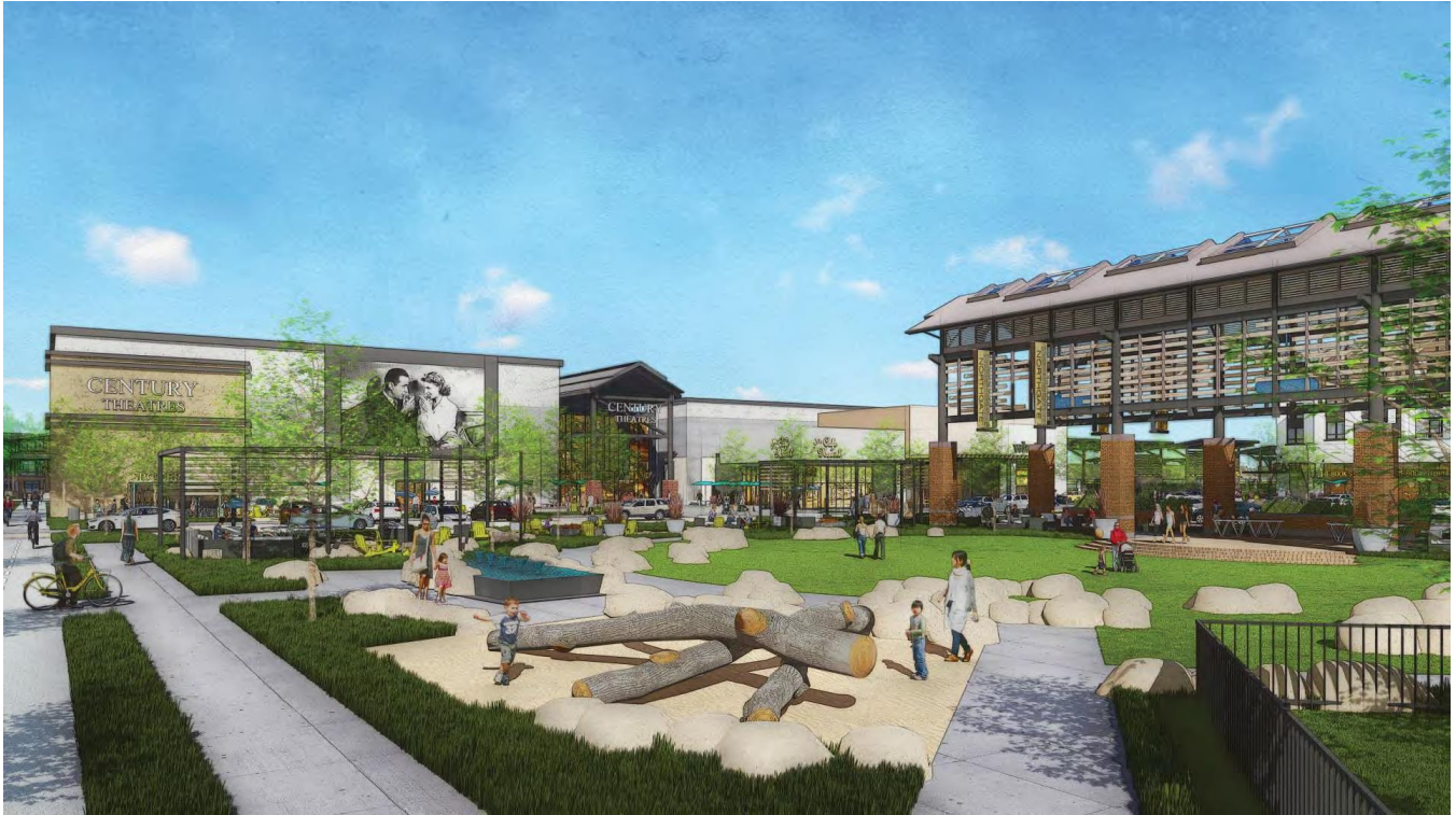
This image a view of the proposed Town Square with amenities and pavilion, looking from north to south towards the cinema.