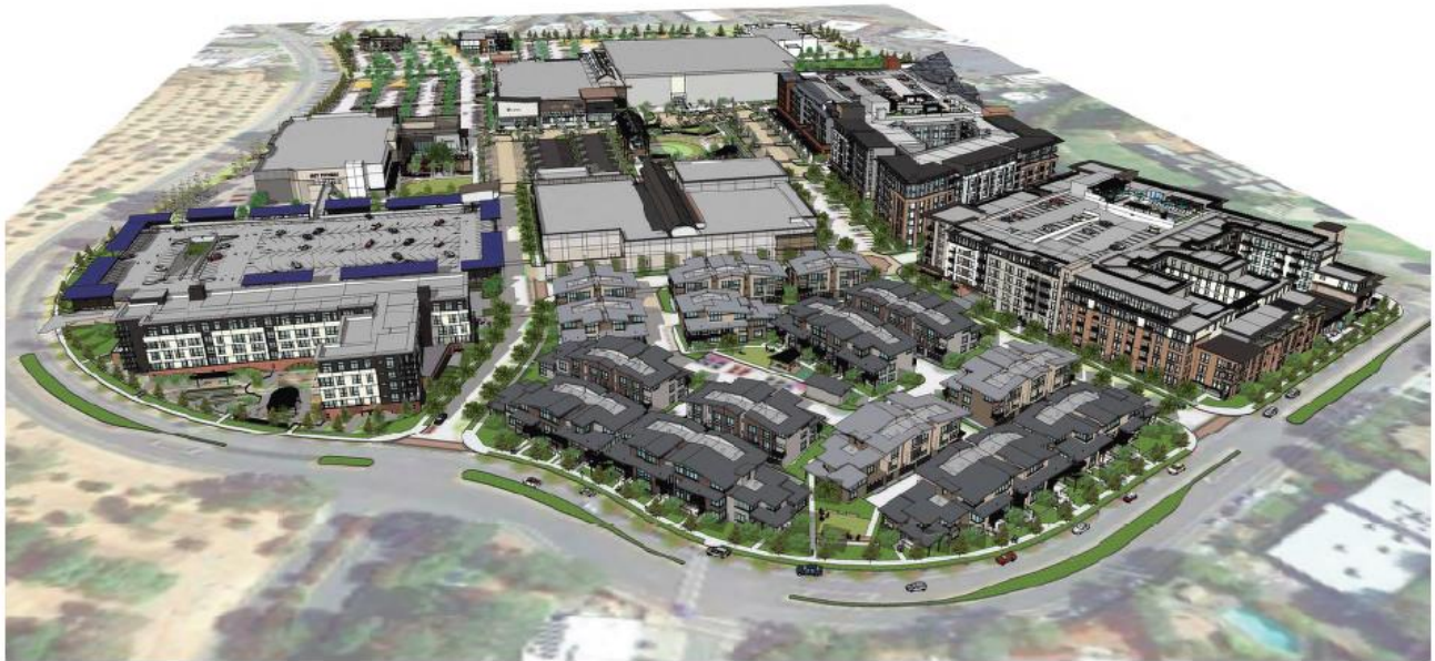
Figure 3 - Aerial View 2025

Following are images of the revised elevations. See project plans for full set of drawings.