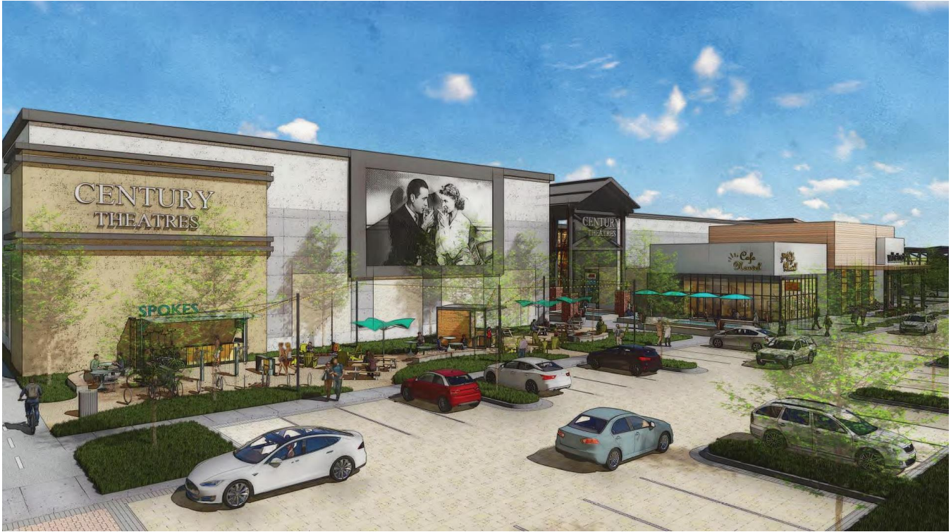
This view shows the front of the cinema with the bicycle area in front, looking southerly.