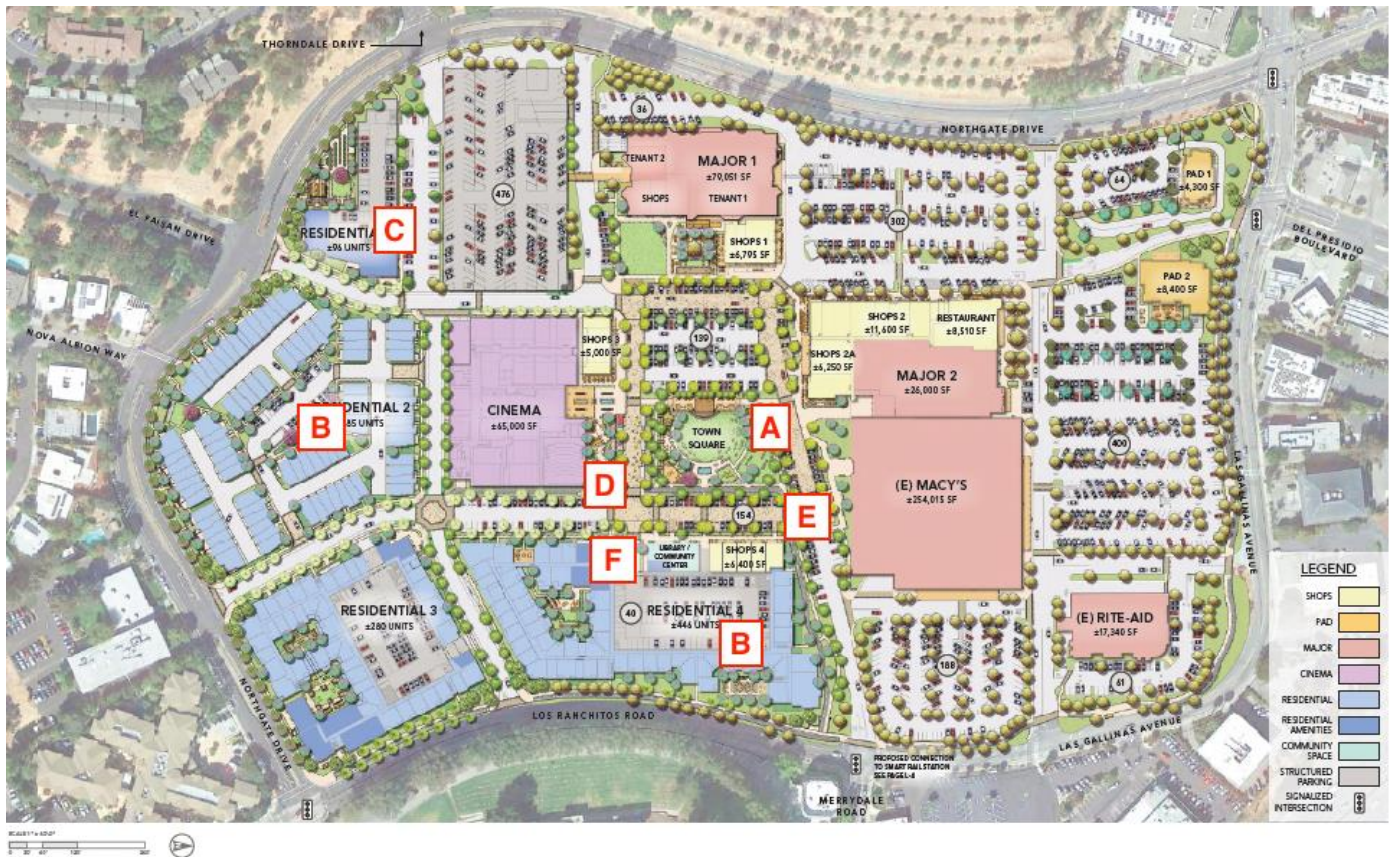
Figure I – Revised 2025 Proposed Site Plan

Following is an overview of the revised plans.