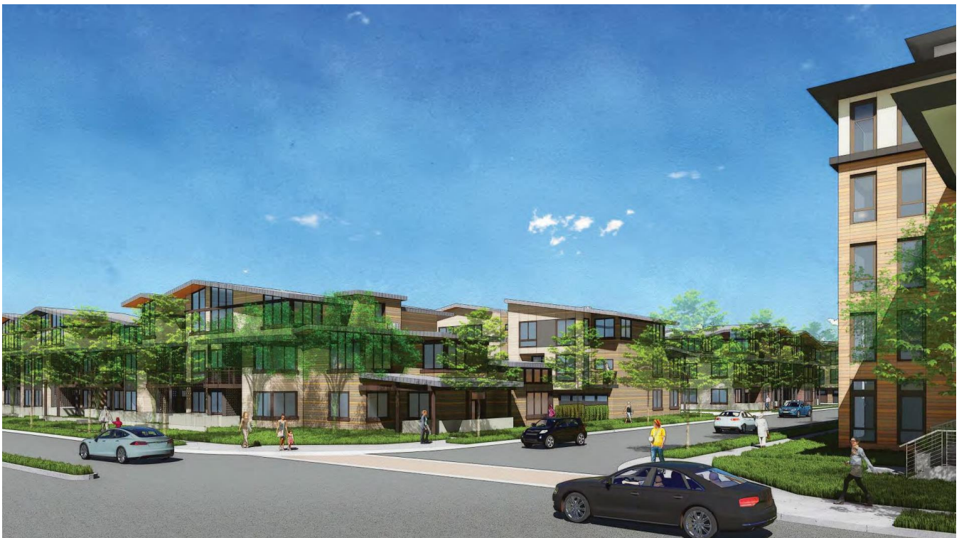
This view shows the proposed three-story townhomes looking northerly from Northgate Drive, showing the massing from the residential areas to the south.