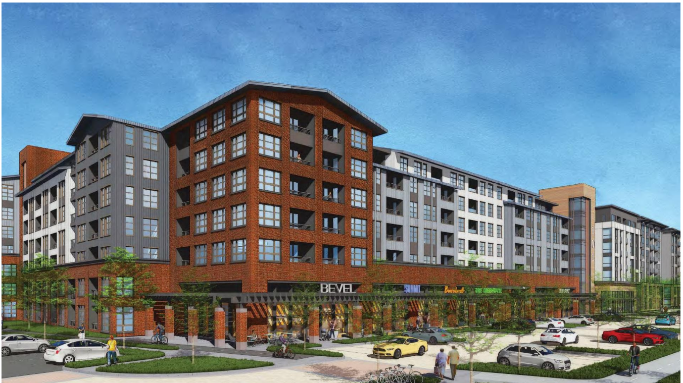
This view shows the seven-story apartments (Residential 4) looking easterly from the Town Square.