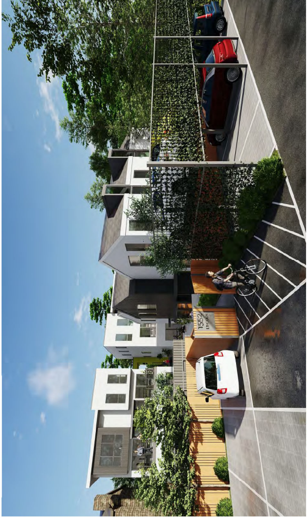
2 BROOKDALE AVENUE STREET VIEW