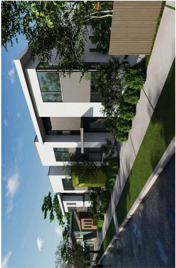
1 LINCOLN AVENUE LOOKING NORTH