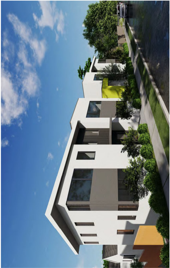
2 LINCOLN AVENUE LOOKING SOUTH