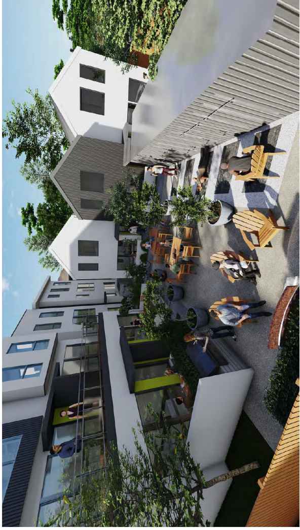
1 COURTYARD VIEW 3