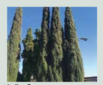
Italian Cypress (Cupressus sempervirens)

Combustible Vegetation and additional fire hazardous plants include: Black Sage; Chamise/Greasewood; Chaparral Pea; Chinquapin, Giant; Coyote Brush;