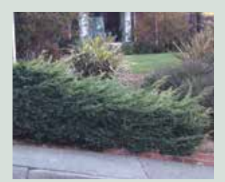
Juniper (genus Juniperus)

The plants below are considered Combustible Vegetation by the City of San Rafael (SRMC 4.12.020) and must be removed within 30 feet of structures: