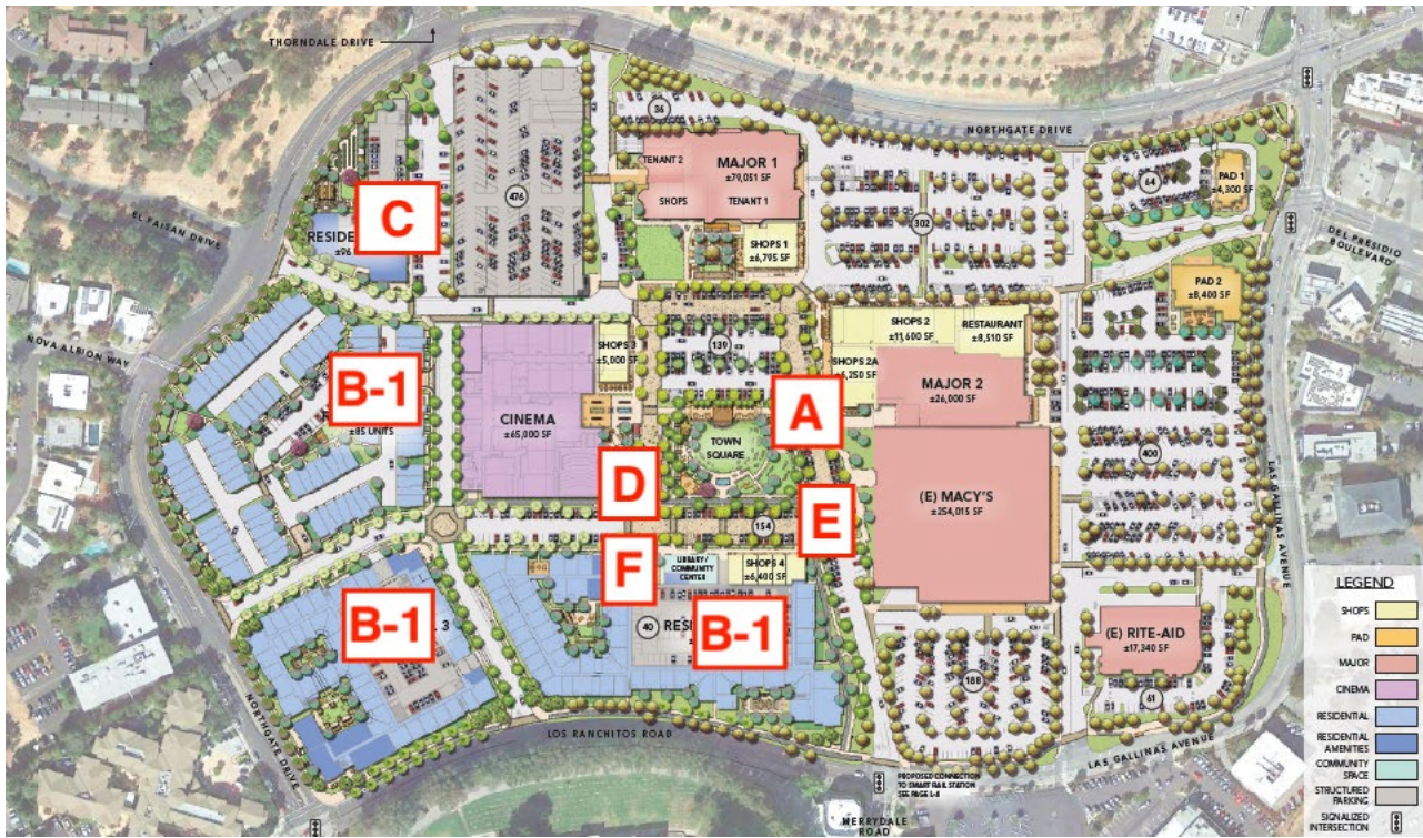
Figure I – Revised 2025 Proposed Site Plan

A. Town Square. The original plan included a 35,000 square-foot Town Square that would be constructed as part of Phase II. The applicants have increased the size of the proposed Town Square by 15,000 square feet. The Town Square is now 50,000 square feet and is proposed to be constructed in Phase I. This Town Square would serve as a focal point and as a community gathering area. Labeled A in Phase I. The Town Square would be owned and maintained by MerloneGeier and would include the following amenities: