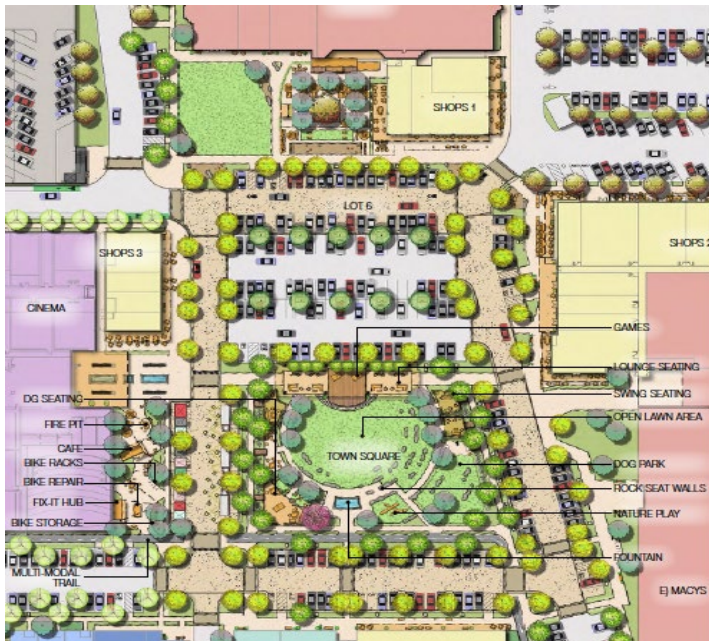
Figure 2 – Detail of Town Square