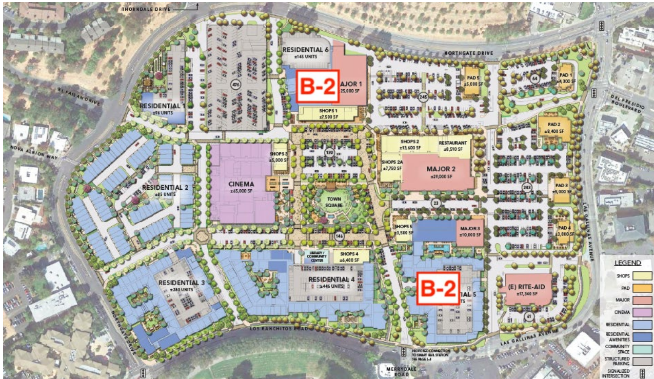
Figure 4 – Revised 2040 Proposed Site Plan

C. Affordable Housing. The original plan proposed 96 affordable housing units contained within a 1.91-acre parcel as part of Phase I. The PC expressed support for this proposal, provided that the additional affordable units would be dispersed throughout the development. Since that time, EAH Housing has joined the applicant team. The applicant proposes to donate the site to EAH who will develop the site in Phase I with affordable housing at varying income levels and will provide on-site support services. Labeled C in Phase I.