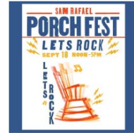
San Rafael PorchFest September 18, 2022 Learn more.