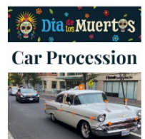
Dia De los Muertos Car Procession October 22, 2022 Learn More.