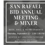
San Rafael BID Annual Meeting & Mixer Liberation Taproom September 22, 2022 Learn more.