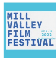
Mill Valley Film Festival October 6-16, 2022 Learn more.