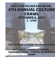
West End Culture Crawl October 8, 2022 Learn more.