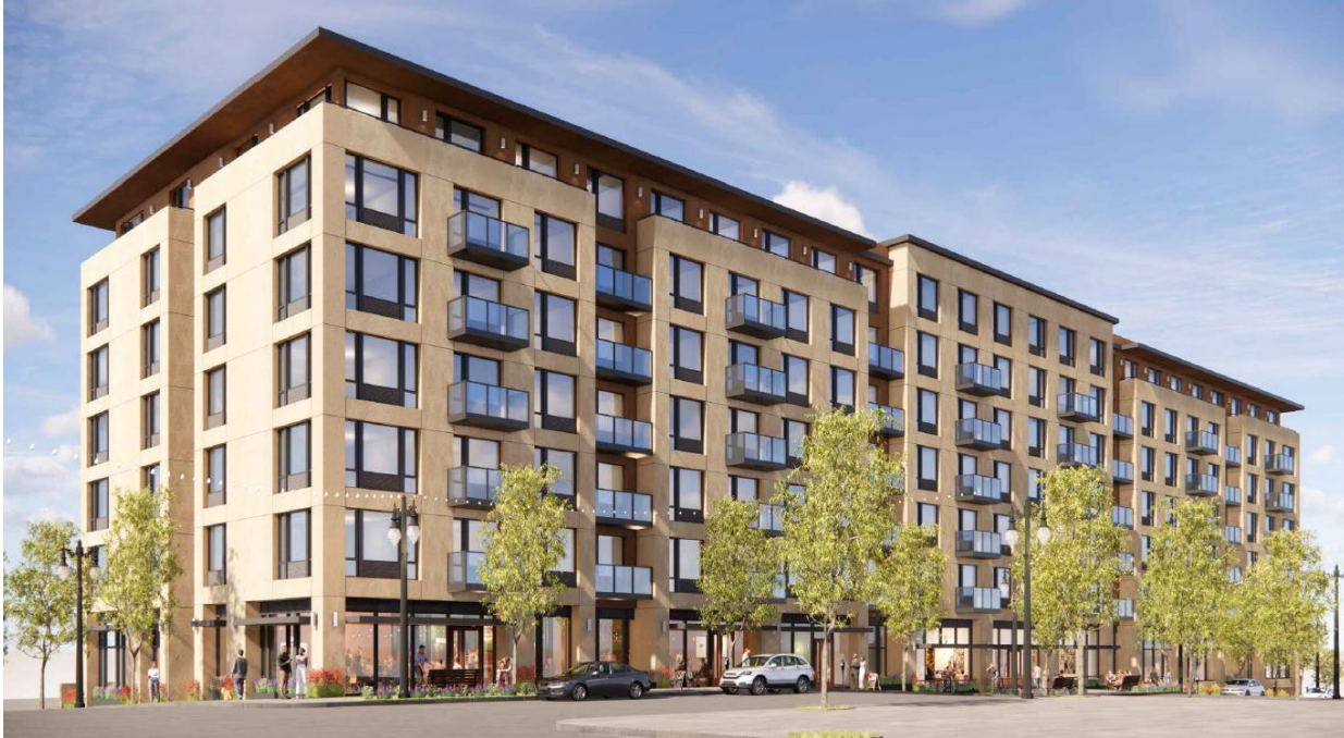
Figure 2: Rendering Looking Southwest