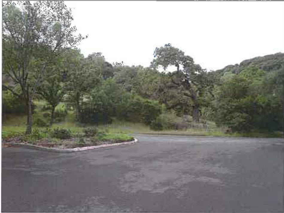
Photo 1: Overview of natural area in northern portion of Study Area.