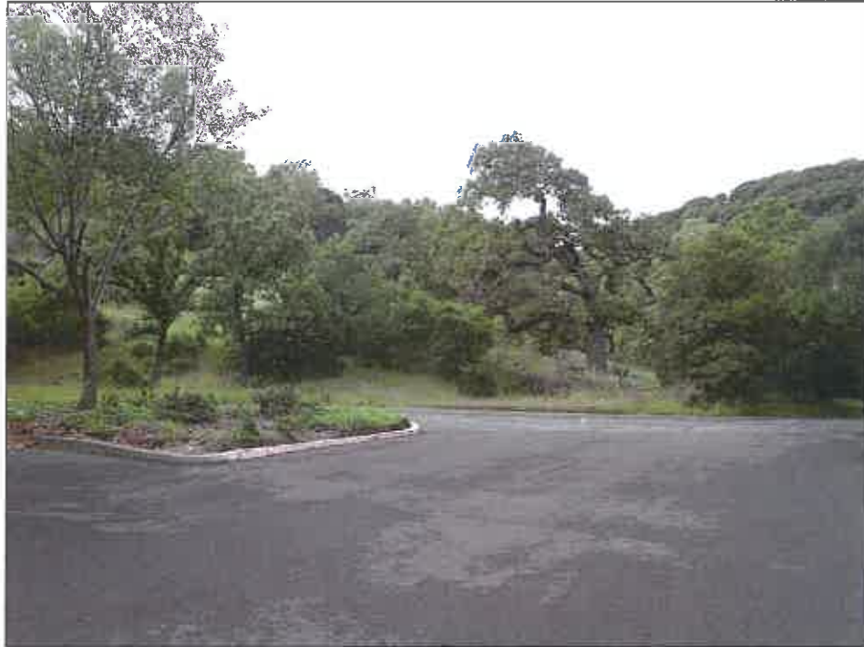
Photo 1: Overview of natural area in northern portion of Study Area.