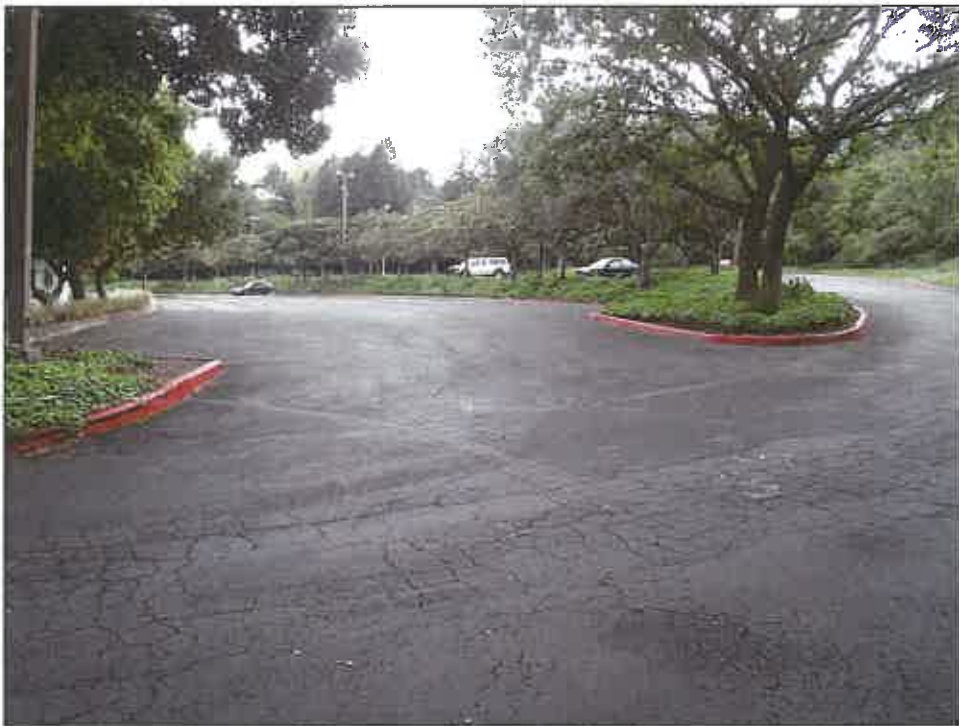
Photo 2: Overview of the upper parking area, looking from Las Gallinas Creek.