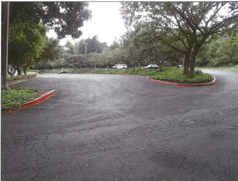
Photo 2: Overview of the upper parking area, looking from Las Gallinas Creek.