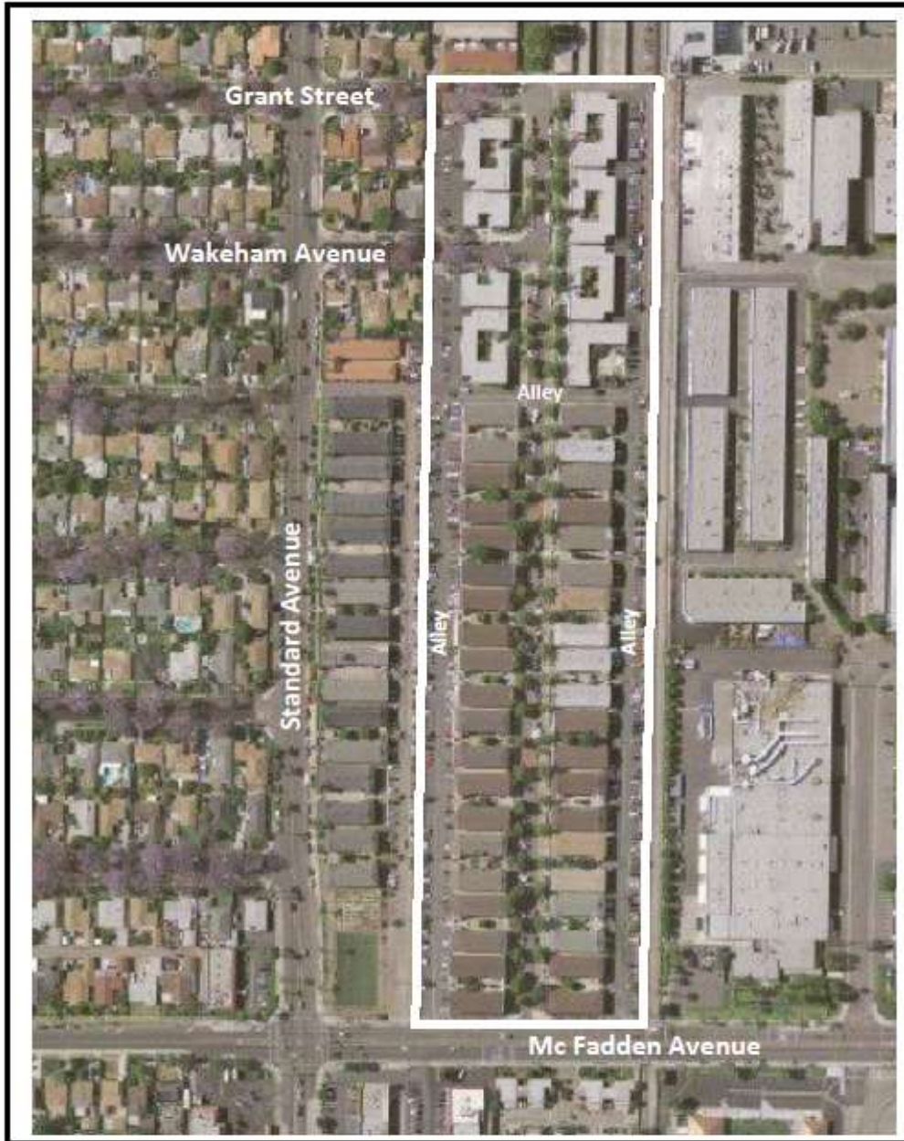
ATTACHMENT 1 CORNERSTONE VILLAGE PROJECT AREA