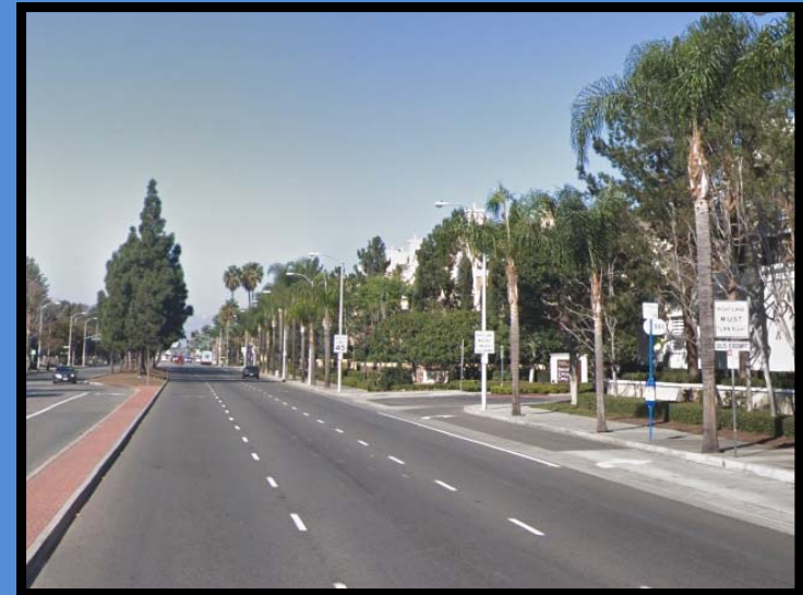
Main St. North of MacArthur Blvd.