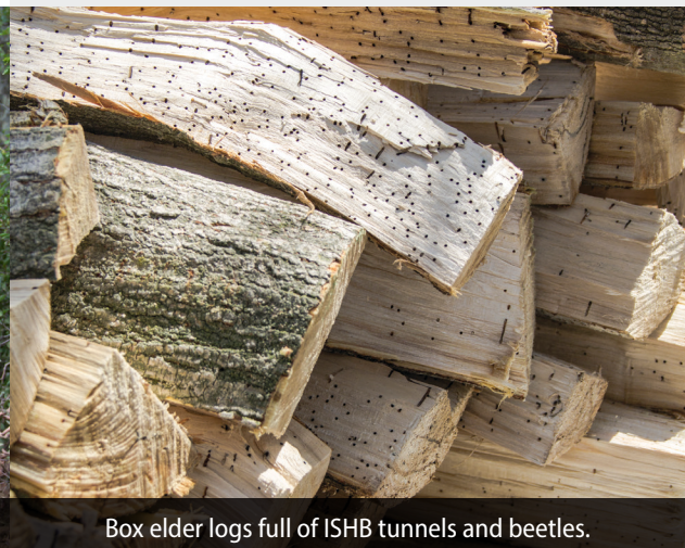
Box elder logs full of ISHB tunnels and beetles.