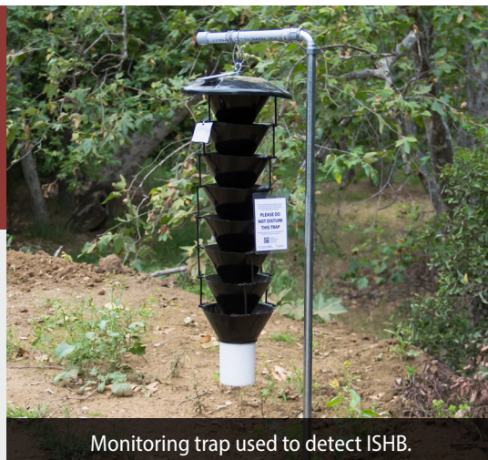
Monitoring trap used to detect ISHB.