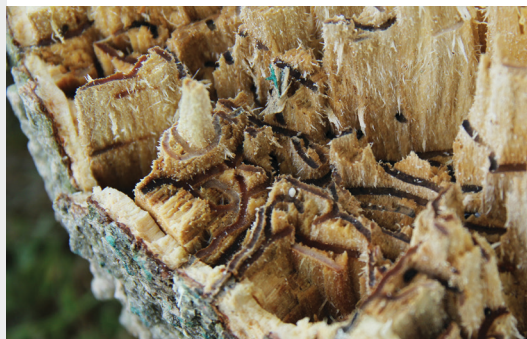
ISHB galleries in a box elder branch.

The beetles attack landscape, agricultural, riparian, and native trees. Common trees like sycamore, cottonwood, willow, valley and Engelmann oak, avocado, white alder, and box elder appear to be especially susceptible. See the list of reproductive host trees (trees that support beetle reproduction and are susceptible to the disease) at www.ishb.org .