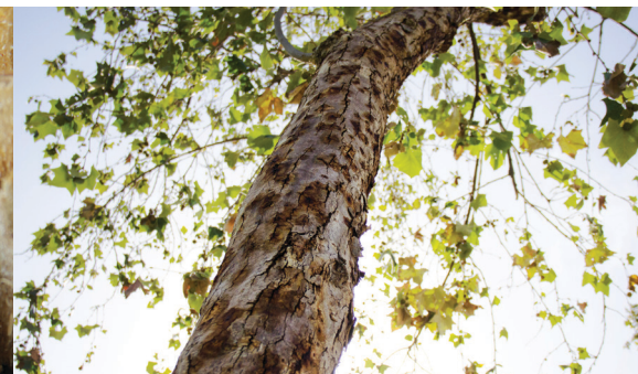
ISHB attacks on Mexican sycamore.