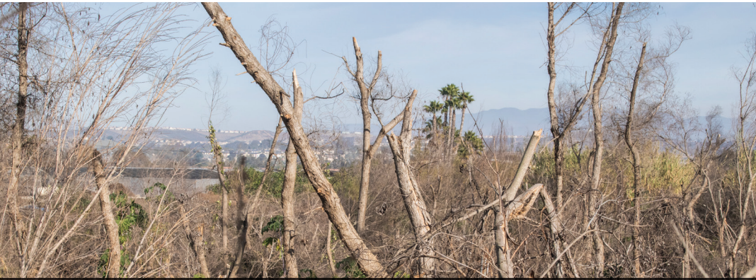
Willows in a San Diego creek devastated by ISHB.