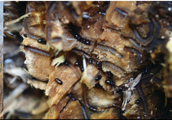
ISHB galleries in castor bean wood.

Two exotic, invasive beetles are causing increasingly extensive damage to Southern California's urban trees, native and riparian forests, and avocado groves. Thousands of severely affected trees have died or been removed in both natural and landscaped areas.