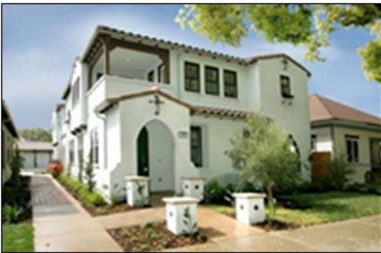
San Miguel Residence