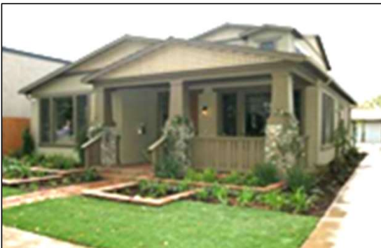
San Miguel Residence