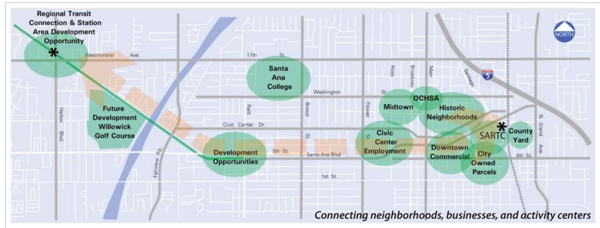
Note: This map was generated as part of outreach conducted for the Santa Ana Transit Vision in September 2010.