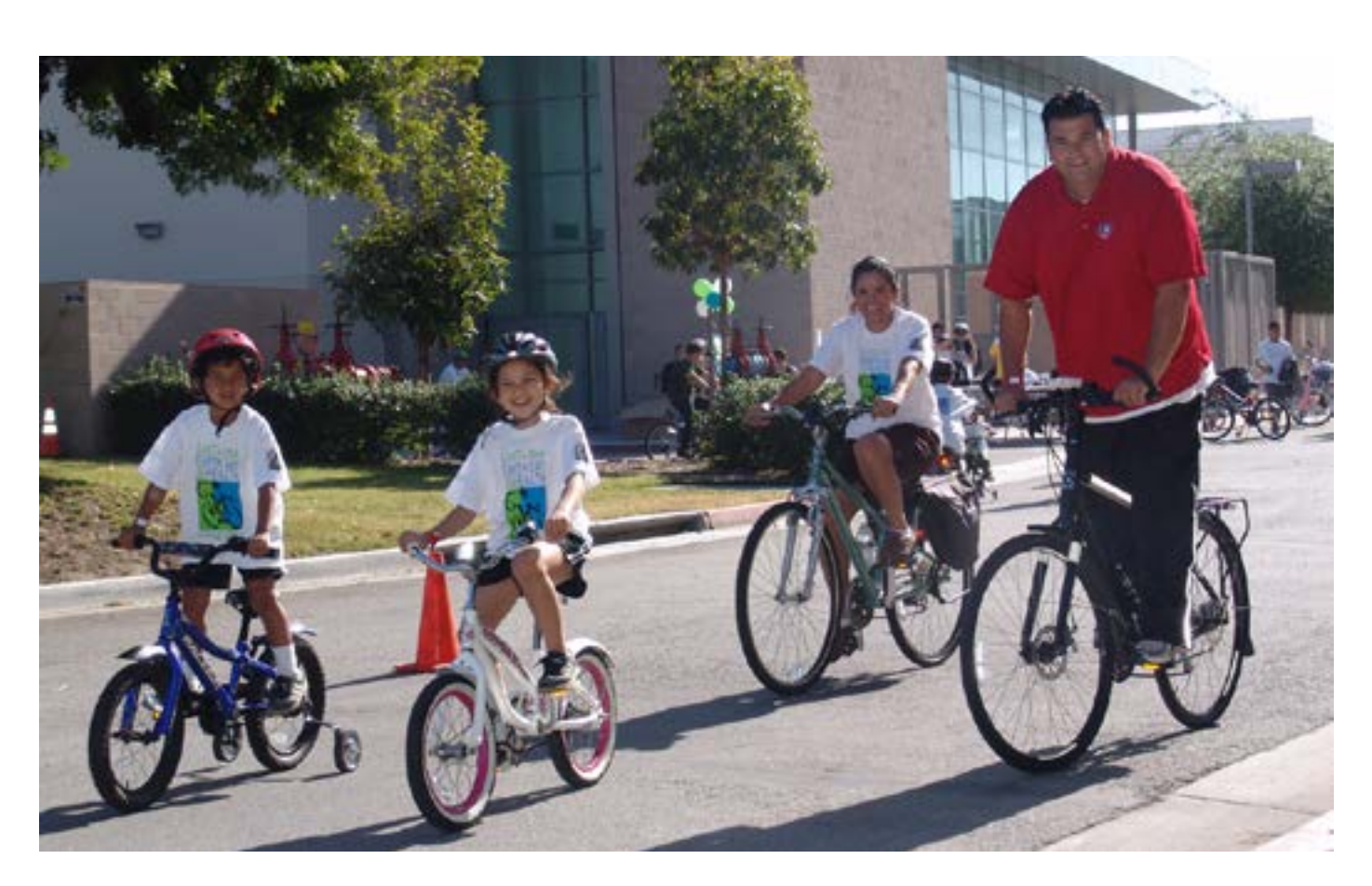
▲ Santa Ana Earth Day and Health Fest

The City of Santa Ana provides information and resources to live more sustainably and to enhance personal health, fitness, and active living through events like the 2011 Earth Day and Health Fest at Centennial Park.