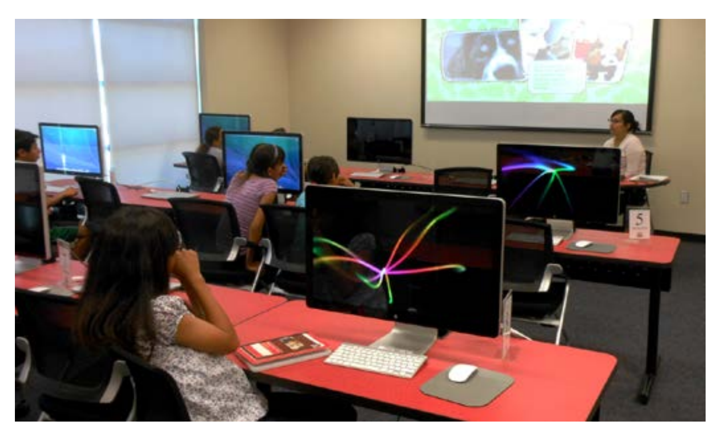
▲ Garfield Community Center

Dozens of plans and programs implemented by the City and other agencies and organizations overlap with the goals and policies of the Community Element. One example is the Santa Ana Community Arts and Culture Master Plan, which established goals and strategies on topics including cultural equity, infrastructure for the arts, communitywide access, youth programming, and placemaking.