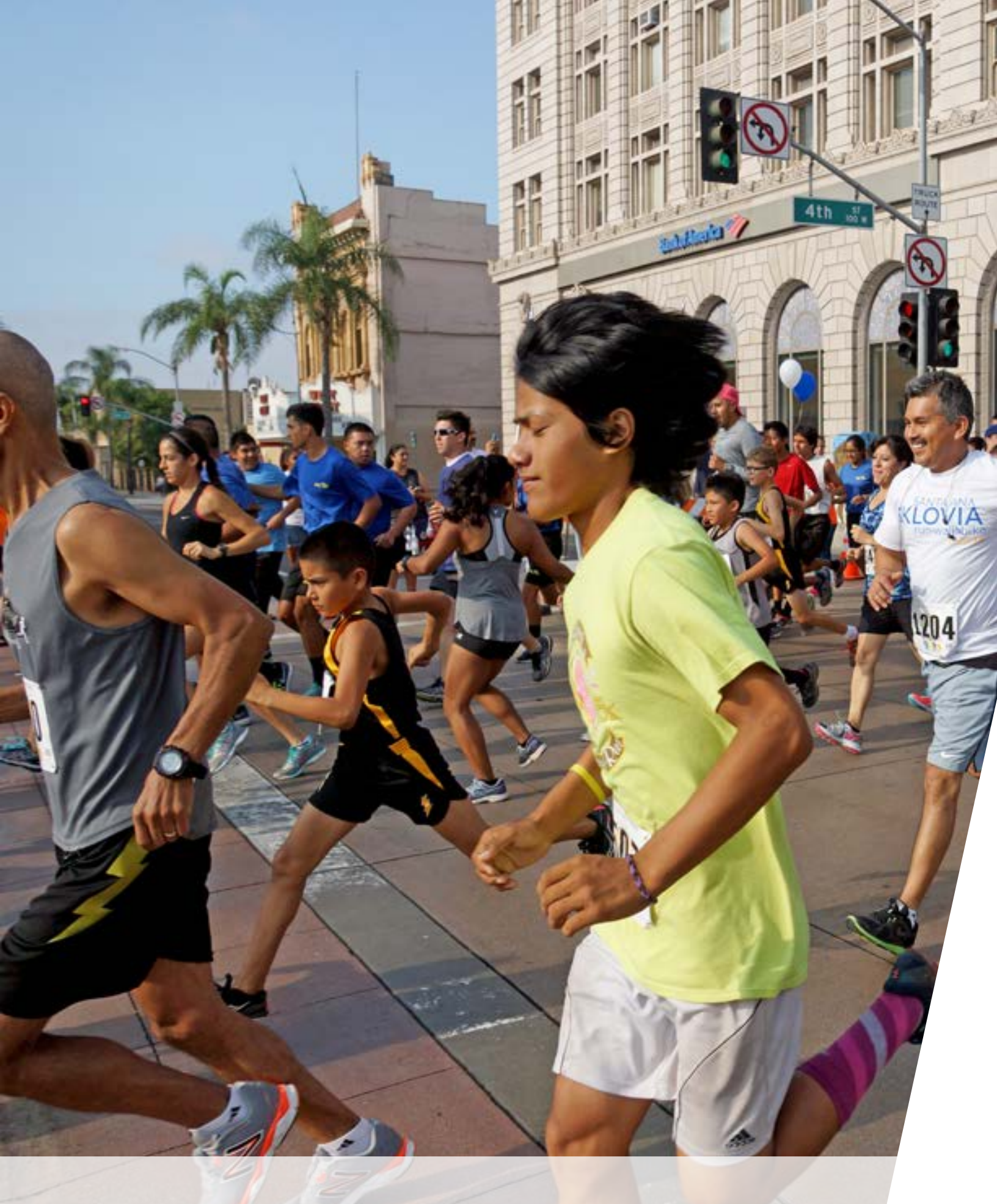
DTSA 5K. People of all ages and abilities showed up to participate in the City's annual 5K fun run in downtown Santa Ana (2016 event shown here). After the 5K run, the streets remained closed for the start of the Ciclovia event, when everyone was invited to walk, run, or bike while stopping to visit local eateries, stores, and health and wellness booths.