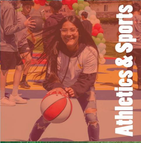
Athletics & Sports