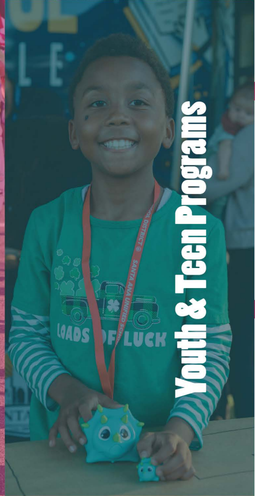
Youth & Teen Programs