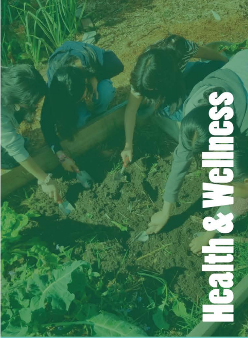
Health & Wellness