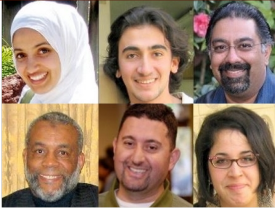
Islam and Muslims