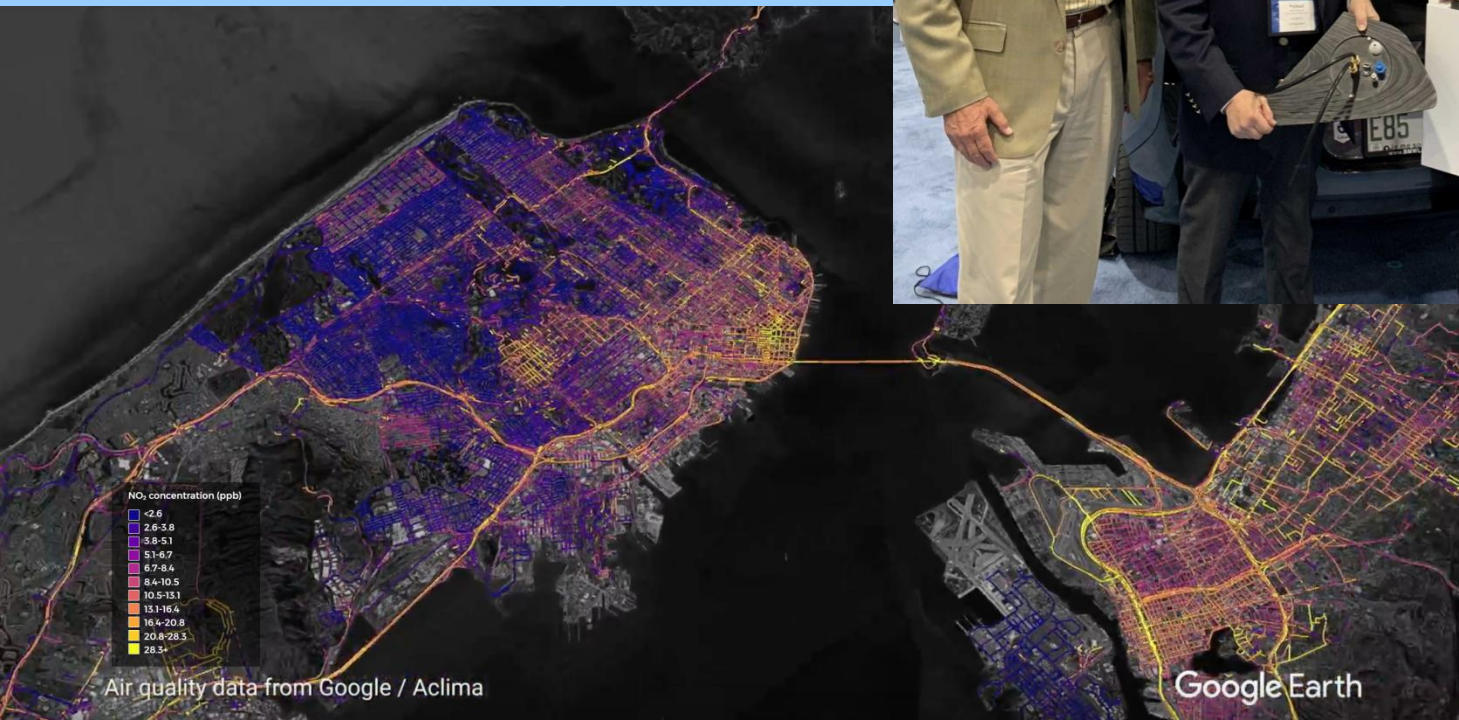
Air quality data from Google / Aclima