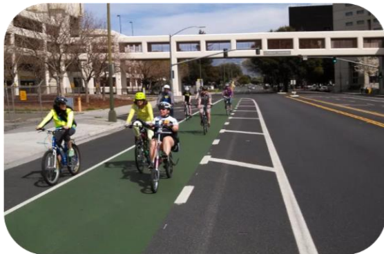
Transportation Demand Management / Mode Shift