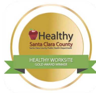
Worksite Wellness / Healthy Worksites