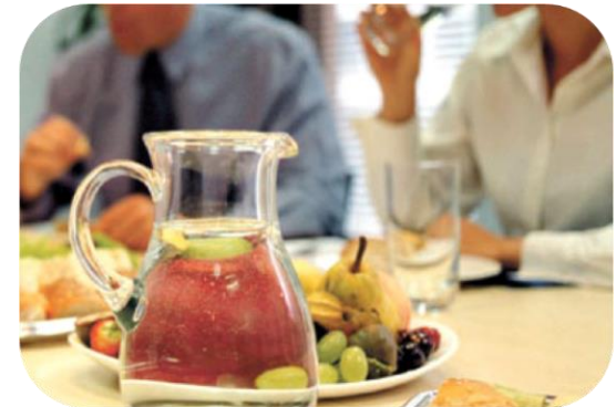
Nutrition / Procurement Standards